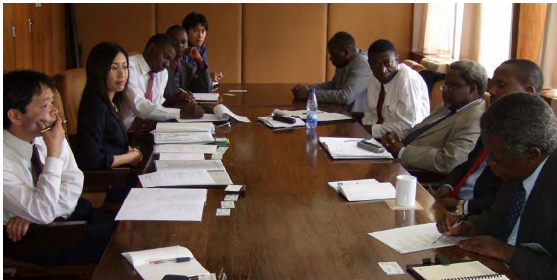
Photo 1: Meeting with ESCOM (Assistance for power sector basic study of JICA)