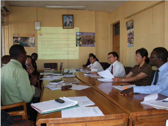
Photo 1 3rd JCC Meeting