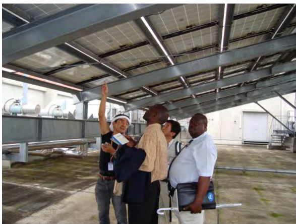
Photo 11 C/P training at Tsukuba Solar Center.