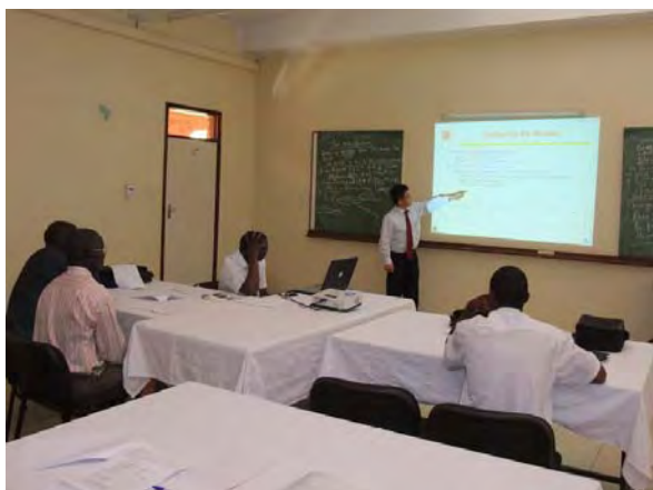
Photo 5 Follow-up training for trainers