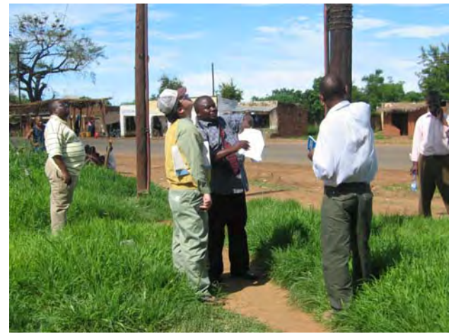
Photo 10: Distribution advisor is confirming inspection procedure of ESCOM