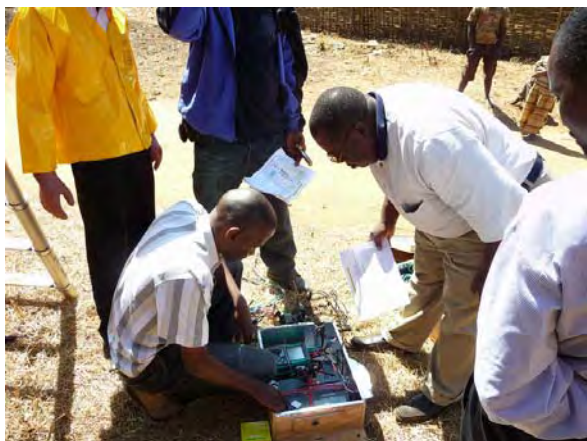
Photo 1 Preparation of equipment to measure actual load of the TC.