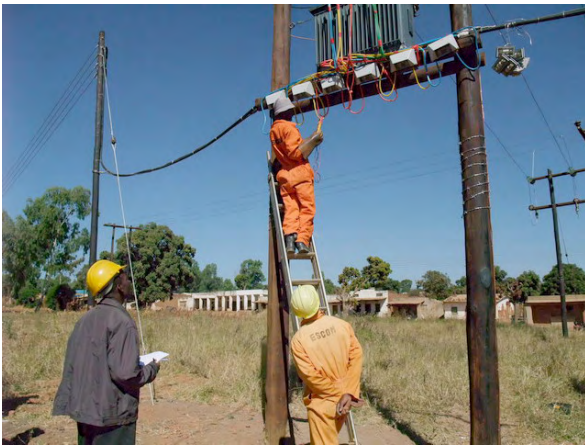
Photo 3 Inspection by ESCOM