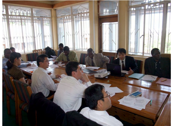
Photo 2 3rd JCC Meeting