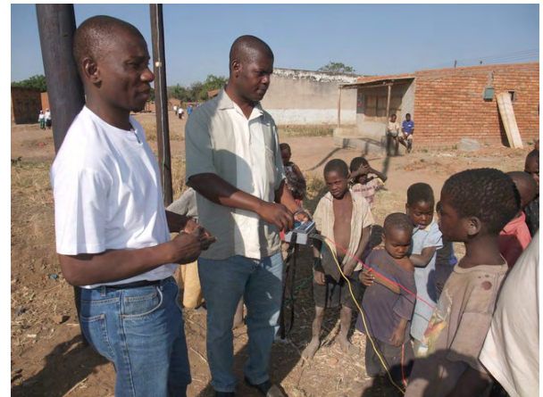
Photo 4 Measurement of earth resistance by DOE