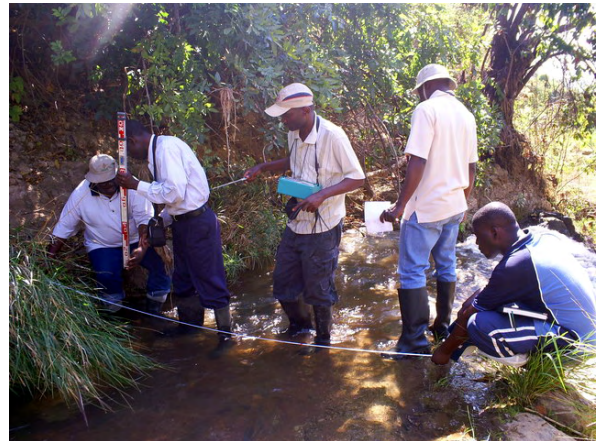
Photo 8 Measurement of water flow.