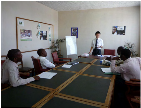
Photo 9 Lecture of distribution technology