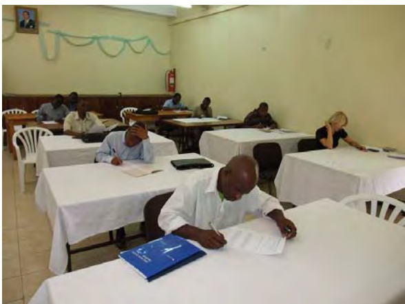
Photo 11 Final Assessment to evaluate the level of understanding