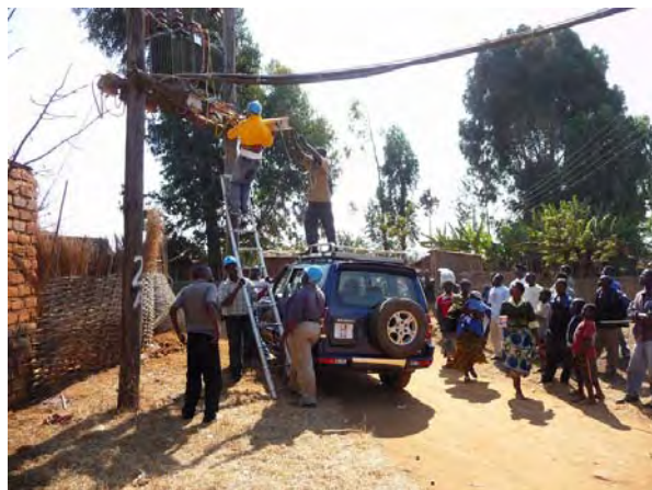
Photo 2 Installing data logger at the transformer