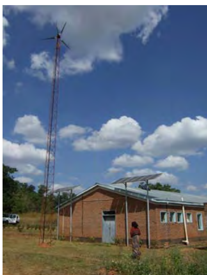
Photo 4: A wind and PV hybrid system (Main energy source is from PV because of no wind)