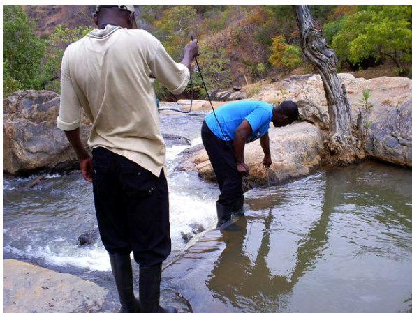
Photo 9 Measurement of water flow using flow meter.