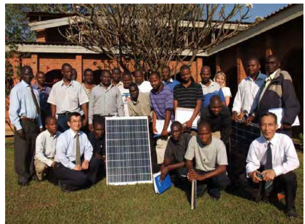
Photo 12 Group photo