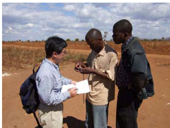
Photo 3: Technical transfer on measurement by GPS at an electrified TC