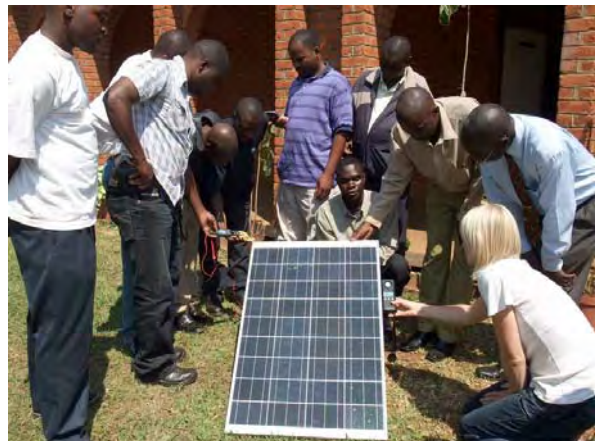
Photo 10 Hands-on practice at Basic Course