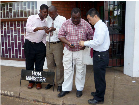
Photo 3 Practice of GPS