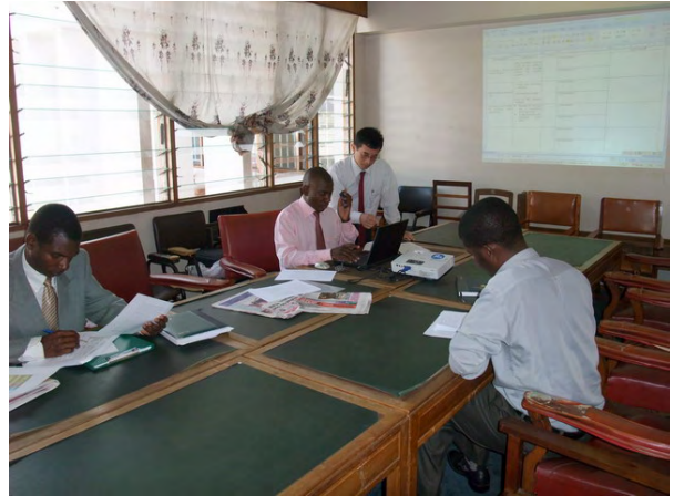
Photo 2 Preparing Challenge Sheet