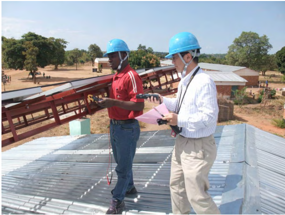
Photo 7 Inspection of PV array