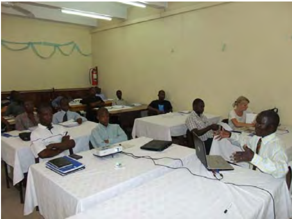
Photo 9 Lecture by trained trainer at Basic Course