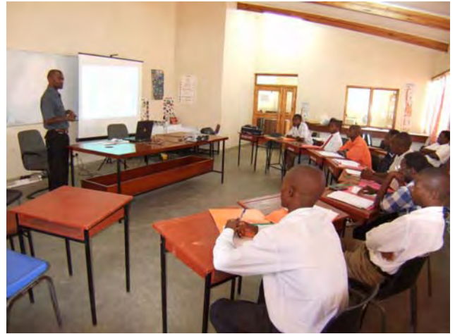
Photo 8: DOE staff is teaching participants at TCRET training course