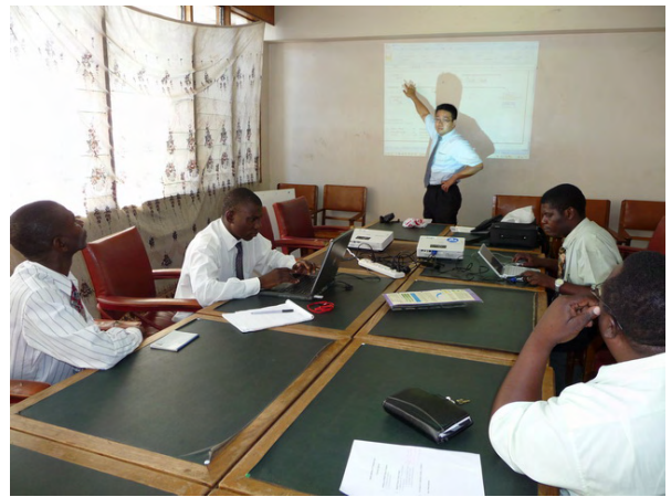
Photo 10 Lecture of distribution technology