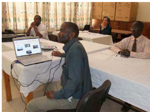
Photo 6 Practice of lecture at follow-up training for trainers