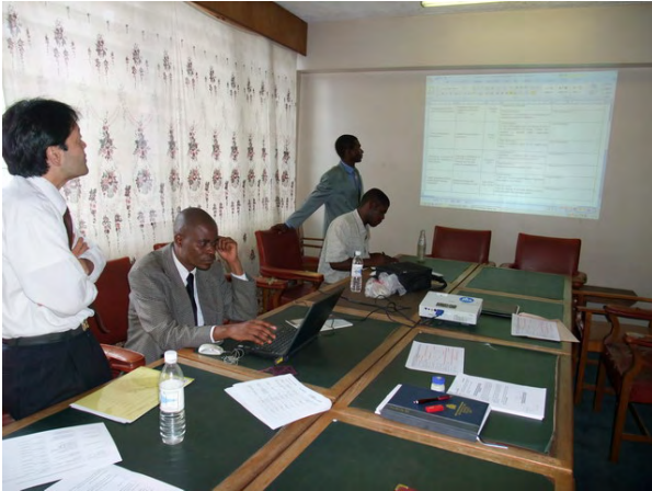
Photo 1 Preparing Challenge Sheet