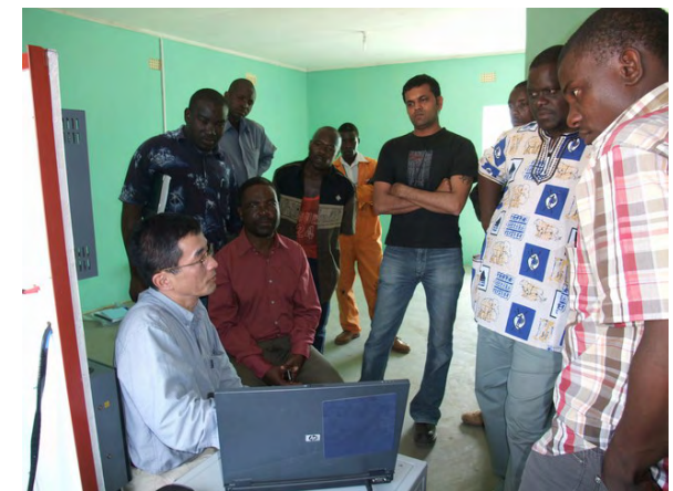
Photo 6 On site lecture to DOE and ESCOM participants.