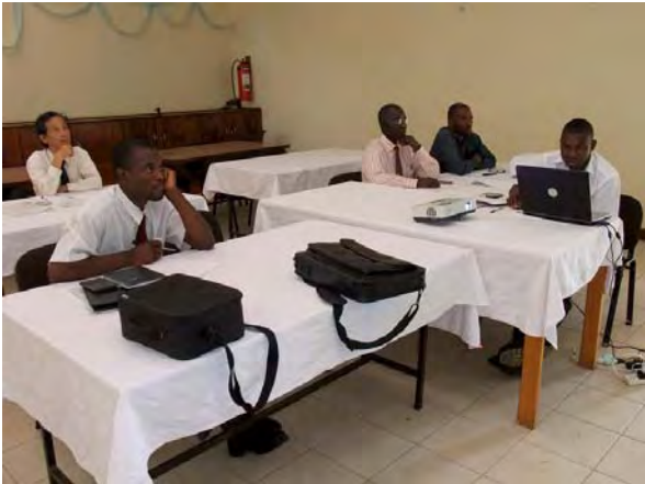
Photo 7 Practice of lecture at follow-up training for trainers