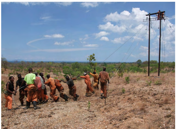
Photo 6 Construction at Makanjira