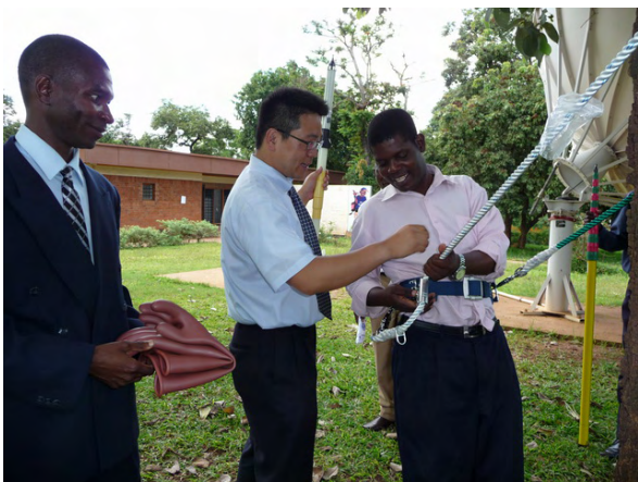
Photo 11 Practice of distribution equipment