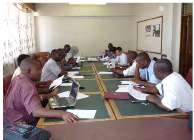
Photo 10 MAREP Phase 5 monthly management meeting.