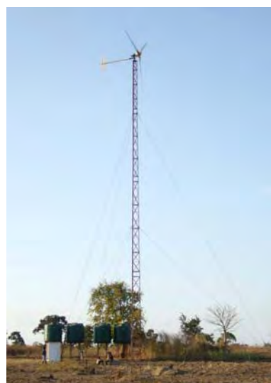
Photo 5: A wind irrigation system by UNDP (No functioning due to no wind)