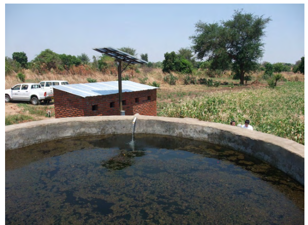
Photo 12 Site visit for PV irrigation system