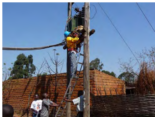
Photo 4 Final connection of data logger to the transformer