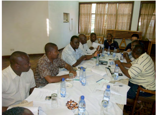
Photo 8 MAREP progress meeting