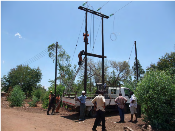
Photo 7 Construction at Makanjira