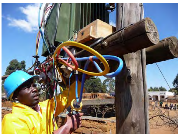
Photo 3 Checking connection of the transformer