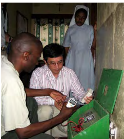
Photo 2: Technical transfer on installation and operation of a data logger