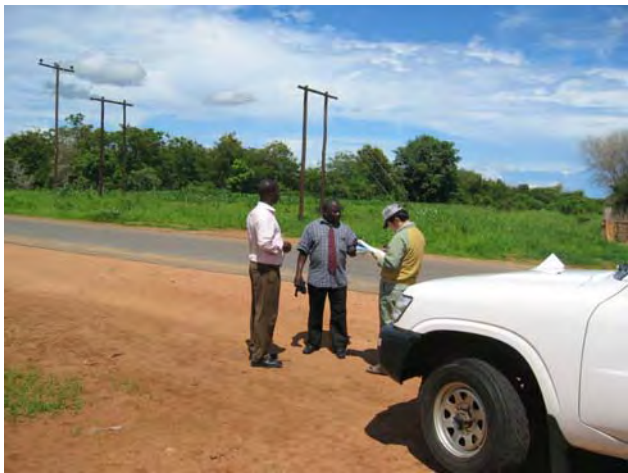
Photo 9: Distribution advisor is confirming inspection procedure of ESCOM