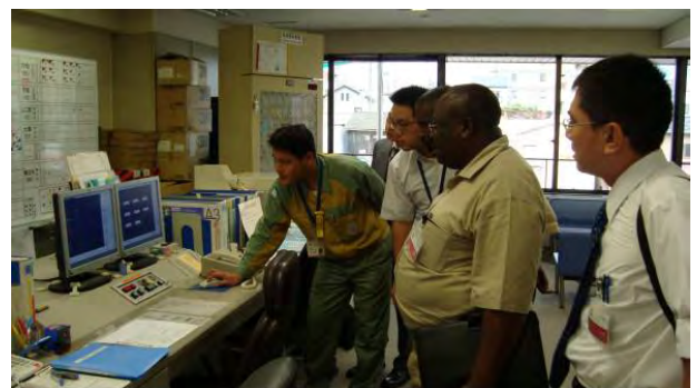
Photo 12 C/P training at Kita Customers Service Center of CEPCO.