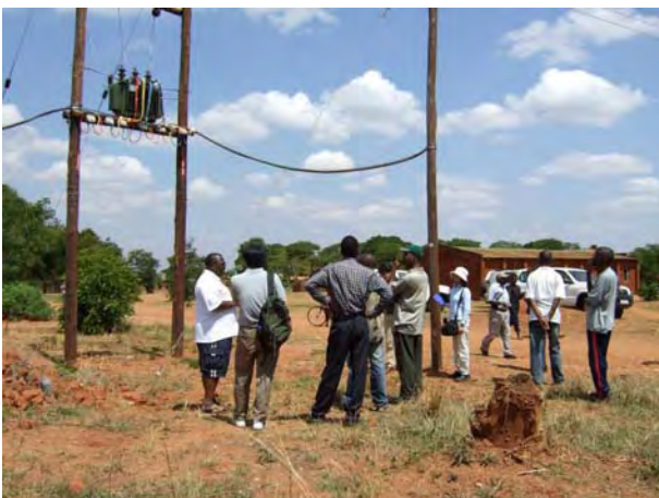
Photo 5: Site visit for Zambian officers (Dickson, Phase 4 site)