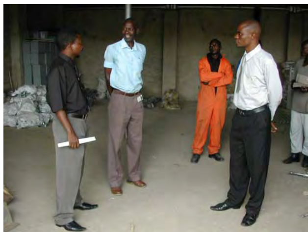
Photo 11: Inspecting ESCOM Warehouse for the storage of MAREP Phase 5 materials