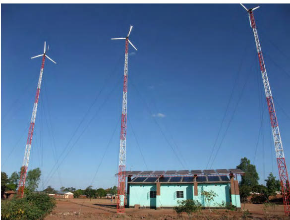
Photo 5 Solar village (Wind & PV) Wind towers are located in front of PV array that cause shade during daytime.