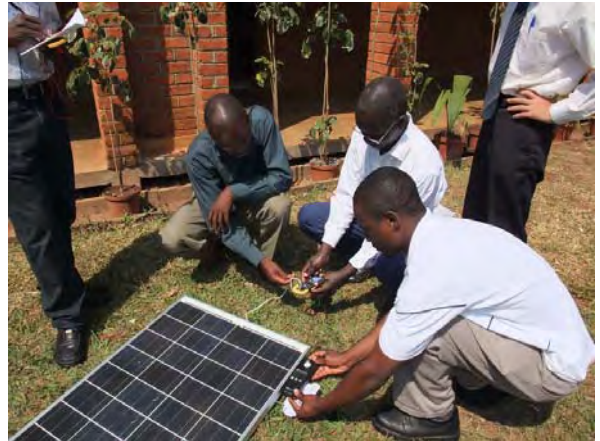
Photo 8 Hands-on practice at follow-up training for trainers