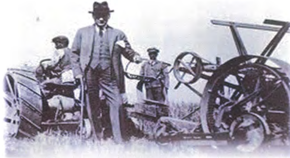
“Türkiye'nin gerçek sahibi ve efendisi, gerçek üretici olan köylüdür”.

The first Agricultural Credit Cooperatives in the modern sense was founded thanks to the support and contributions of Mustafa Kemal ATATÜRK , whom we are proud to have as the first member of cooperative number 683 in “ Silifke-Tekir Çiftliği ”.