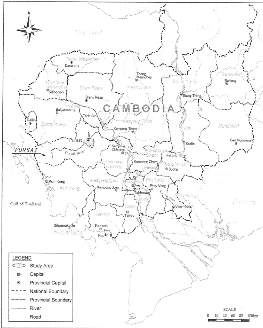
Annex1 Project Site Map