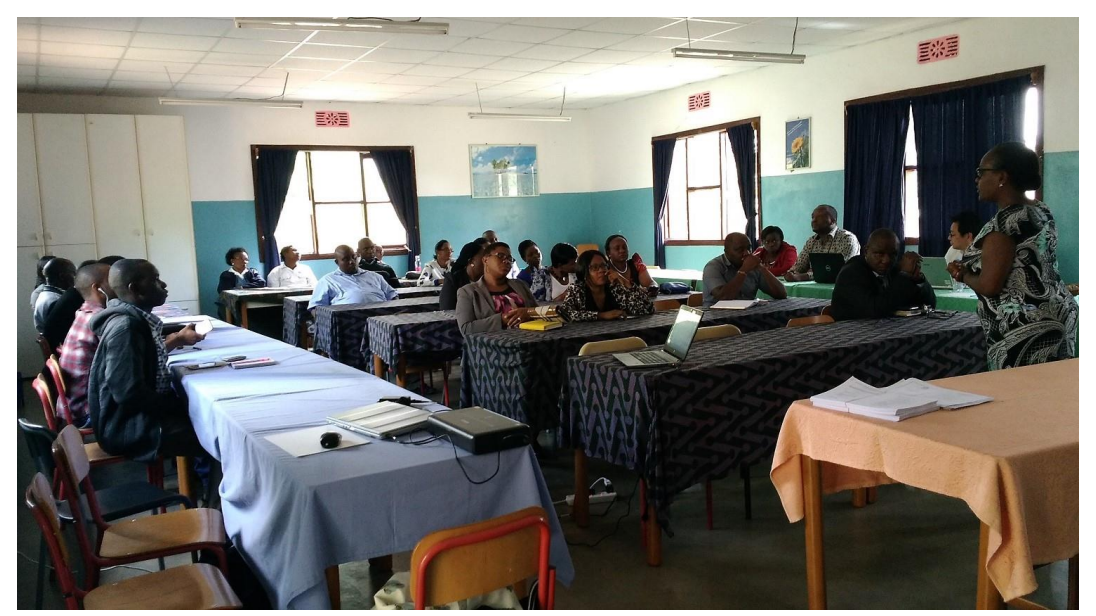
Figure 1: Public Sector Training

The list of participants from the public sector is attached as Annex III.