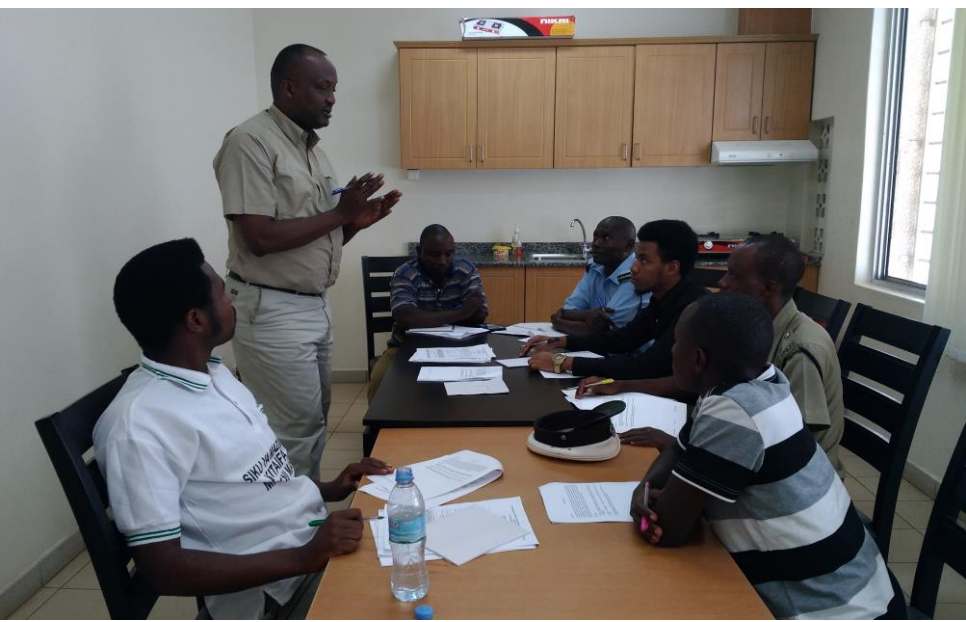
Breakout Session for Discussion of Case Studies