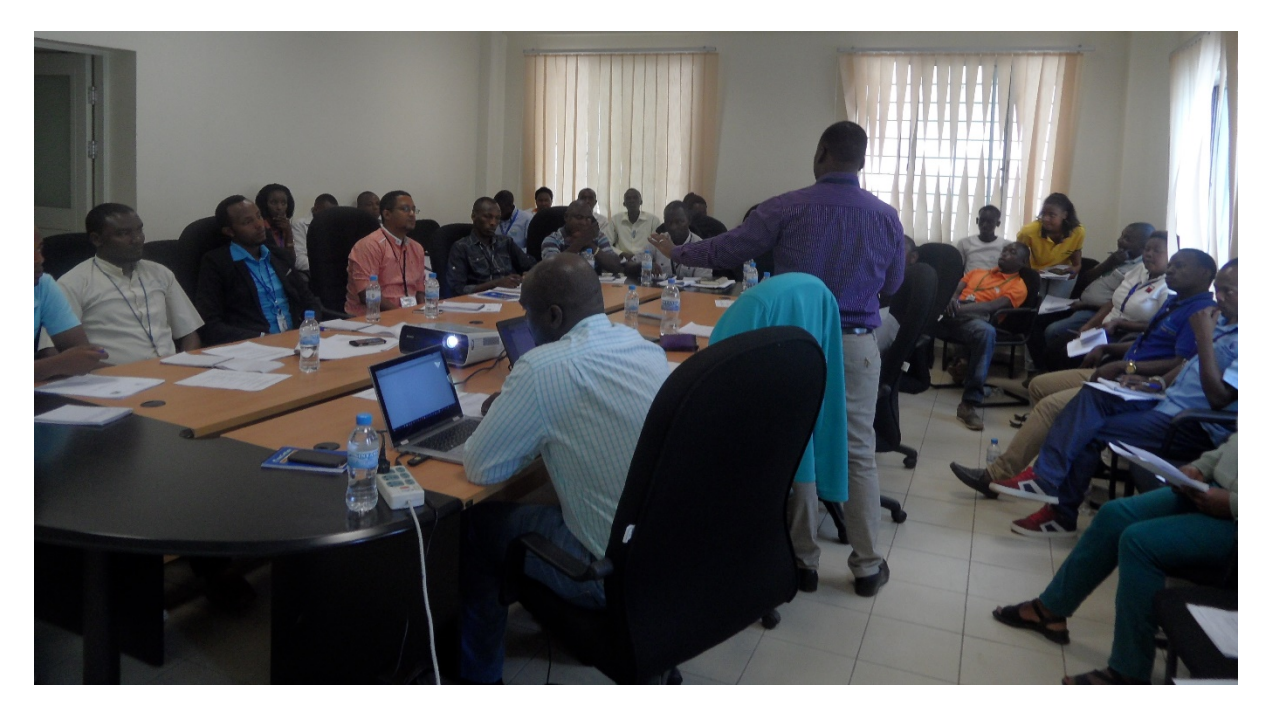
Above: Private sector training