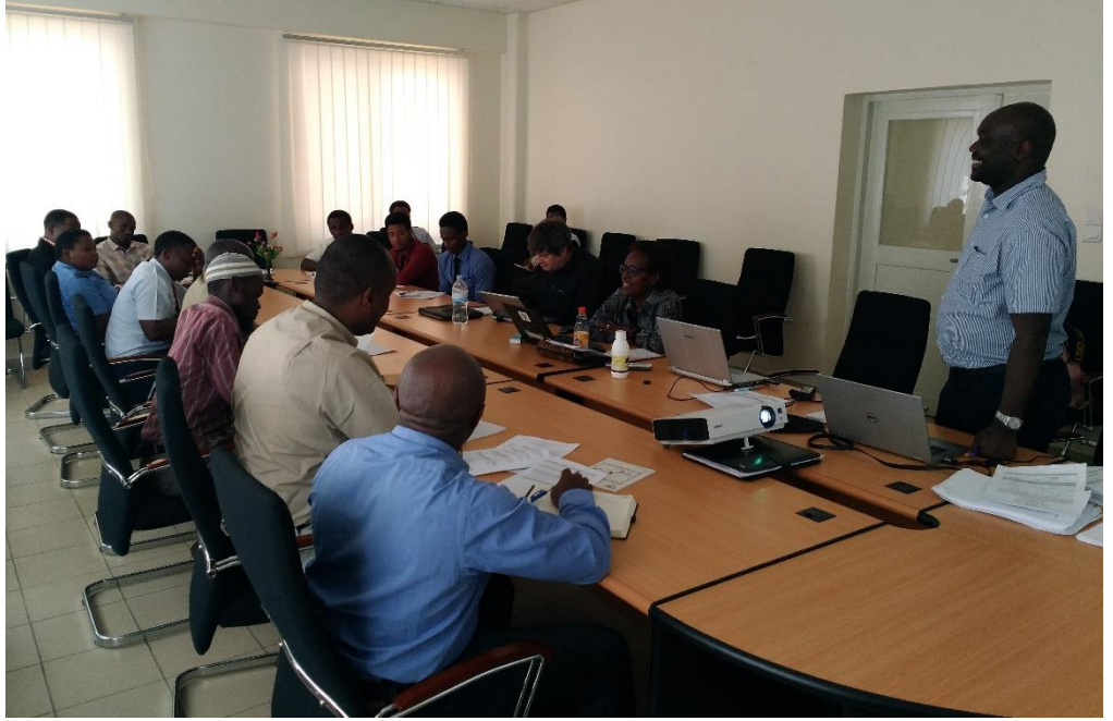
Training Session at Rusumo OSBP, Tanzania

11. The participants were urged to study the EAC OSBP Act and Regulations (which were distributed) and seek clarification on any issues of concern during the 2^{nd} day of the workshop.