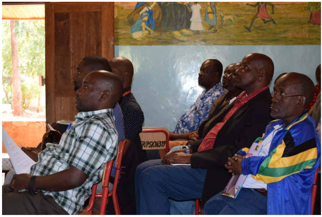
Participants listening attentively