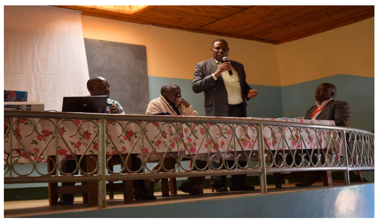
Guest of honour giving opening remarks