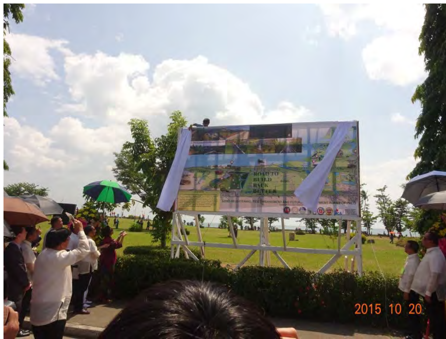
Unveiled by Governor of Leyte, Mayor of Palo and Regional Director of DPWH