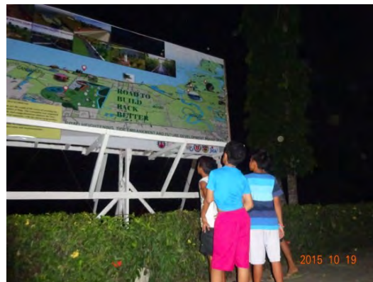
Children were also interested in the billboard.