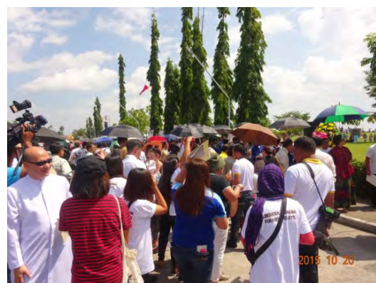
Many people came to see the plan