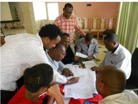
የቡድን ውይይት በስልጠና ወቅት