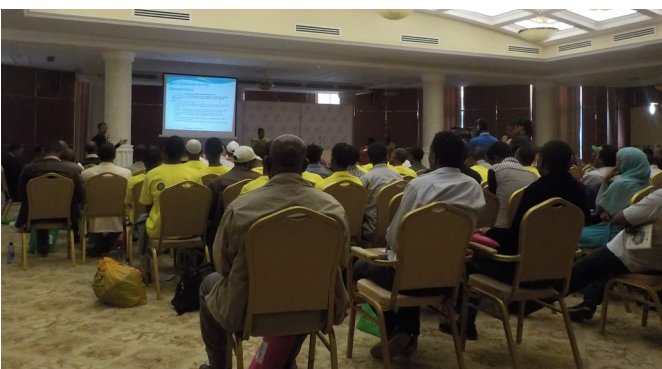
At conference hall in GET FAM Hotel, Addis Ababa, more than 130 people gathered for the seminar.