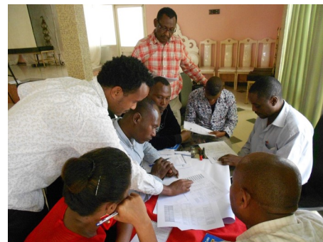
Group work at the training