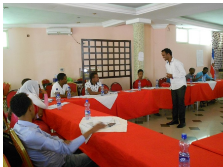
Interactive lecture at the training