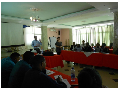
Opening note from WAS-RoPSS