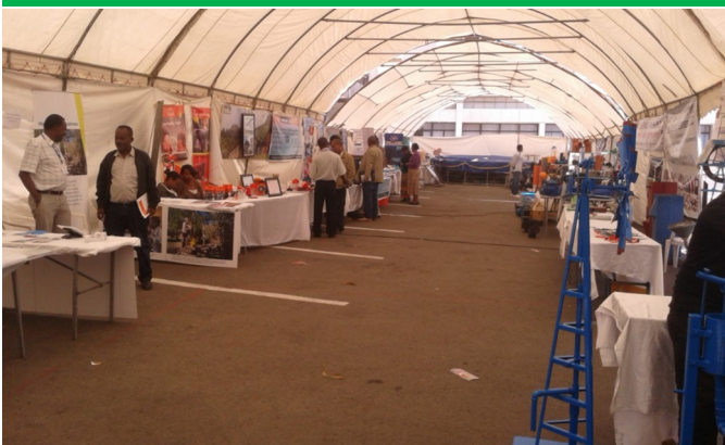
Exhibition stands by various actors