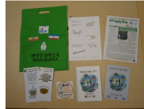
Various documents, booklets and novelty goods for rope pump dissemination and promotion are distributed to the participants.