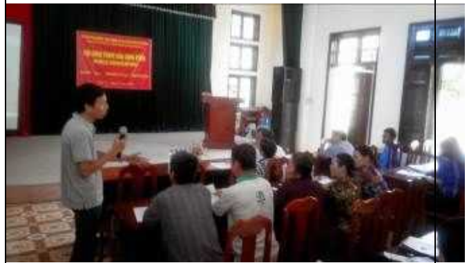
Phuc Le Commune - Thuy Nguyen District