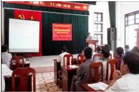
Phuc Le Commune - Thuy Nguyen District