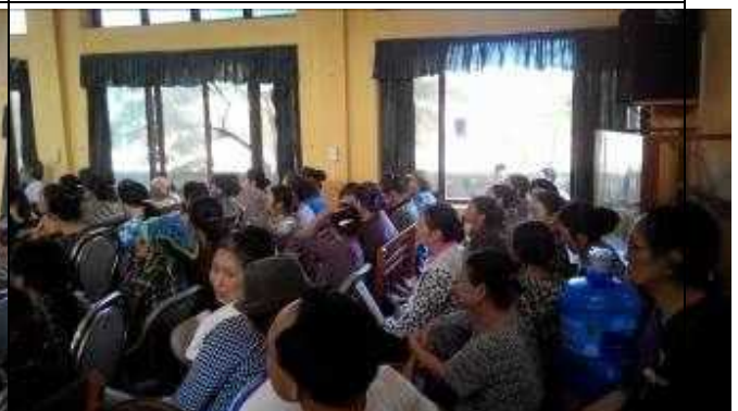
Pha Le Commune - Thuy Nguyen District