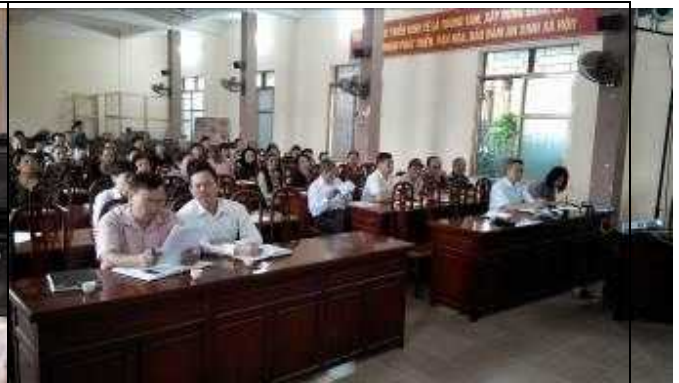
An Lu Commune - Thuy Nguyen District