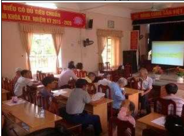
Hoa Binh Commune - Thuy Nguyen District