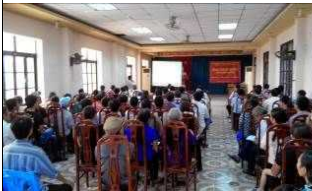
Ngu Lao Commune - Thuy Nguyen District