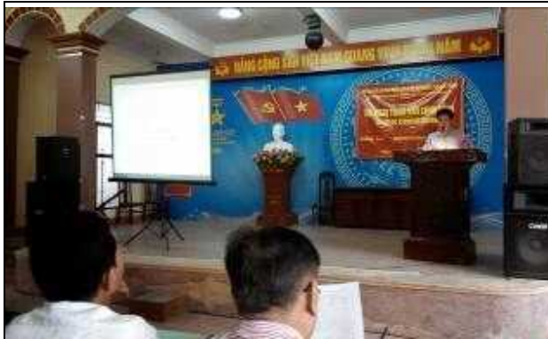
An Lu Commune - Thuy Nguyen District