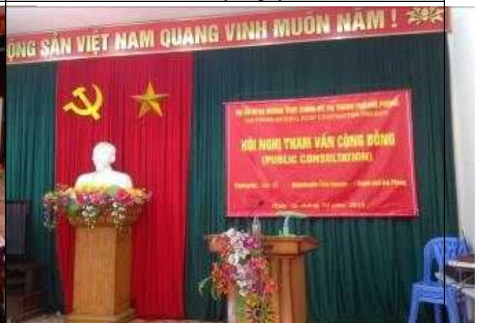
Lap Le Commune - Thuy Nguyen District