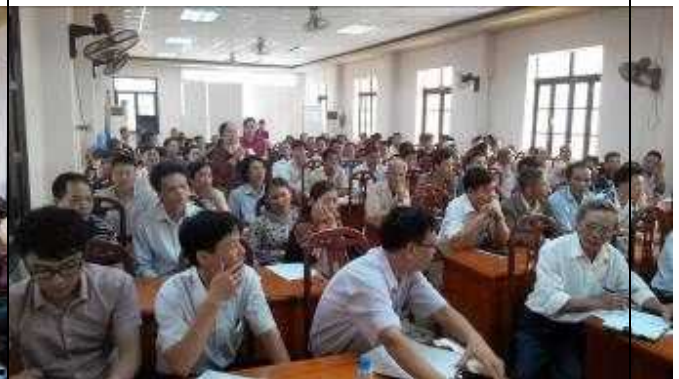
Ngu Lao Commune - Thuy Nguyen District