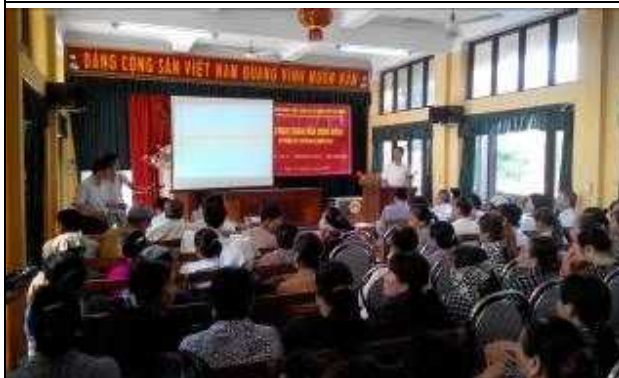
Pha Le Commune - Thuy Nguyen District