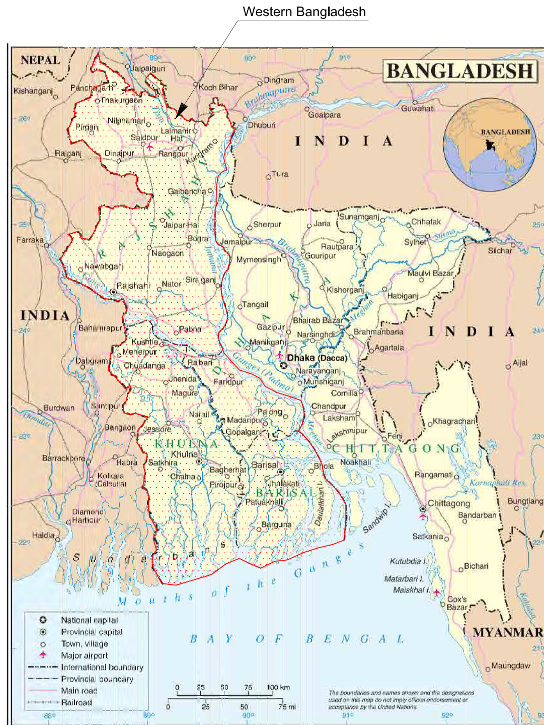
Location of Bangladesh Scale 1:2,000,000