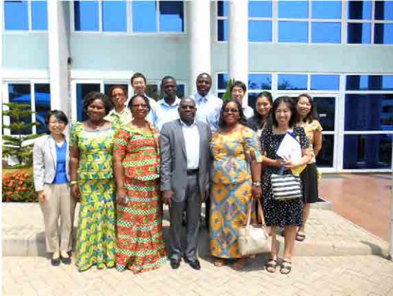
Joint Coordinating Committee members