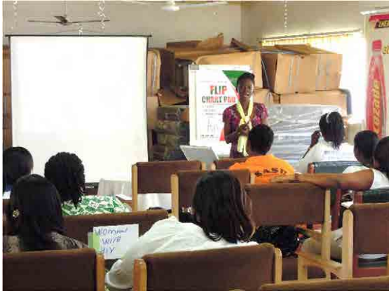
A lecture by a regional trainer on PMTCT