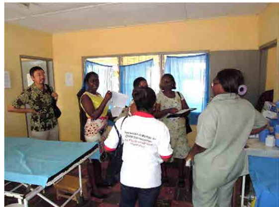
Learning PMTCT as an integral part of ANC at Sege Health Centre