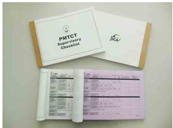
Final version of PMTCT Supervisory Checklist