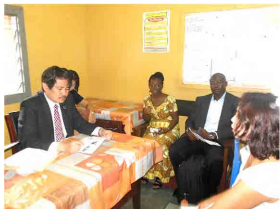
An MP of Liberal Democratic Party of Japan visiting Jamestown Maternity Home