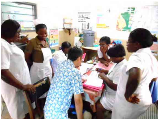
On-site coaching on PMTCT supportive supervision using the Supervisory Checklist