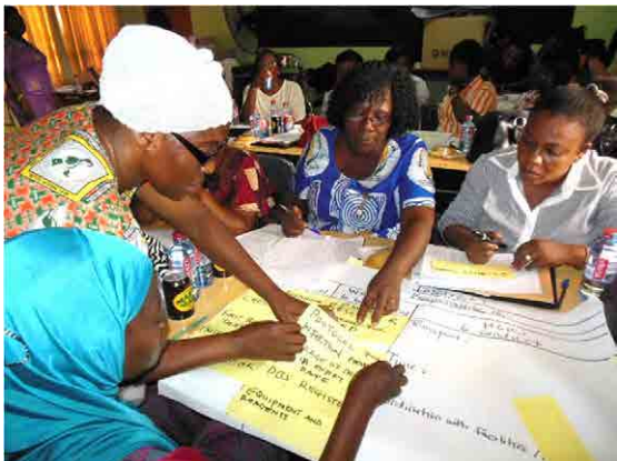
Group work for sustainability planning of supportive supervision