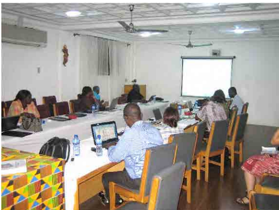
Workshop on the Revision of PMTCT Guidelines & Training Manuals