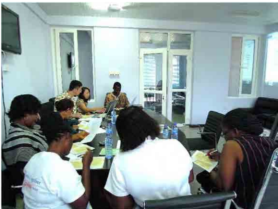
PMTCT Handbook Development Task Team meeting