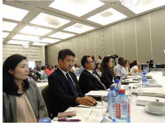
Project Outcomes Dissemination Meeting