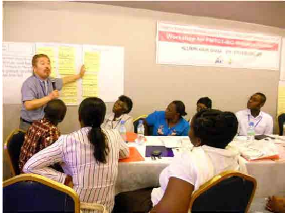
Workshop for PMTCT-IEC Message Options Creation