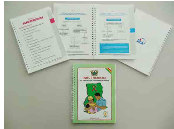
Final version of the PMTCT Handbook