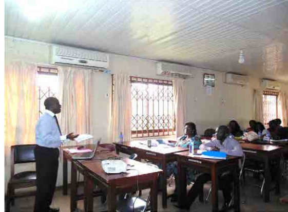
ART Orientation for Prescribers