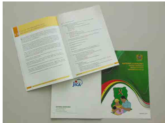
New National PMTCT Guidelines based on Option B+