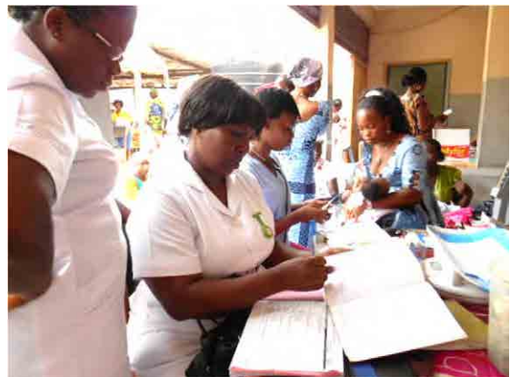
Practicing supportive supervision with the Checklist at Jamestown Maternity Home