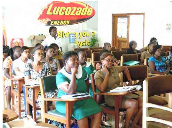
Participants learning at PMTCT Training