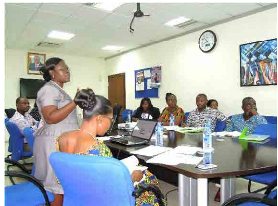
End-line survey validation workshop