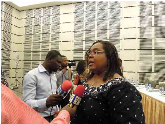
Deputy Director General of GHS responding to press interviews at the Dissemination Meeting