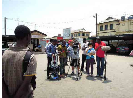
"Mama's Determination" video drama shooting