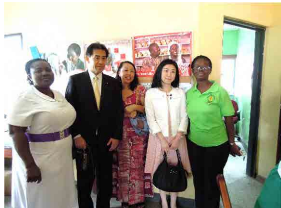
Members of the Japan-AU Parliamentary Friendship League visiting Jamestown Maternity Home