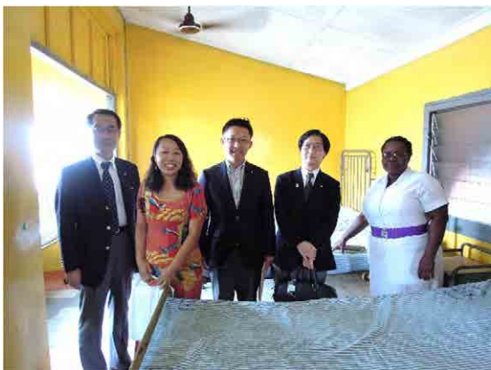
ODA Research Mission of Japan's House of Councillors visiting Jamestown Maternity Home