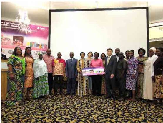
Official handing-over of the final PMTCT-IEC materials to GHS from the Japanese Ambassador at the Dissemination Meeting