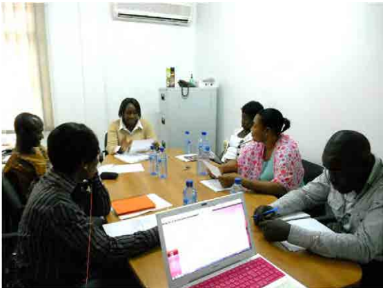
Meeting on the baseline survey