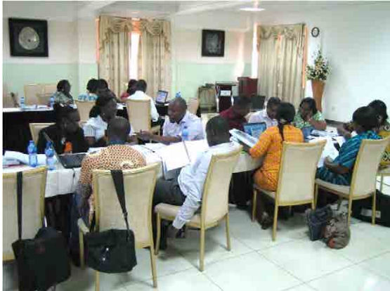
Group work for the revision of presentations to be used for step-down training