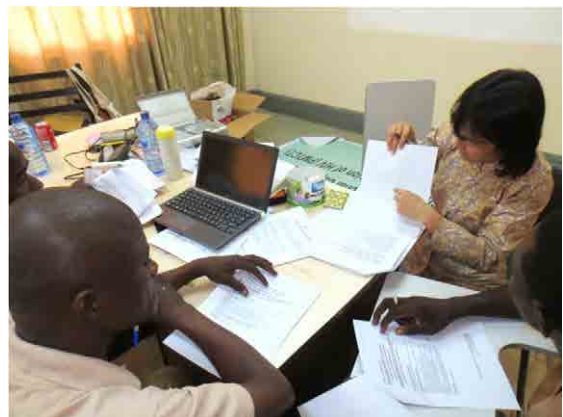
Detailed orientation on the field testing to surveyors