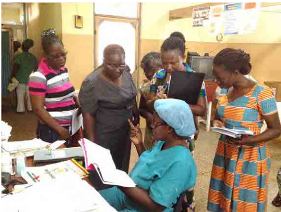
Learning PMTCT service at maternity ward of Tema Polyclinic