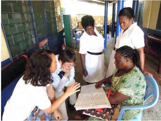
On-site coaching on PMTCT data management