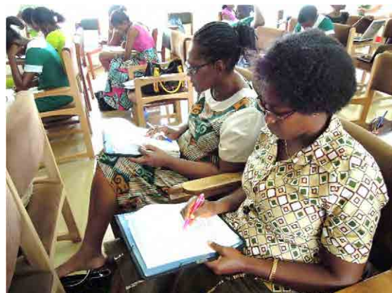
Participants taking the post-test of the training