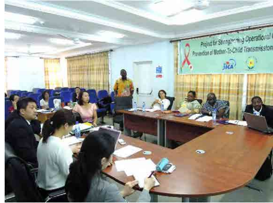
The 5 th Joint Coordinating Committee meeting