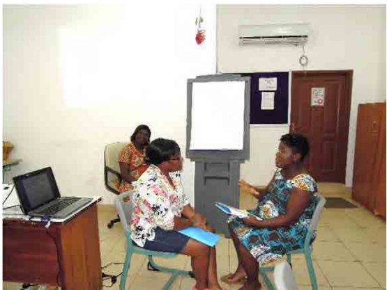
Participants practicing counselling on Early Infant Diagnosis (EID)