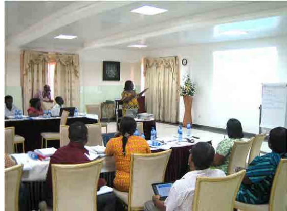
Participants practicing effective teaching