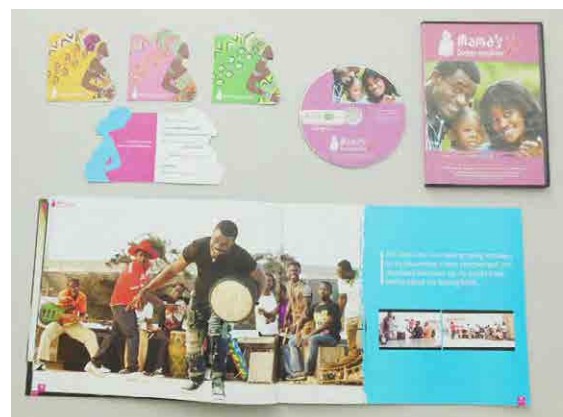
Final version of PMTCT-IEC materials