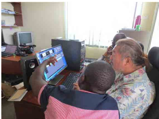
Editing of "Mama's Determination" video drama