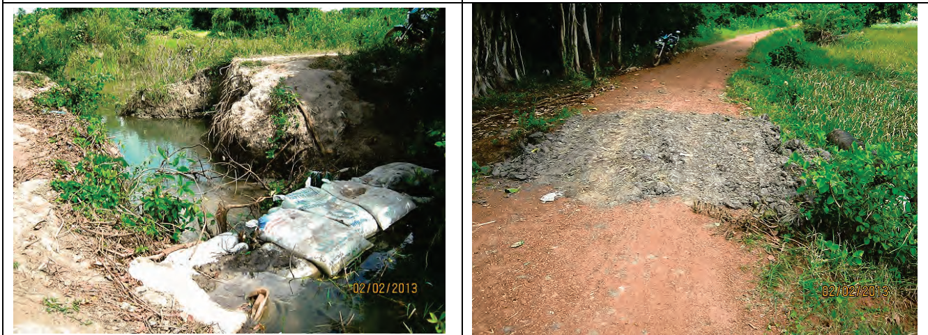
Katunkandal Tank Breached (Nedunkandal upper stream)