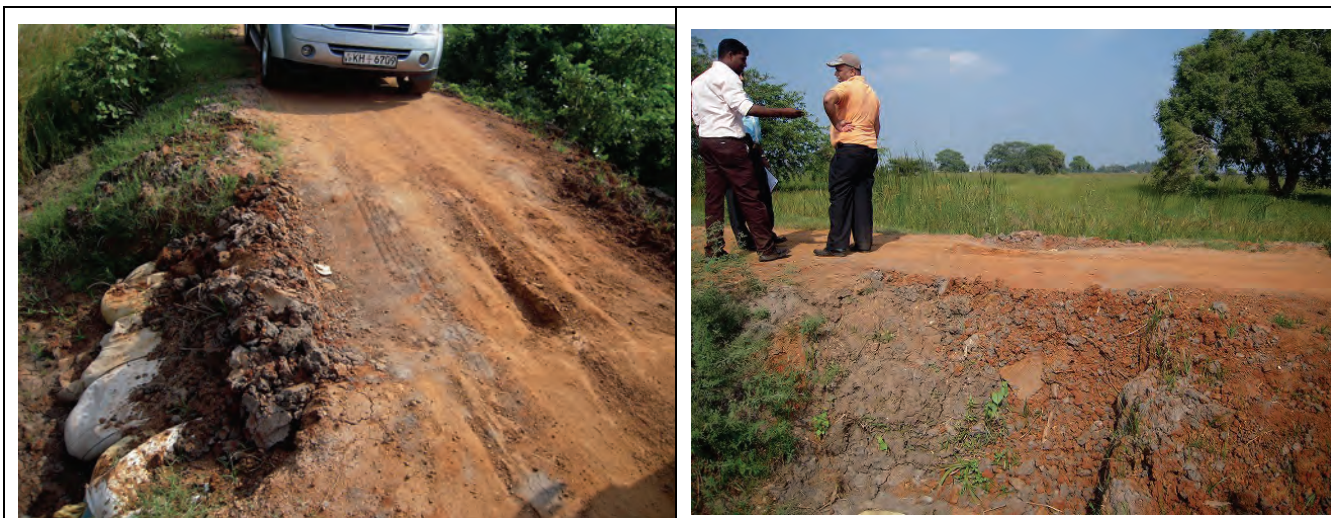
Chalampan Tank Bund Flood Release Cut