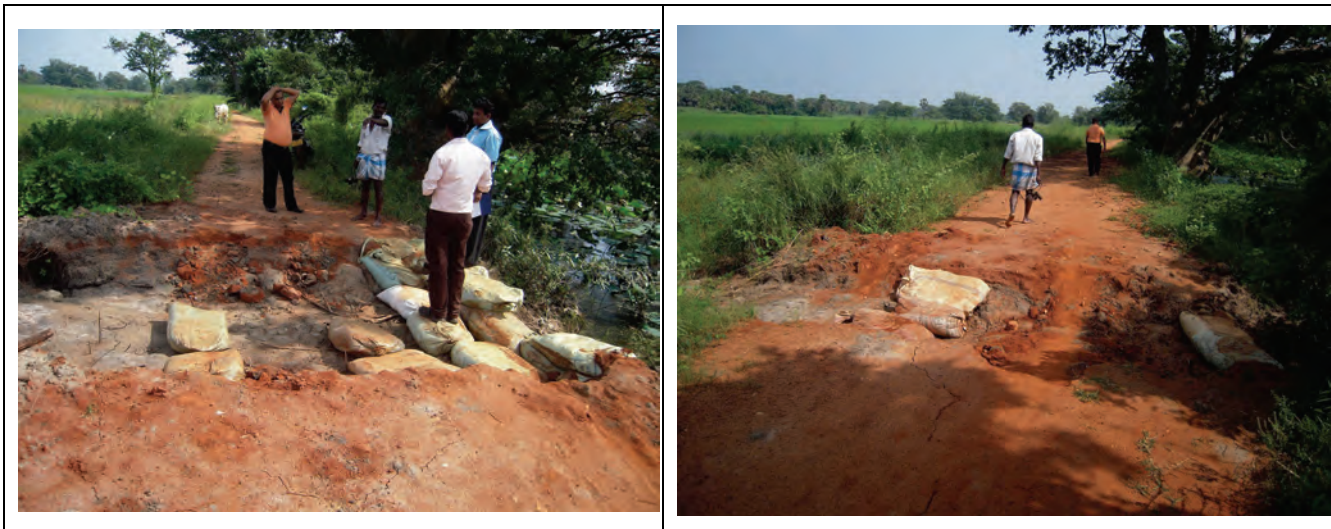
Nedunkandal Tank Cut to Release Flood (1)