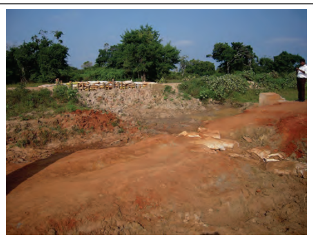
Pali Aru Tank Breached and Road Erosion (2)