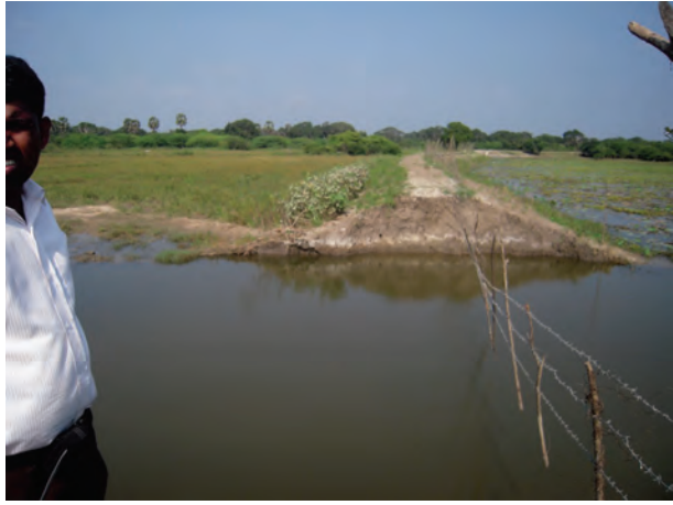
Theththavaady Tank Breached (1)