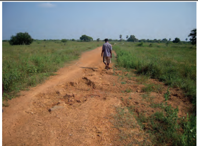
Theththavaady Road Flood Damage (4)