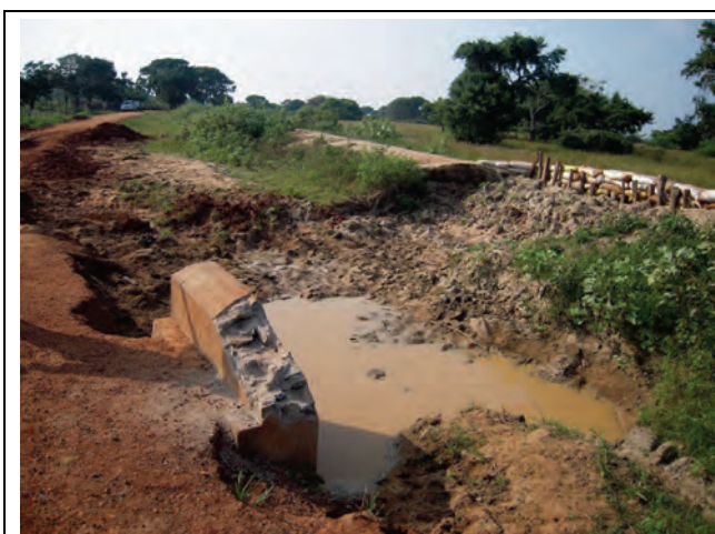
Pali Aru Tank Breached and Road Erosion