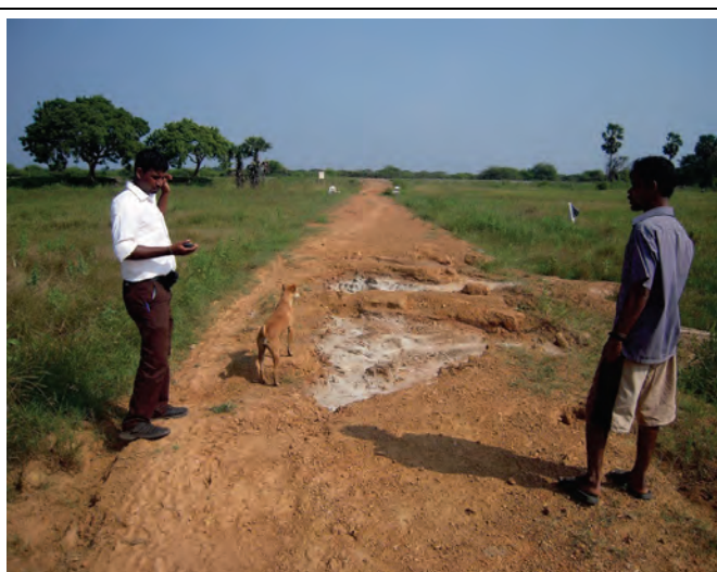
Theththavaady Road Flood Damage (6)