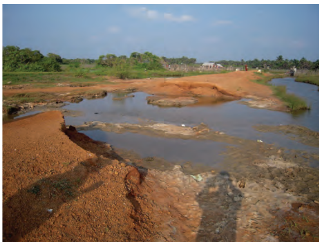
Puthukadu Erosion (2)