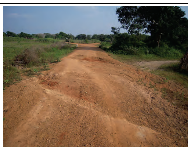
Pali Aru Road Washed (2)