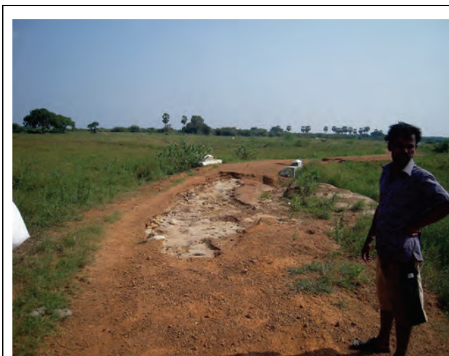
Theththavaady Road Flood Damage (5)