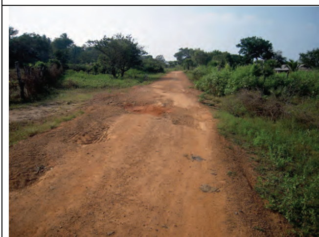
Pali Aru Road Washed (1)