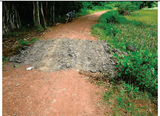
Katunkandal Tank Breached (Nedunkandal upper stream)