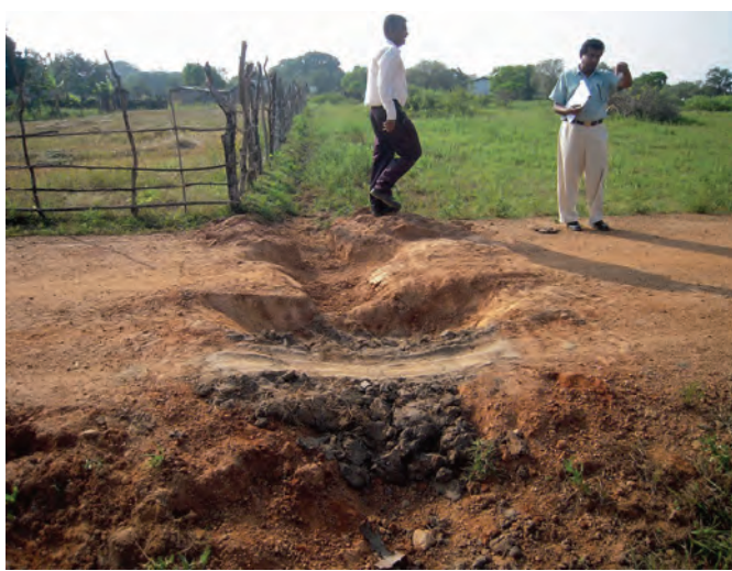
Pali Aru Road Washed (3)