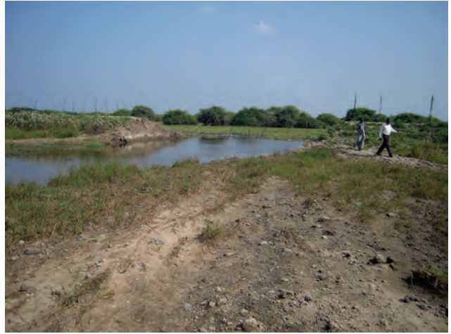
Theththavaady Tank Breached (2)