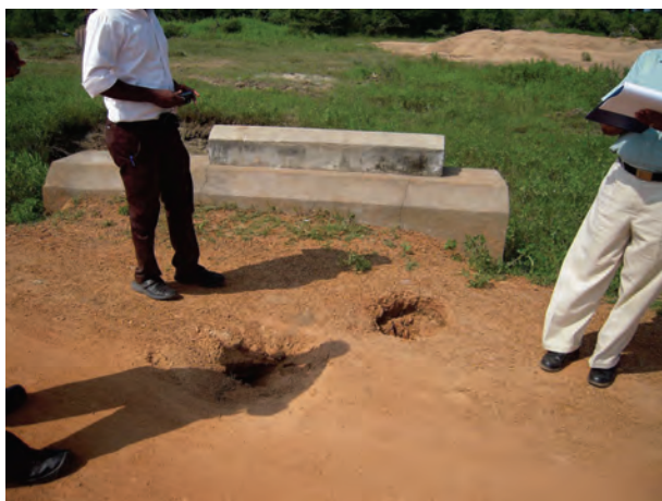
Theththavaady Road Flood Damage (3)