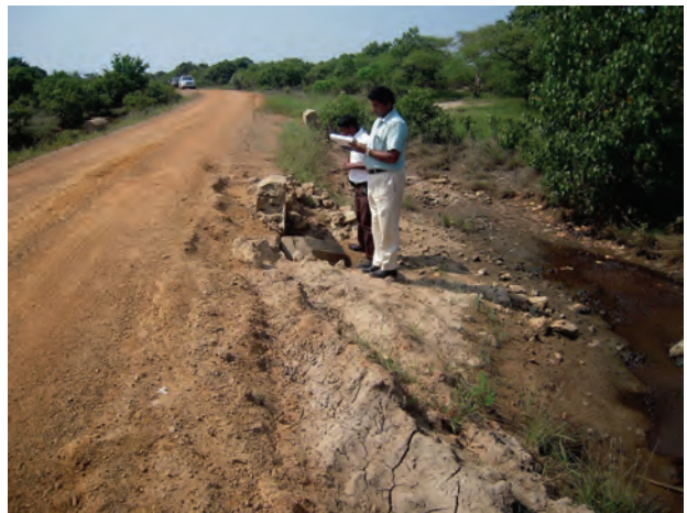
Theththavaady Road Flood Damage (2)