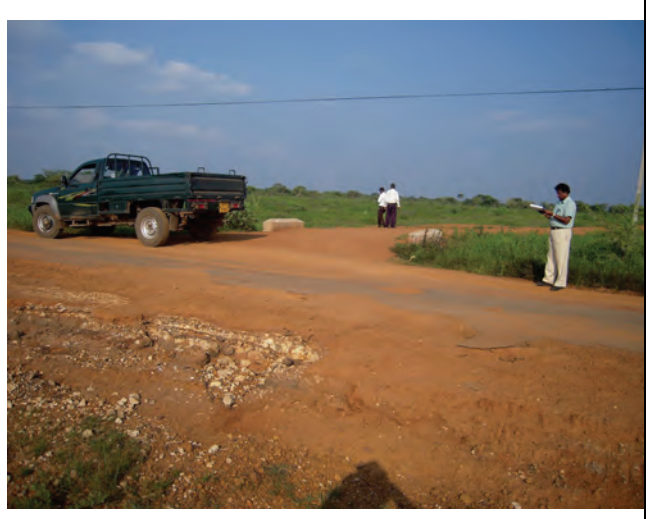
Pali Aru Road Washed (4)