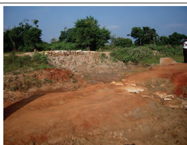
Pali Aru Tank Breached and Road Erosion (2)