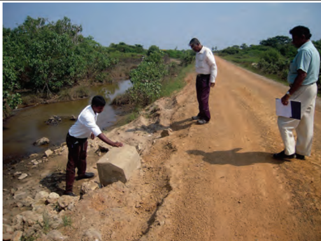
Theththavaady Road Flood Damage (1)