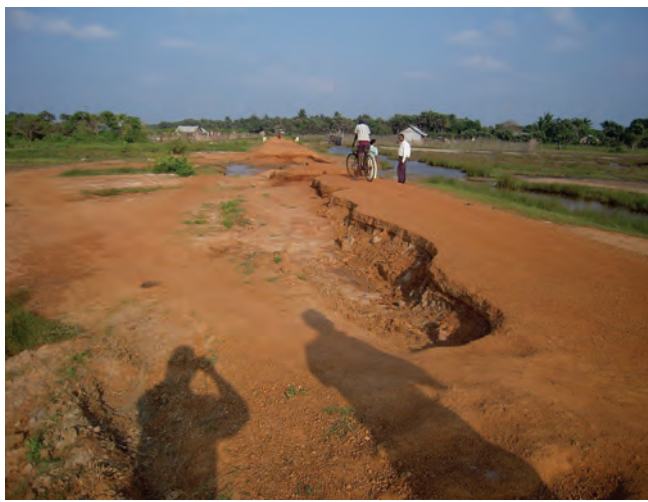
Puthukadu Erosion (2)