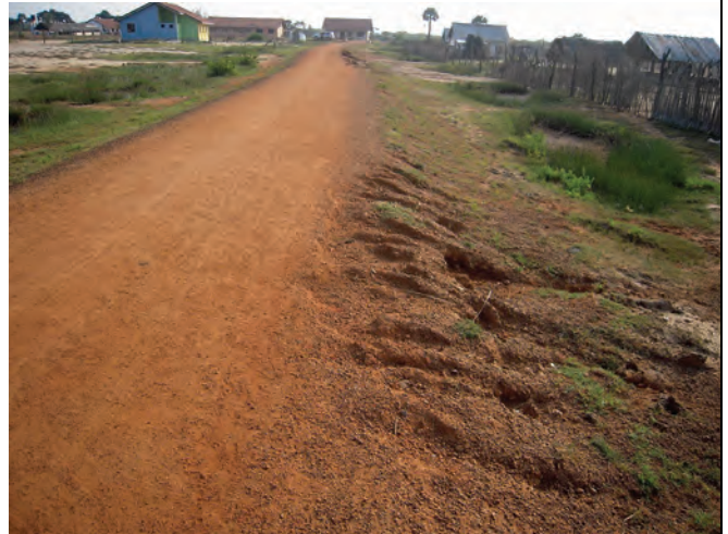
Thevanpidy Road (Puthukadu Road Branched off from this road)