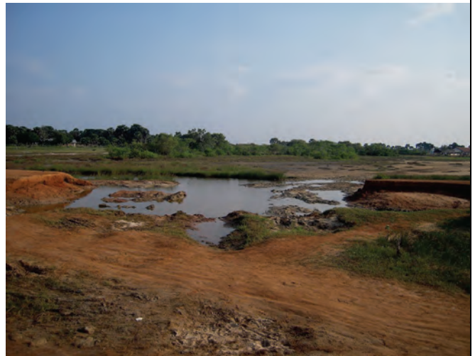
Puthukadu Erosion (2)