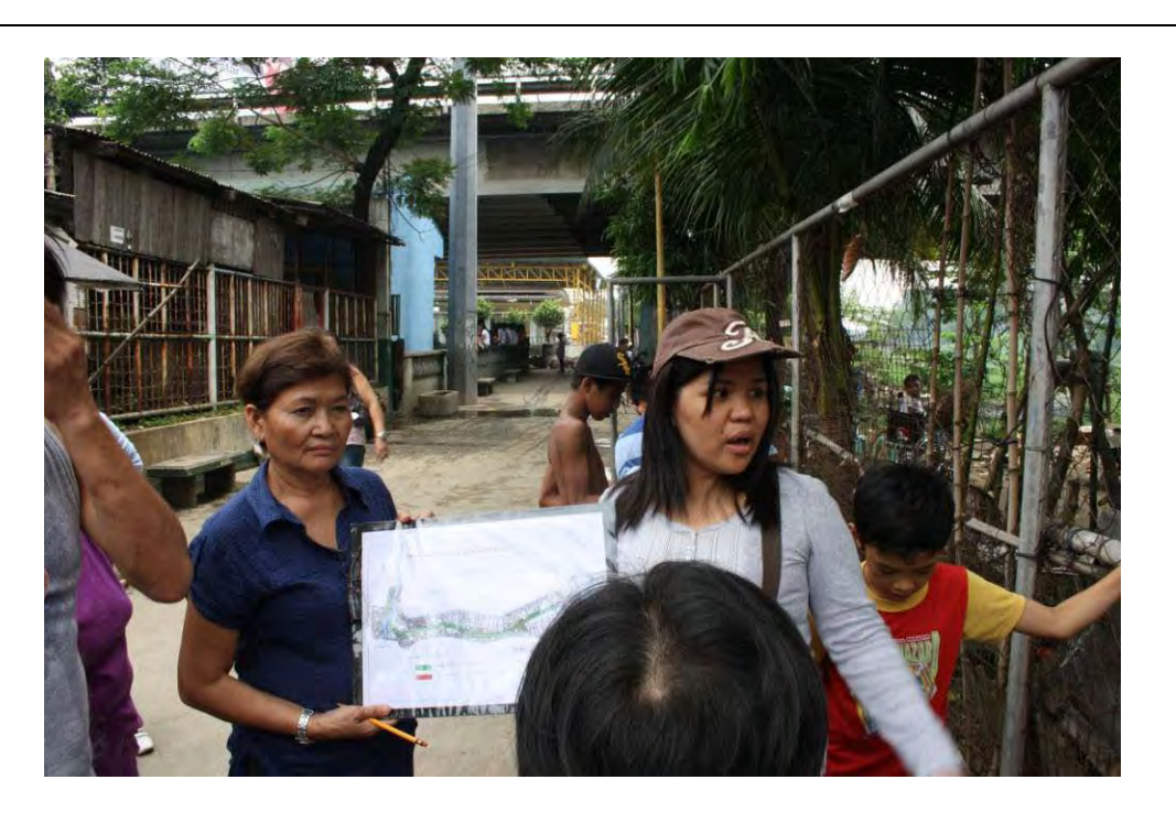
Focal Dialogue/Discussion at Upstream of Rosario Bridge