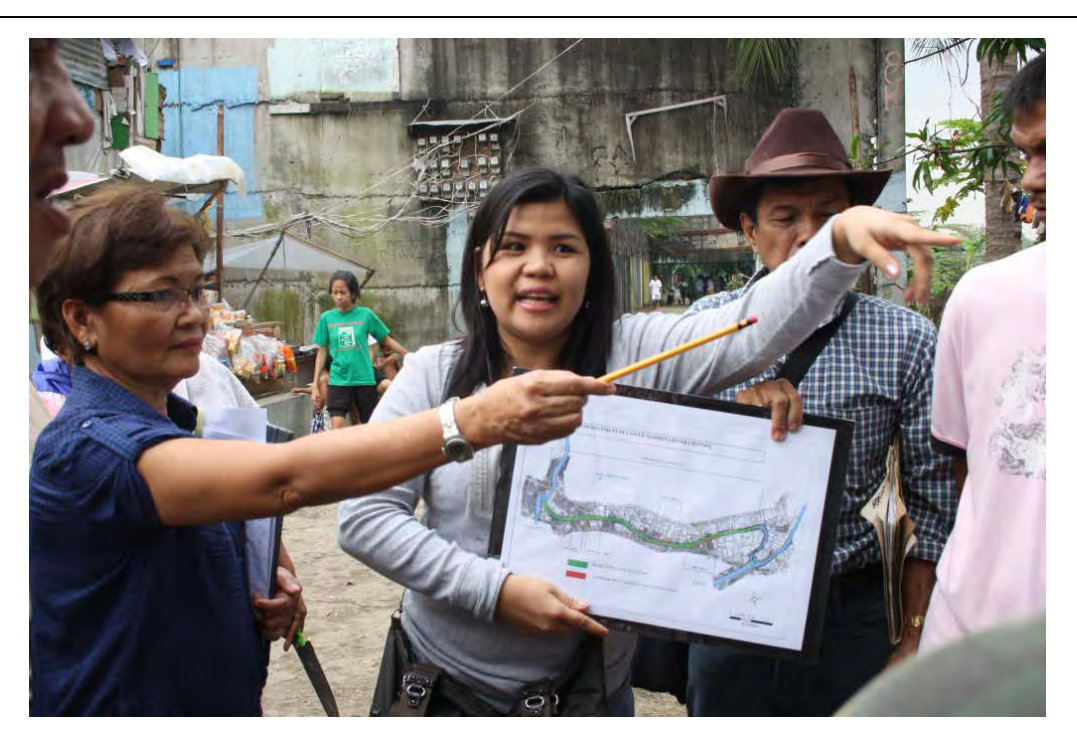
Focal Dialogue/Discussion at Downstream of Rosario Bridge