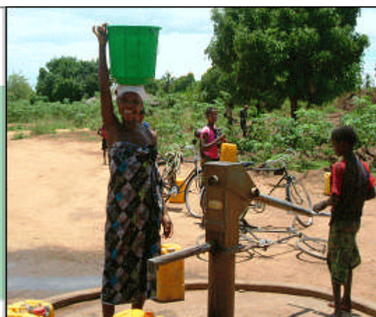
A woman using a deep well