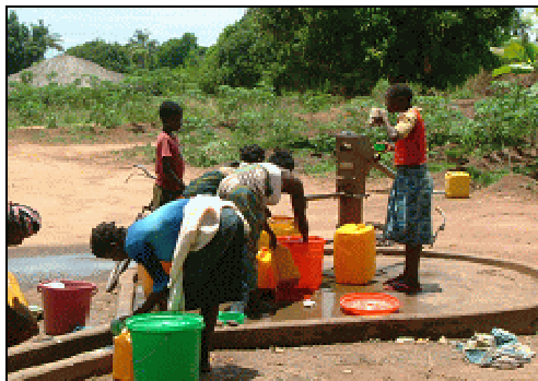
Beneficiaries using deep wells constructed by the project

According to the beneficiary survey 6 that was conducted during the ex-post evaluation study, it was found that 94 households out of 100 were using deep wells constructed by the project and that six households were not using them because of the long distance from their houses to the deep wells. It was also found that of the 94 households that were using deep wells, 88 (94%) were satisfied with the water volume, in comparison to 74 satisfied households (79%) before the project. 92 households (98%) were satisfied with the water quality, in comparison to 29 households (31%) before the project. These indicate that the project has made some great contributions to the improvement of the water volume and the water quality, respectively.