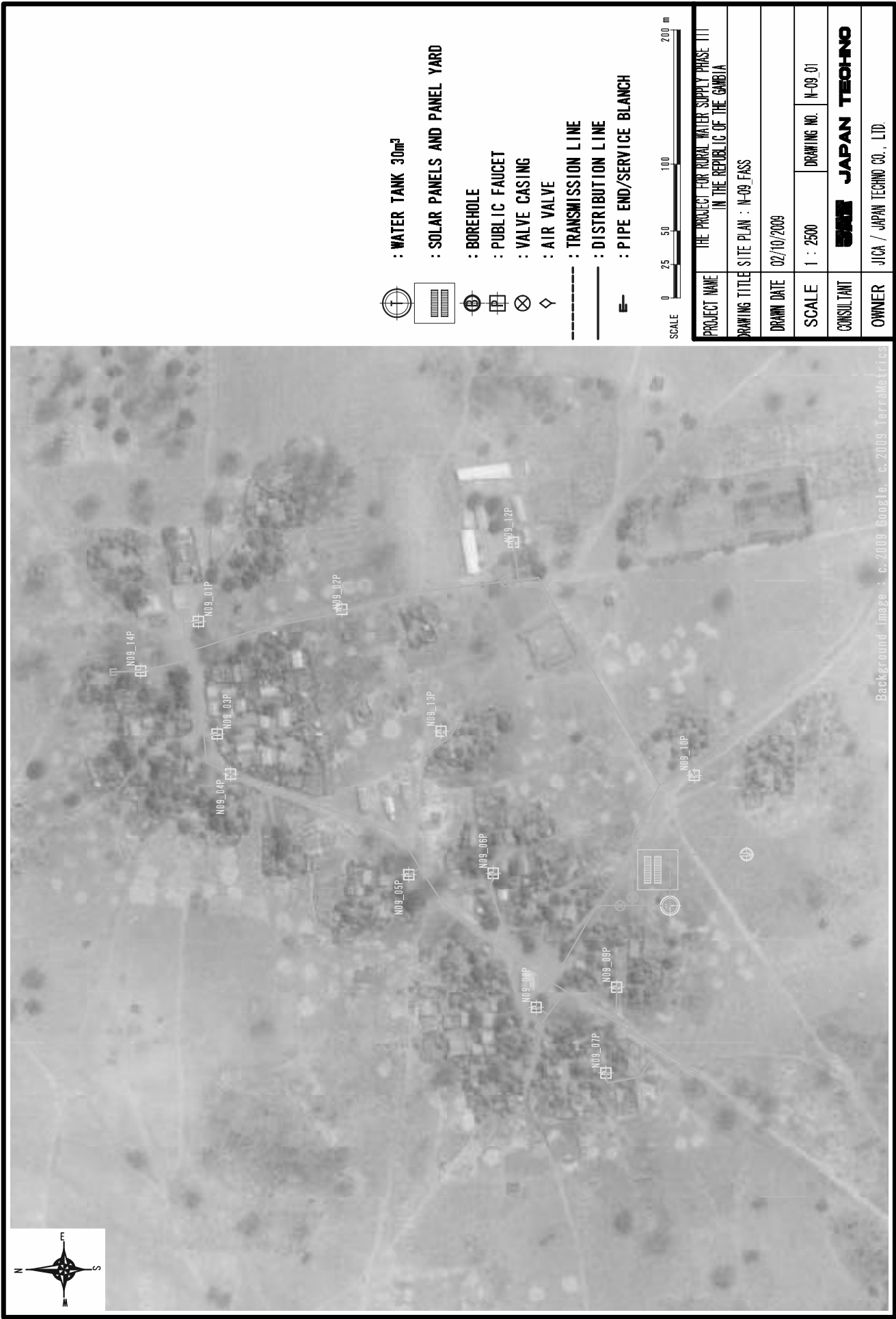
図3-15 給水施設配置図 (N-09)