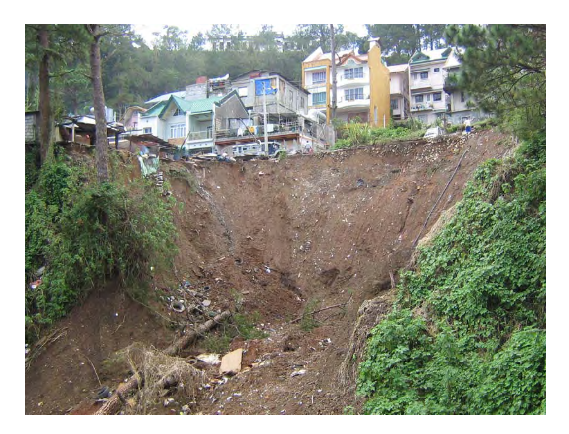
Photo-23 Landslide by Pepeng in United Residence Dominican Hill, Bgy. Upper Q. M. Baguio City (CAR Region)