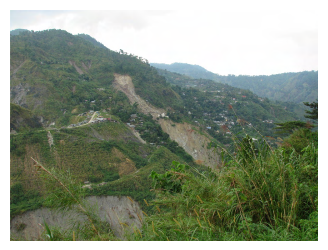
Photo-18 Landslide by Pepeng in Bgy. Loacan Itogon, Benguet (CAR Region)