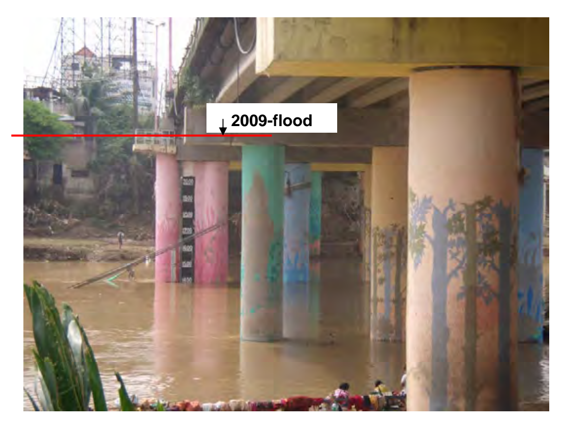
Photo-8 Marikina Bridge (Sto. Niño Water Level Station, Marikina River)