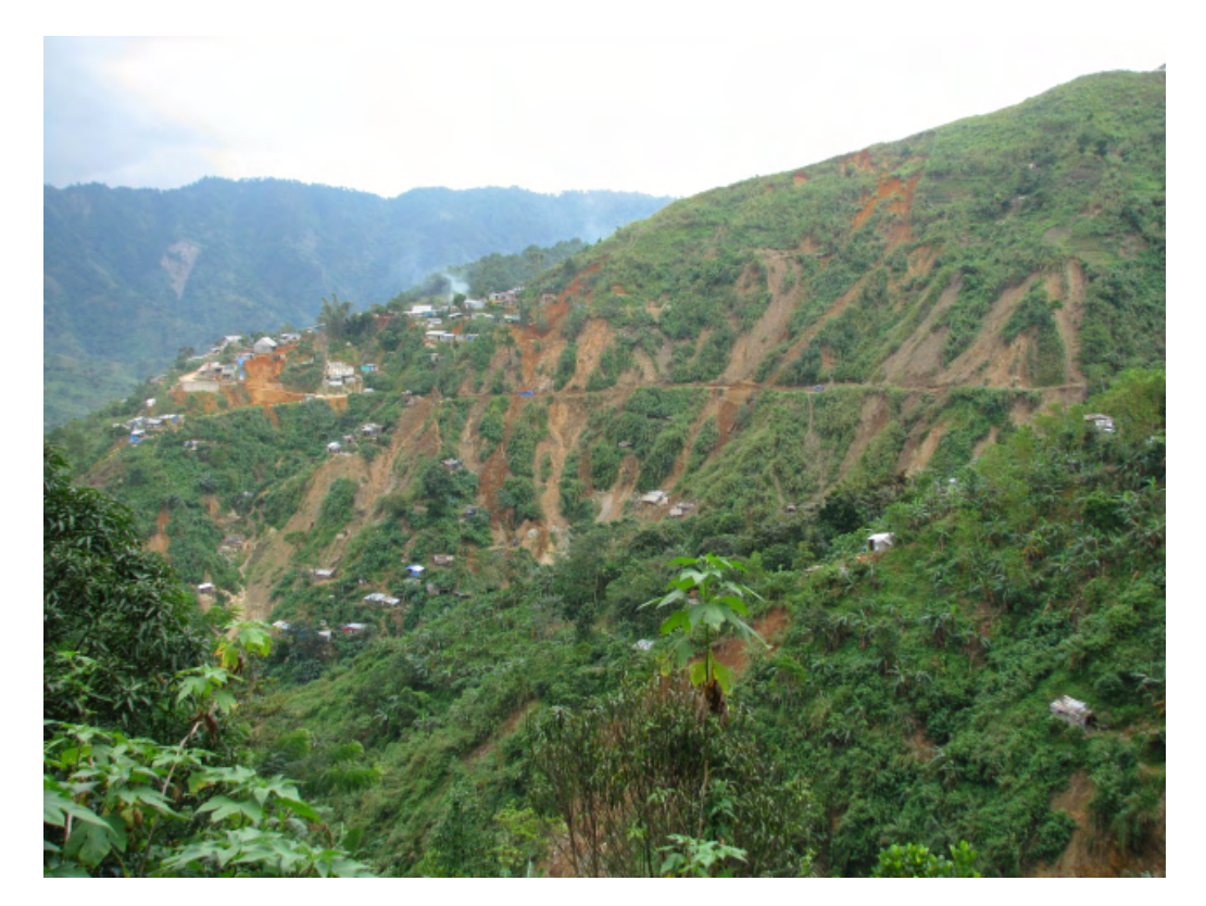
Photo-20 Translation slide by Pepeng in Bgy. Ucab, Itogon, Benguet (CAR Region)