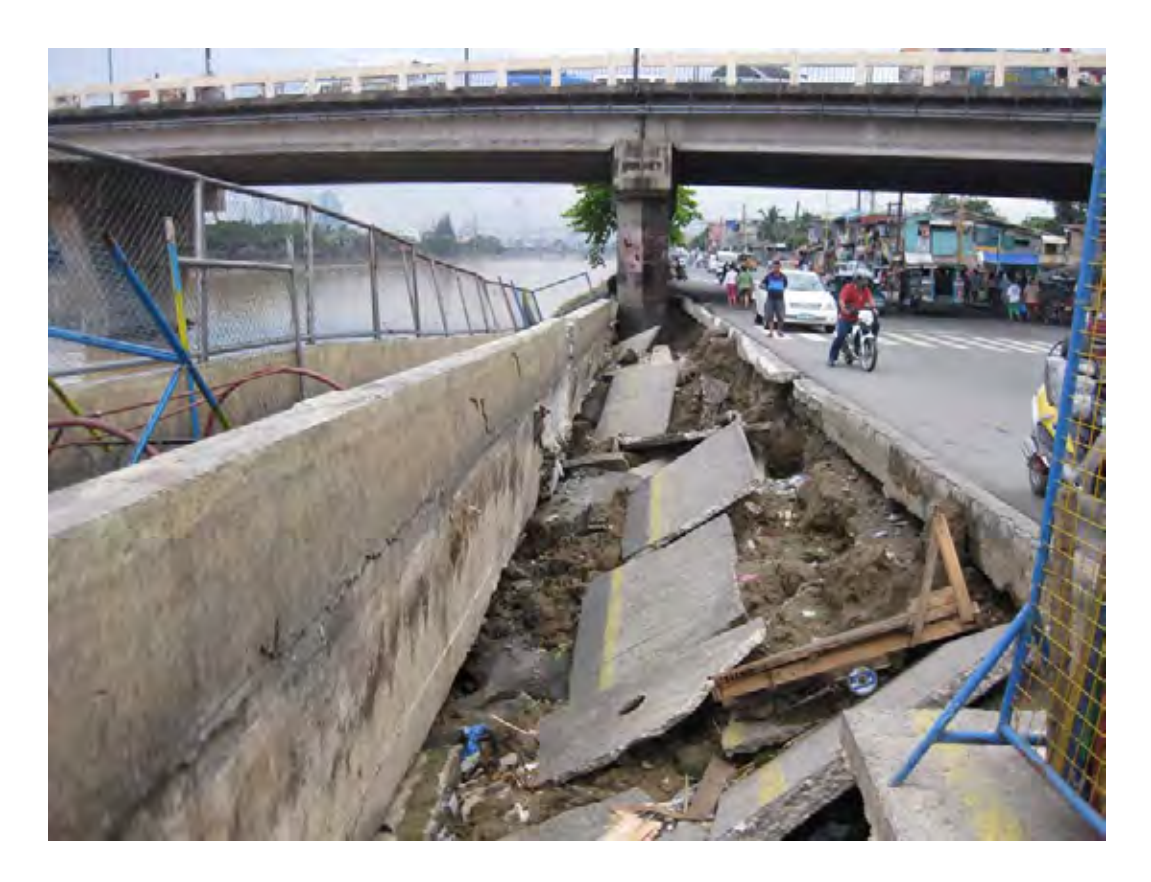
Photo-6 Damaged Structure during Ondoy due to Clogging of Road Drain Pipes at Left-side of Mangahan Floodway