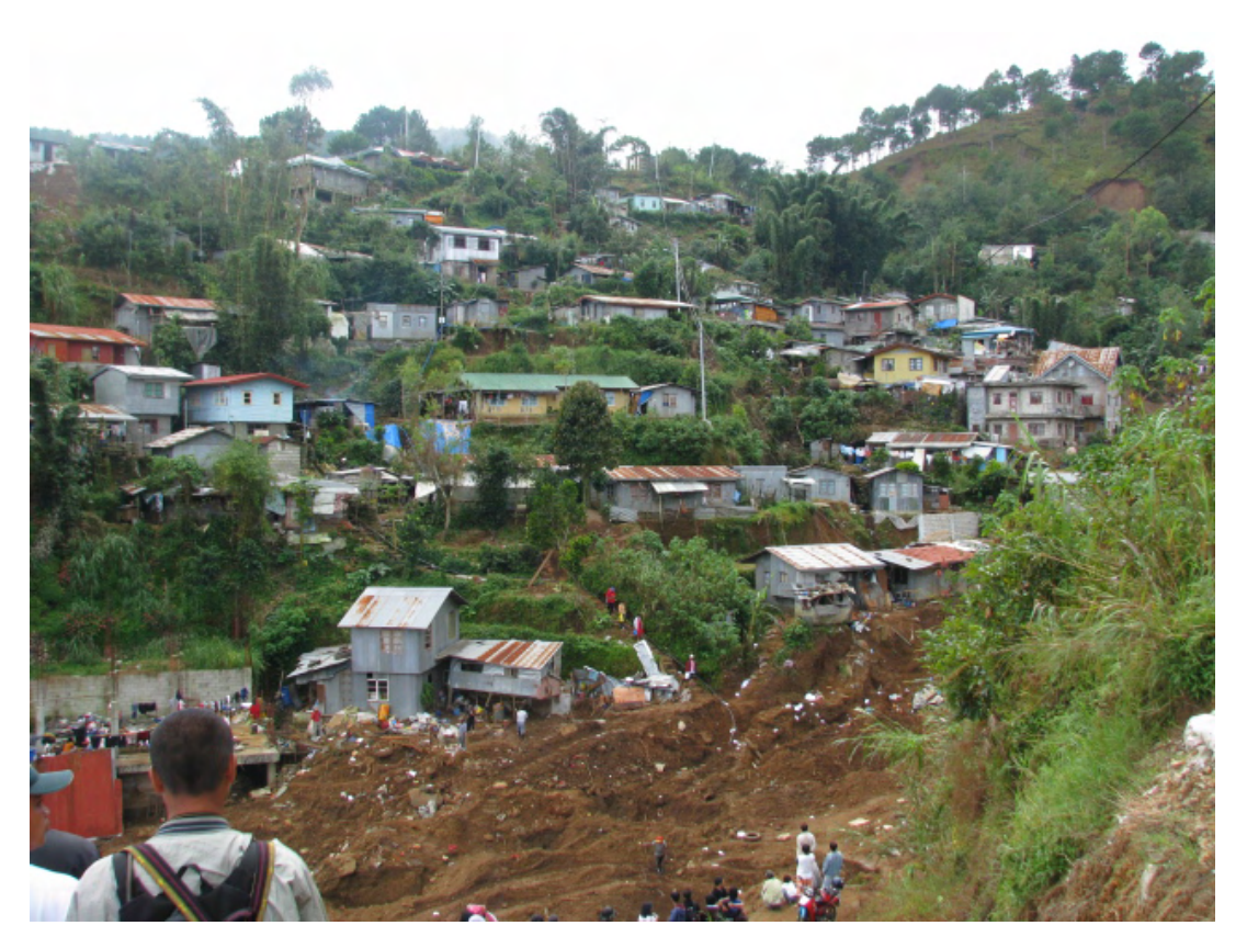
Photo-25 Landslide by Pepeng Sitio Little Kibungan La Trinidad, Benguet (CAR Region)