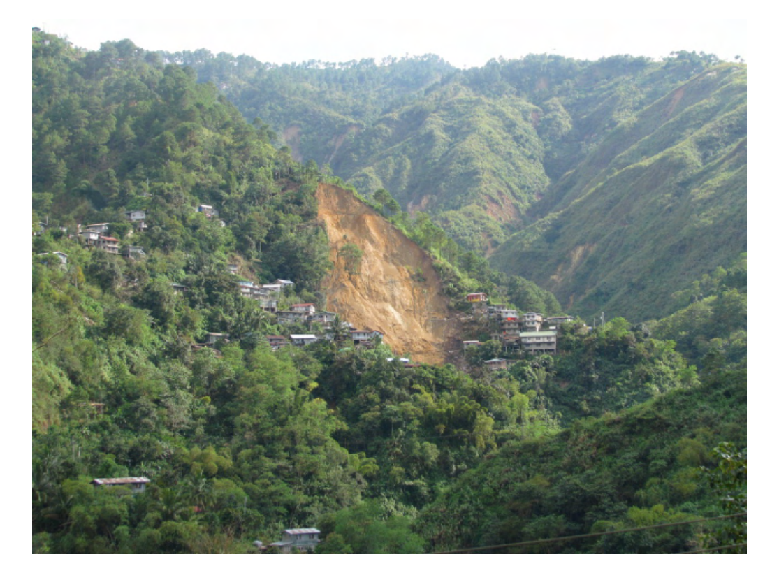
Photo-19 Landslide by Pepeng at Sitio Dalikno, Bgy. Ampucao Itogon, Benguet (CAR Region)