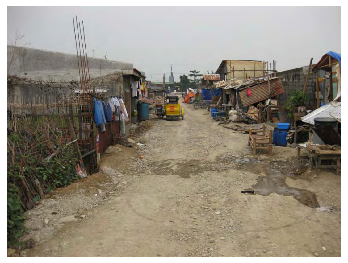
Photo-5 Lupang Arenda at Mangahan Floodway (Temporary evacuee due to TY Ondoy)