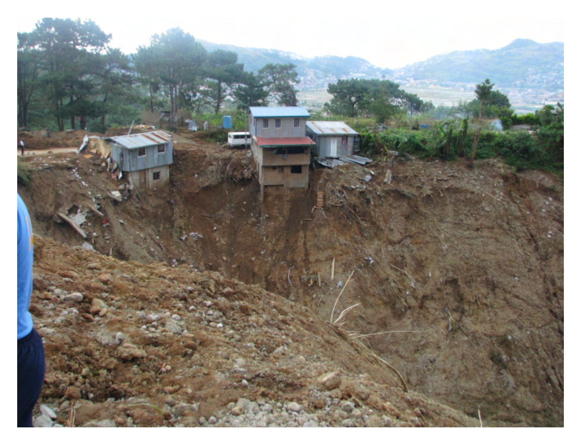
Photo-24 Landslide by Pepeng in Little Kibungan, La Trinidad, Benguet (CAR Region)