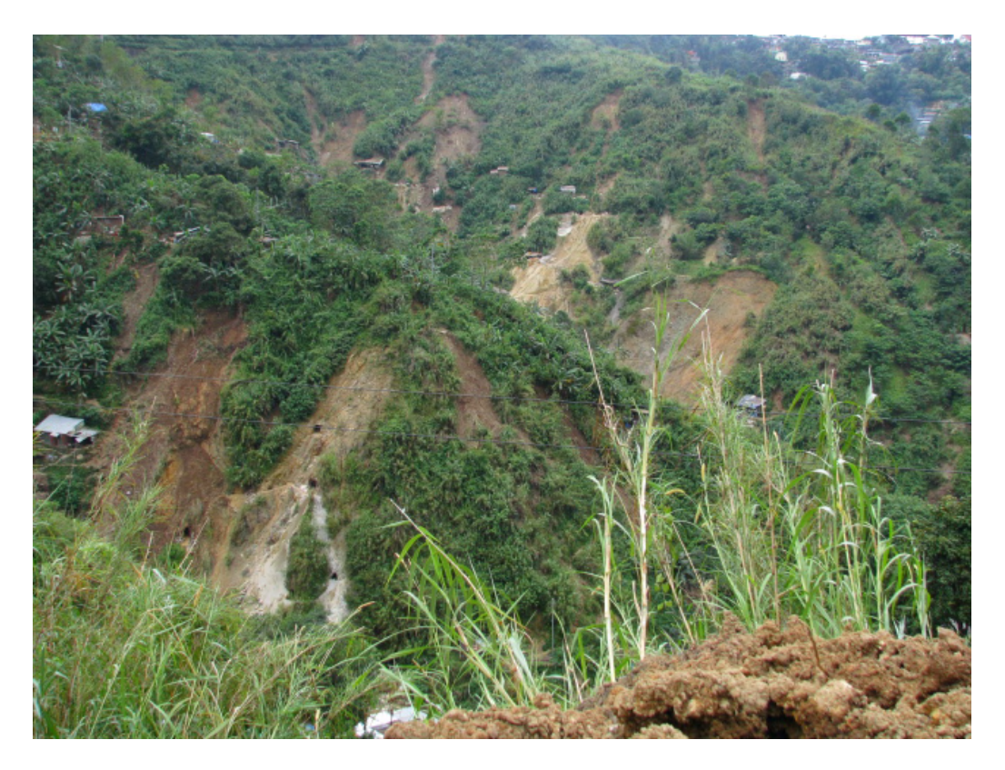
Photo-21 Landslide by Pepeng Sitio Kiangan, Bgy. Ucab, Itogon, Benguet (CAR Region)