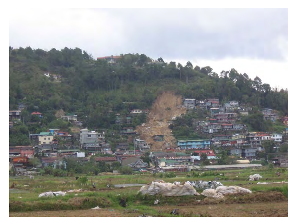
Photo-26 Landslide by Pepeng Sitio Buyagan, Poblacion, La Trinidad, Benguet (CAR Region)