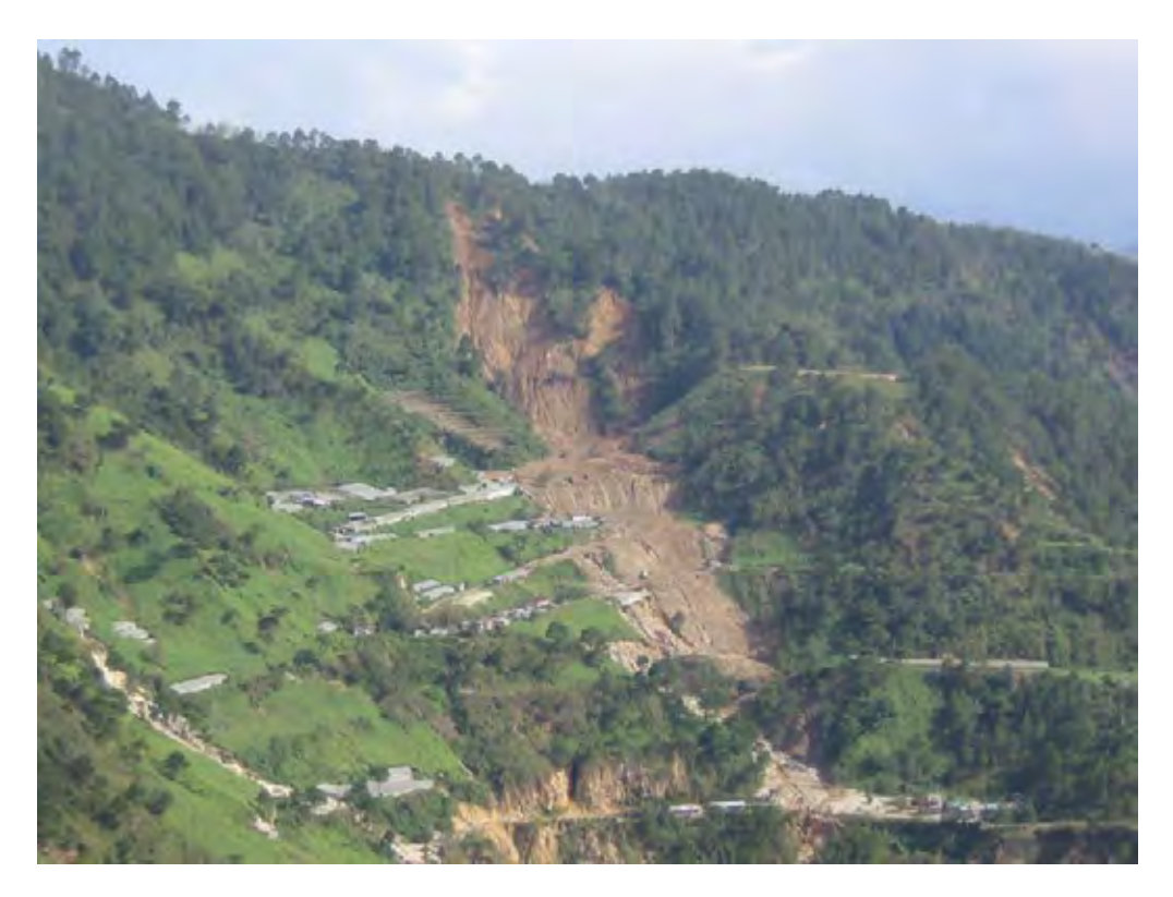
Photo-17 Landslide by Pepeng at Sto. Nino, Bgy. Ambassador Tublay, Benguet (CAR Region)