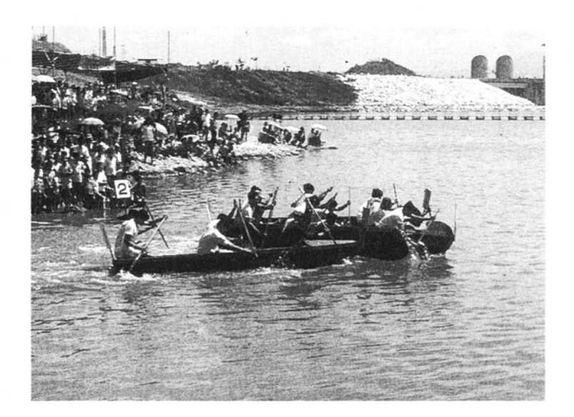
Canoe race on Karangkates Dam Reservoir

The Karangkates Dam offers an active storage capacity of 253,000,000 m<sup>3</sup>, or 282,000,000 m<sup>3</sup> when adding the portion created by the modified Lahor River Basin, with a maximum output of 105,000 kW. This is the largest-scale dam in the Basin and by itself provides 74.4% of the Basin's total active storage capacity and 43.7% of the Basin's total hydropower output of 240.15 x 10^3 kW. Construction of the Lahor Dam was started in 1973 to increase the flow rate into the Karangkates Dam reservoir by changing the course of the Lahor River. It was completed in 1977.