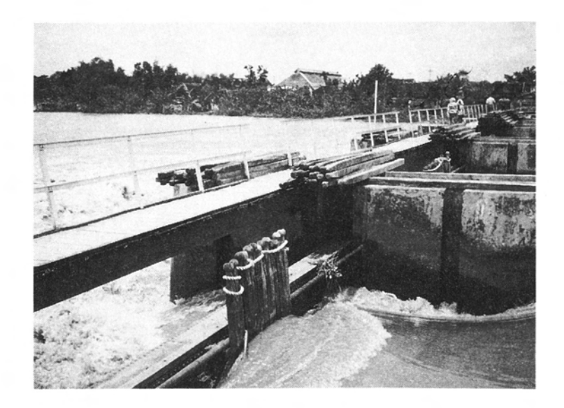
Needle gate of Gunungsari Dam

concrete walls are employed for water sealing, which is a large-scale construction method world-wide. The dam will contribute a supplementary supply of domestic and industrial water to Surabaya City and irrigation for Wonorejo district as well as the generation of 6,500 kW. The early completion of this project is hoped for.