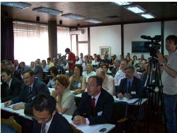
Conference hall, all 100 seats filled.