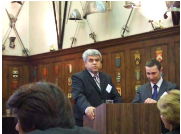
Farmakon MB, a private Serbian company, introduces its own mining activities. (It was not part of the original program but was added at the last minute).