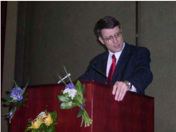
Greeting from Minister Popovic of MEM