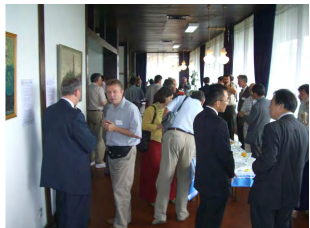
Coffee break before the 1 st session