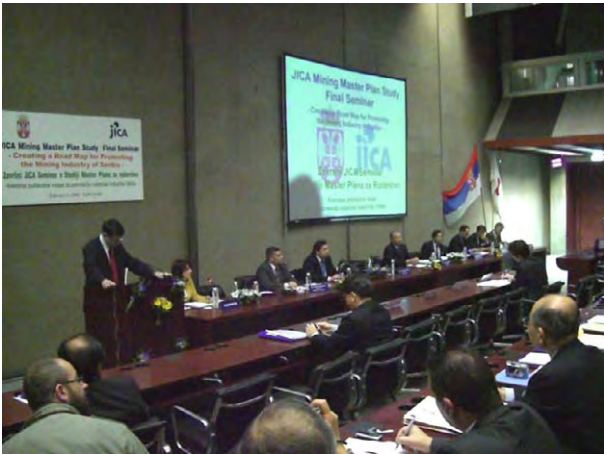
View of the meeting