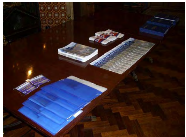
In addition to speech materials, attendees also received copies of "Investment Review", "Investment Guide CD" and other materials.