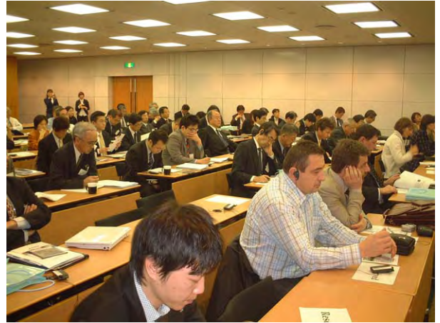
Sight of the seminar place