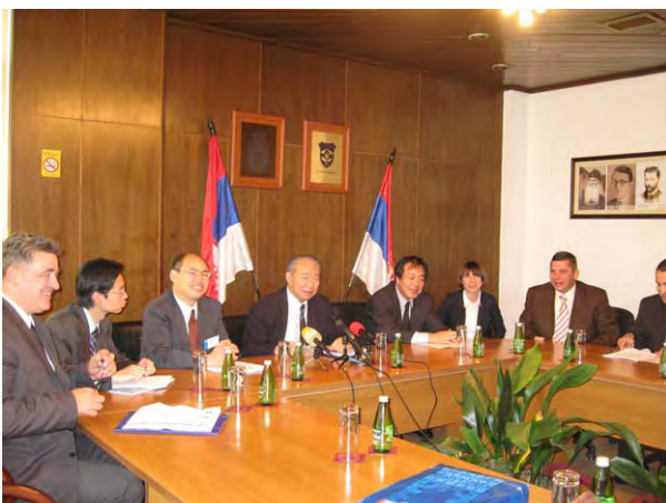
During the break, Ambassador, Representatives of the JICA Balkan Office, and others gave a press conference.