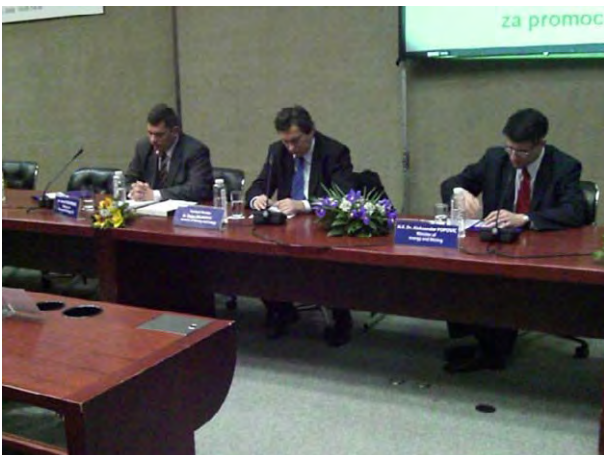
From right to left: Minister Popovic of MEM; Deputy Minister Rajkovic; Mr. Teodorovic