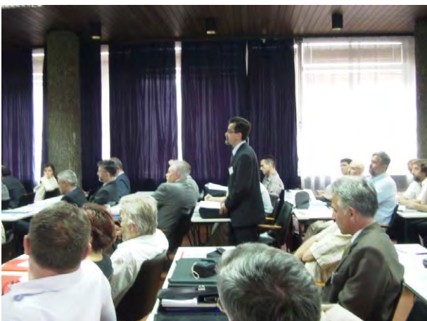
Discussion 1, an active discussion about each presentation