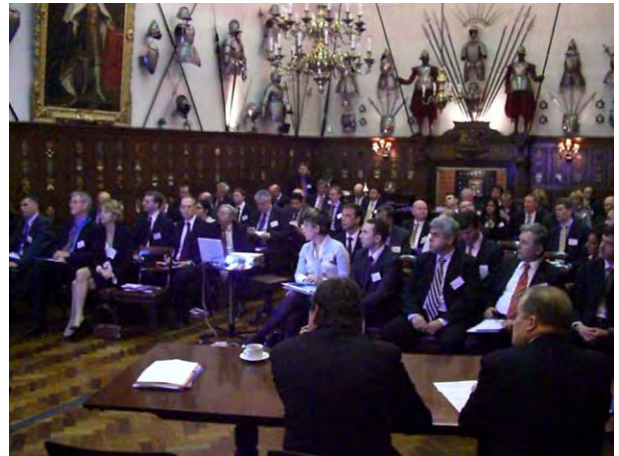
All 70 seats were filled.