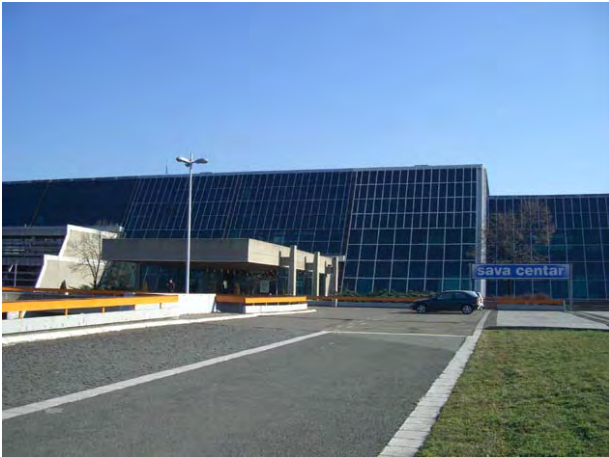
Where the meeting was held: Belgrade's SAVA Center