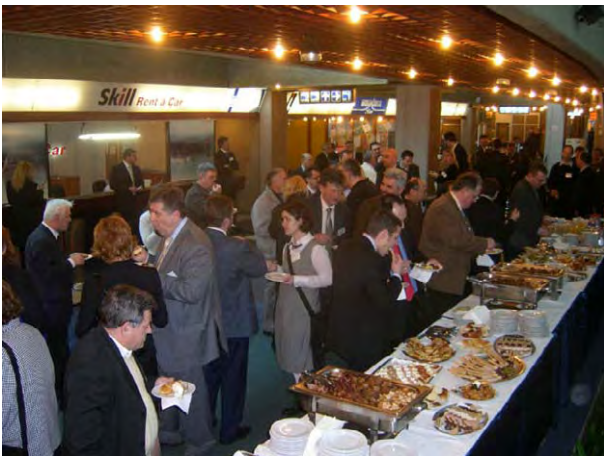
Festive atmosphere during a coffee break