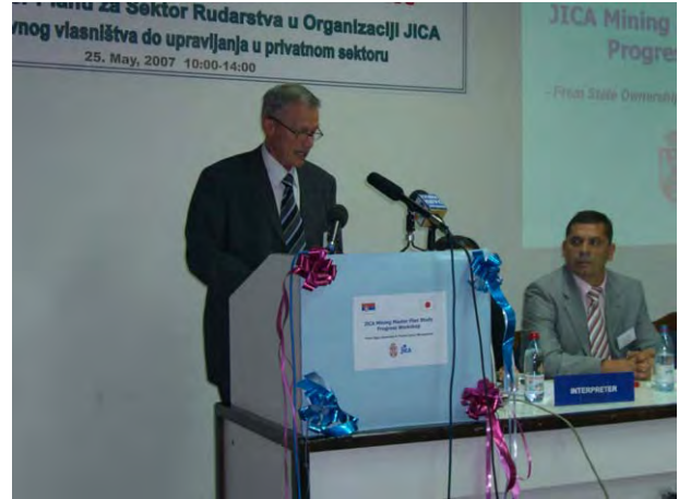
Address by General Secretary of the Ministry of Environmental Protection