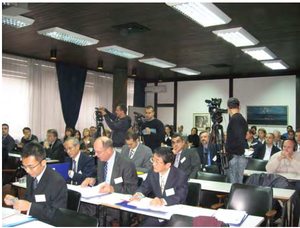
The Interim Workshop was held in Belgrade on October 19, 2007, which captured the interest of Serbian people and media.