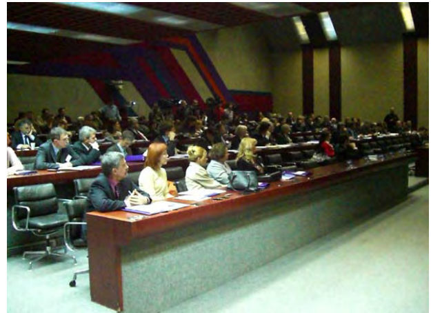
Another view of the meeting. About 130 people attended.