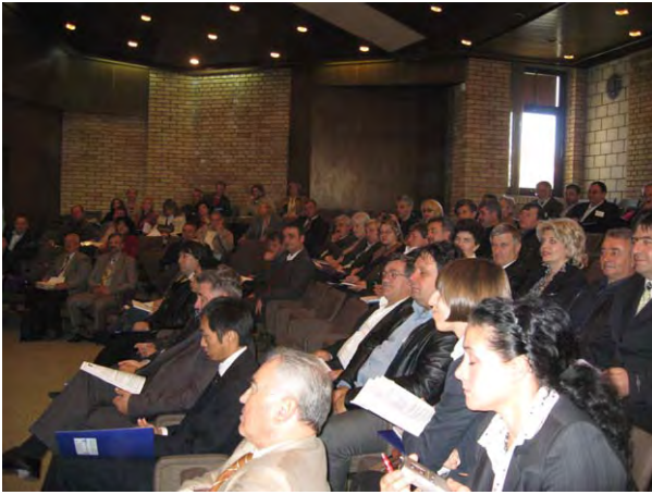
The conference hall was filled with participants at the opening of the Vranje regional workshop on October 16 th , 2007.