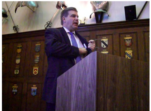
The Serbian Ambassador to London introduces Deputy Minister ライコビッチ of MEM.