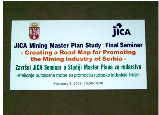
Banner announcing the opening of the seminar