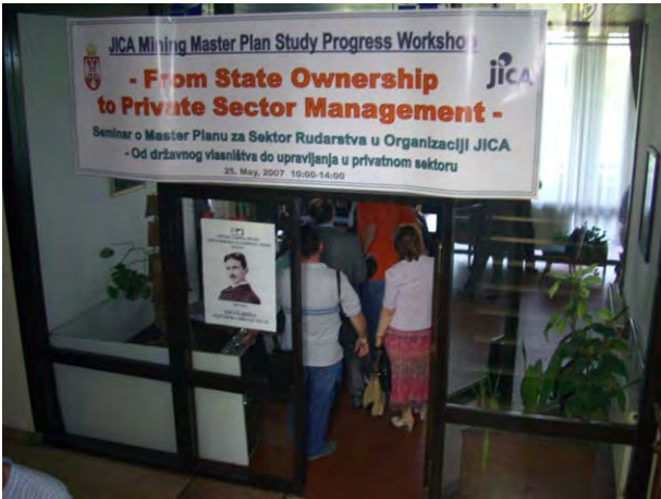
Entrance of the Nikola Tesla conference hall.