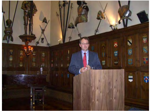
The Rio Tinto Company talks about its strategies, and its exploration program in Serbia.