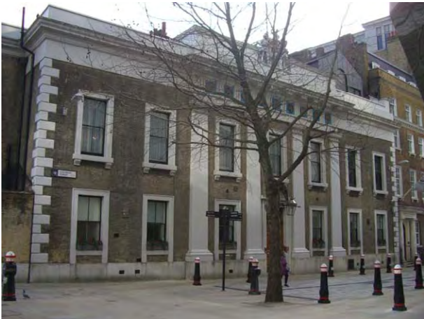
View of the meeting hall.