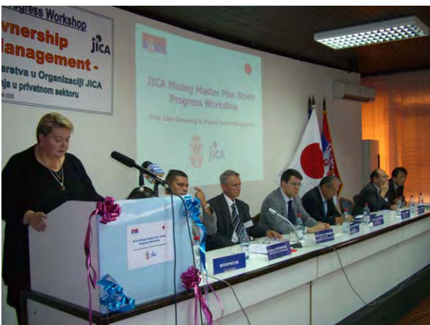
World Bank Country Manager, explaining the role of the World Bank in Serbia