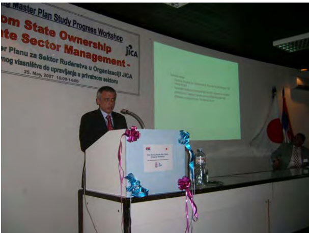
The president of Rudnik mine, giving a presentation as a representative of private mining companies