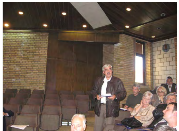
Intensive discussion at the end of Workshop.