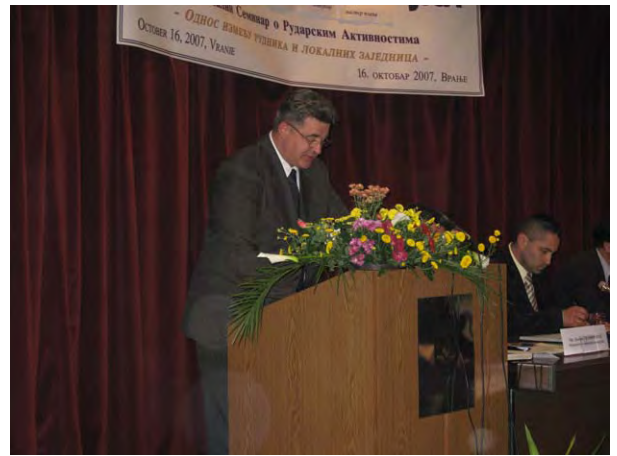
Mayor of Vranje greeted the participants.