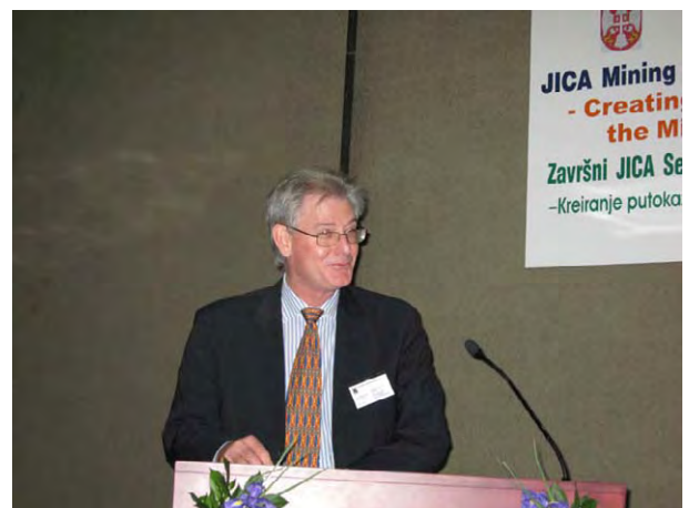
Euromax Company talking about its exploration activities in the Balkans. (It was not part of the original program but was added at the last minute).