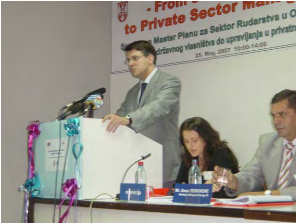
Opening address by Minister of Energy and Mining