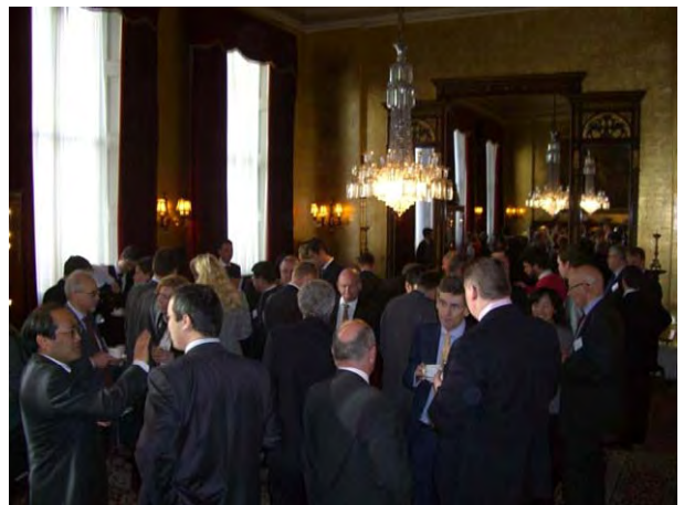
Festive atmosphere during a coffee break