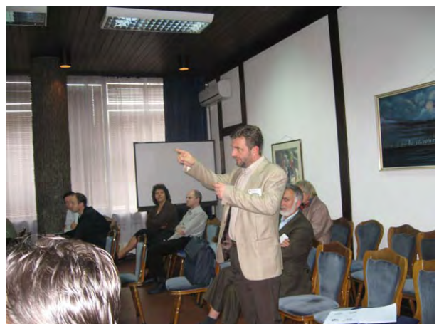
At the end of the Workshop, a very intensive discussion was held. The questions and answers went over the scheduled time, but the workshop finished with a great success and received favorable comments.