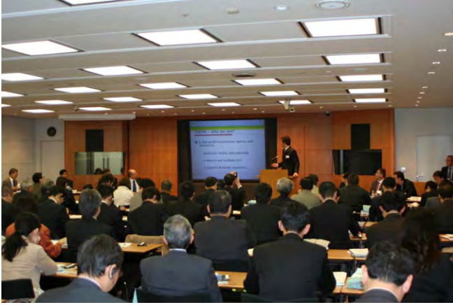
Sight of the seminar place