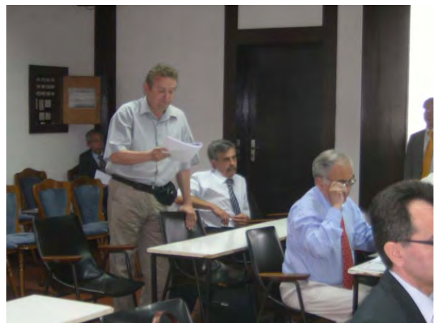
Discussion 2, a participant asking about information in the presentation handout