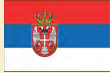
Republic of Serbia