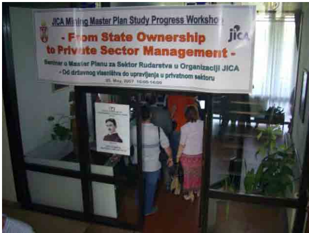
ワークショップ会場”Nikola Tesla 会議室”入り口