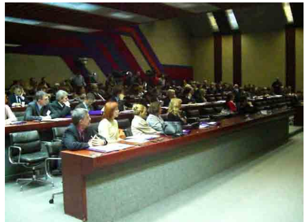
会場風景2。約 130 名が参加