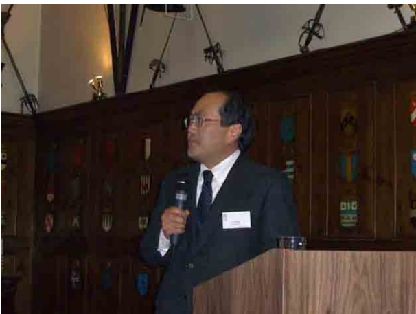
和田団員は MP 調査で構築した WebGIS を紹介