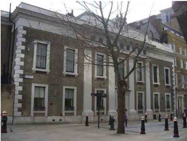
会場となった Armourers' Hall