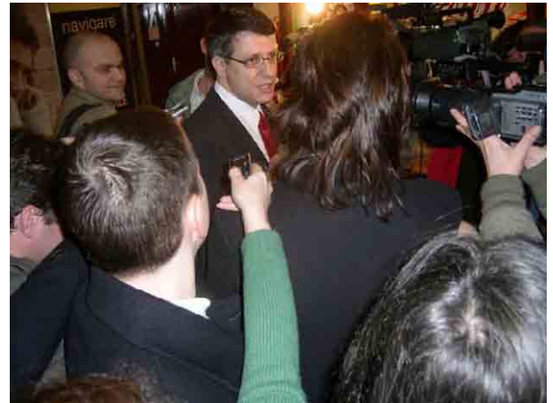
報道陣のインタビューに答える MEM ポポビッチ大臣