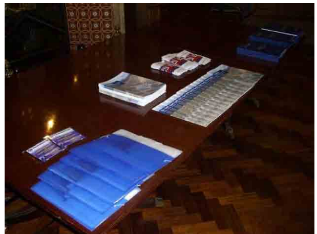
各講演資料ほか”Investment Review”、“Investment guide CD”等を配布