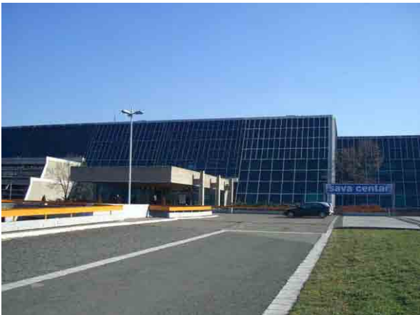
会場となった SAVA Center