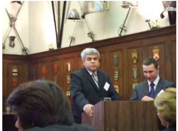
セ国民間企業”Farmakom MB”は自社の鉱業活動を紹介。 (当初プログラムには組み込まれていなかったが急遽講演することになった。)