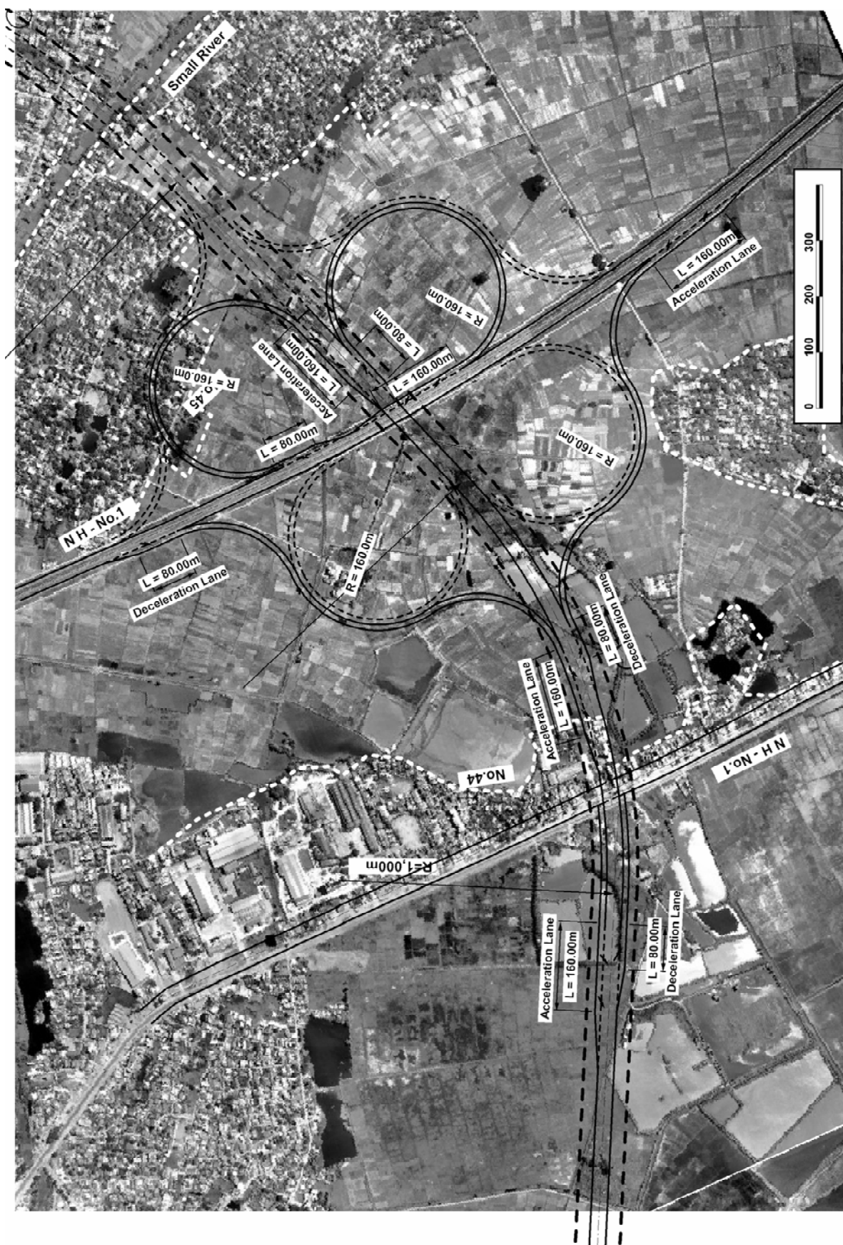
Figure 3.4.7 Intersection Plan for NH1 Expressway and RR4