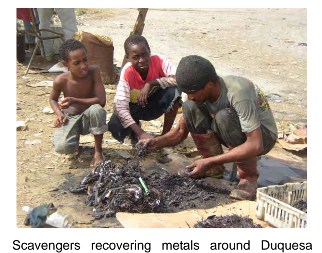
Survey of Recycling Market

landfill to sell them to recycling companies.