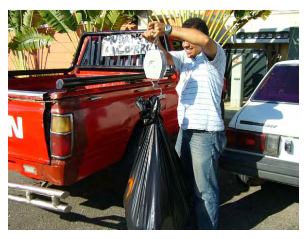
Collection of samples from houses