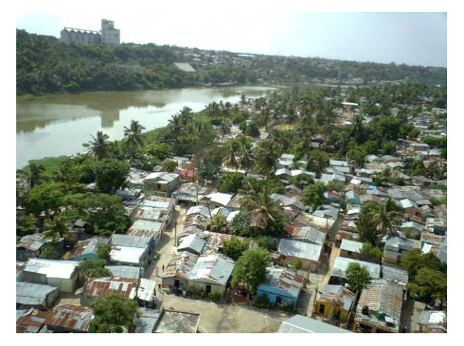
Houses settled at the shores of Ozama River