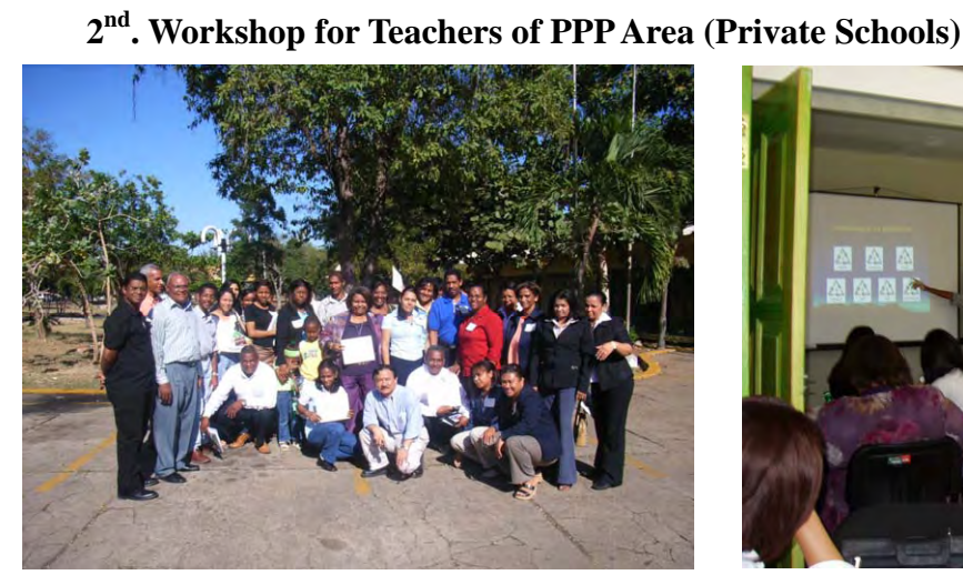
Participating teachers of private schools.