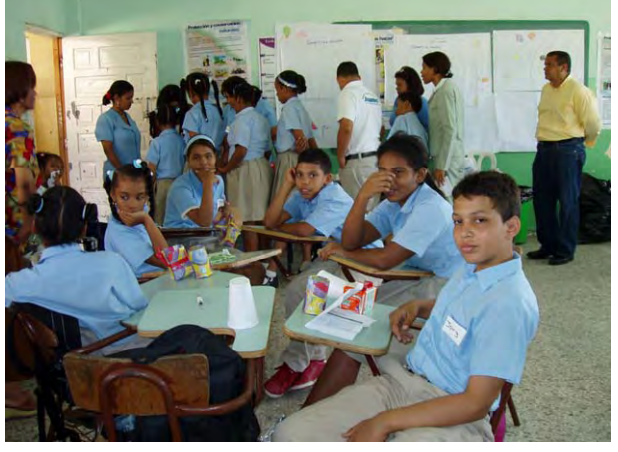
Student group participating in the workshop F.X. Bellini School