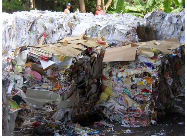
Packaging of paper for recycling

Metal melting at local smelting companies .