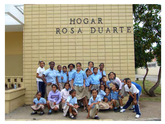
Participating students of experimental workshop Hogar Domingo Savio School