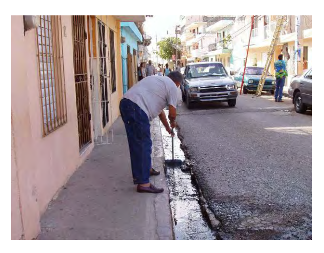
Resident sweeping sidewalks