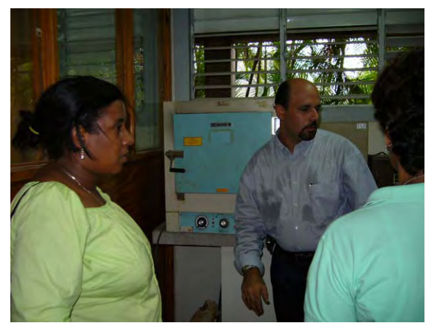
The components were dried to analyze its content of humidity.

The reduced sample was placed in plastic containers calibrated to register its volume and weight.