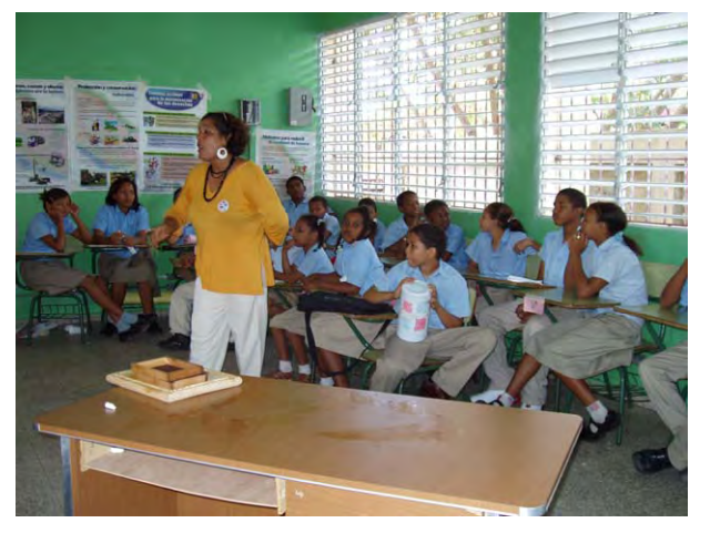
Experimental workshop opening speech by school Participating students of experimental workshop principal