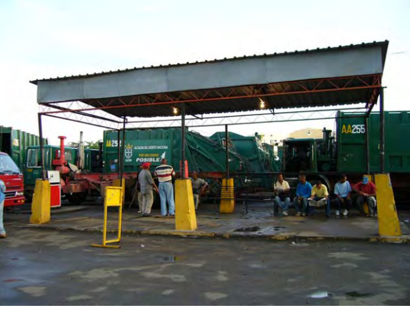
Interview with waste collection truck driver