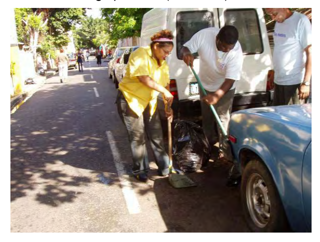
Residents cleaning streets