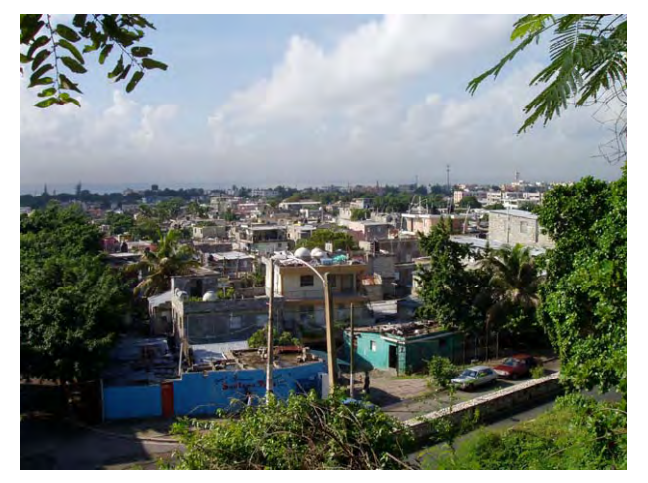
View of Study Area