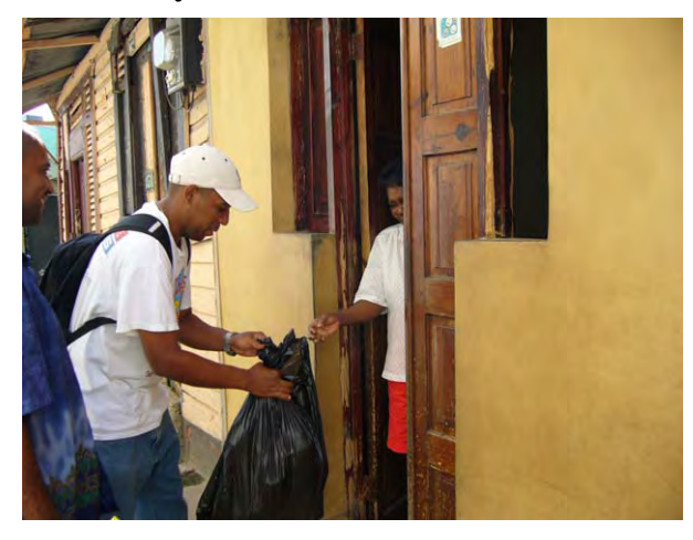
Collection of samples from houses