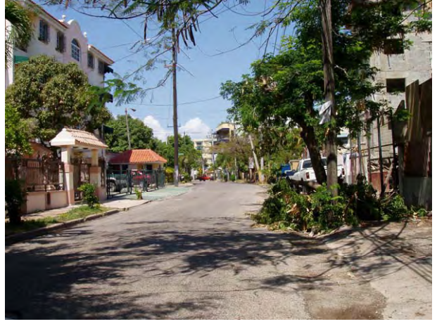
Street of PP area (trees pruning and branches in streets)