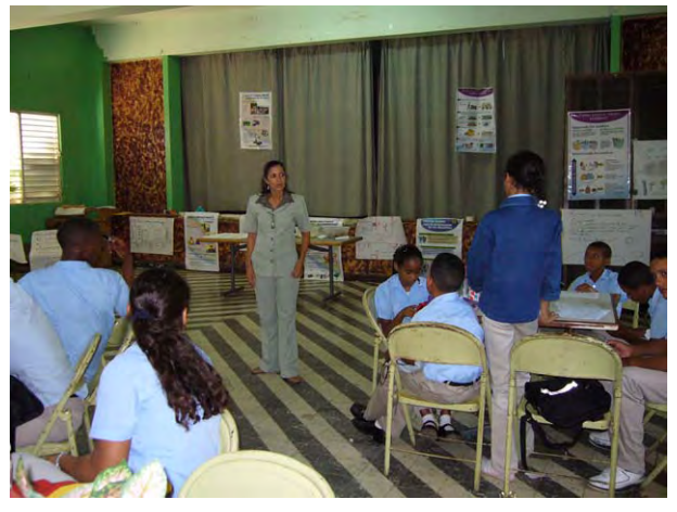
Experimental workshop opening speech by teacher Técnico Movearte School