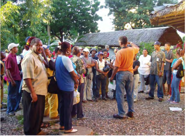
Instructions to ADN workers before commencement of PPP