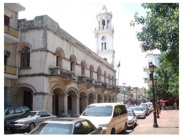
Consistorial Palace (Municipal Palace) in Colonial City