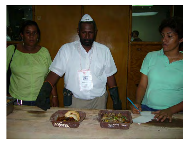
The reduced sample was divided into components

After mixing them adequately, the waste was divided in four segments of approximately the same size.