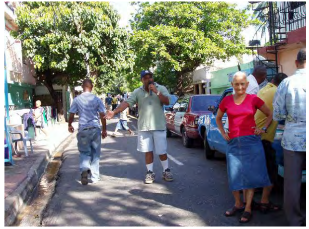
Neighbors' Committee president showing the results of the cleansing operative