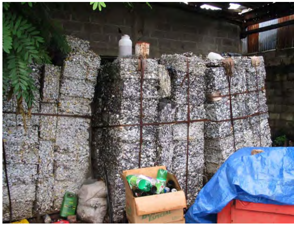
Plastic recycling companies.