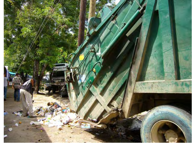
Survey of collection works