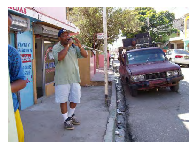
Neighbors' Committee president calling to cooperate in the cleansing operation (San Jose)