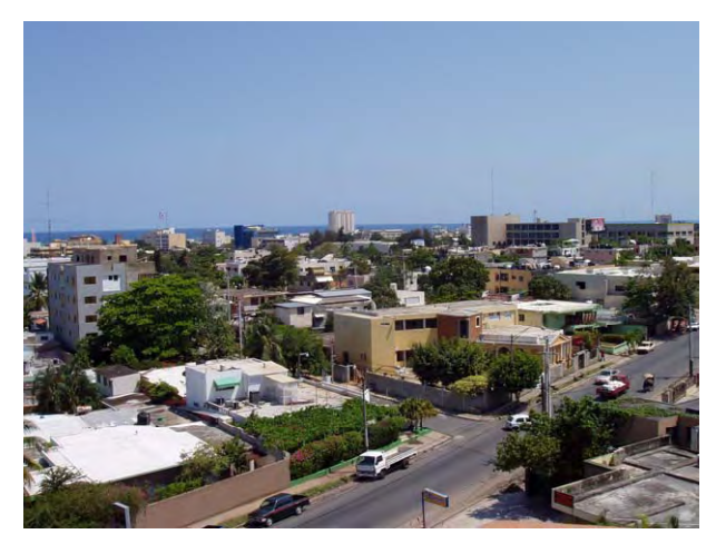
Other view of Study Area