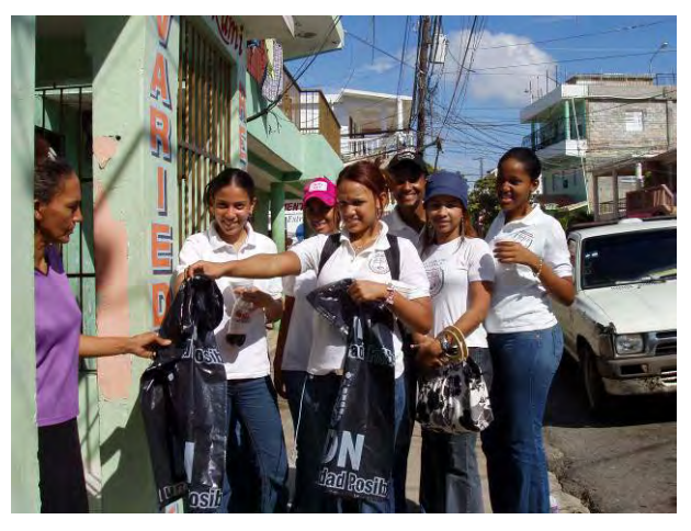
Students distributing waste bags to residents