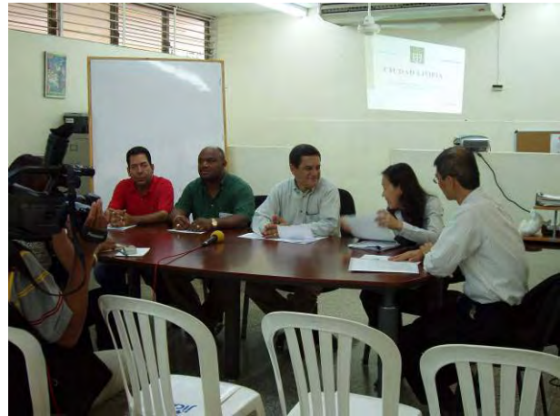
Introduction and explanation to the press