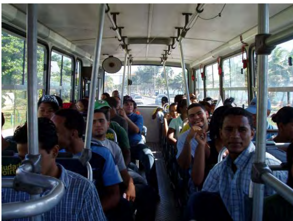
Young volunteers from Youth Department for flyers distribution