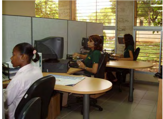
Opinion survey from the Customer Office (Triple A)