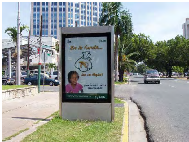
D2: "In the bag... it looks better" (installed in Ave, W. Churchill)