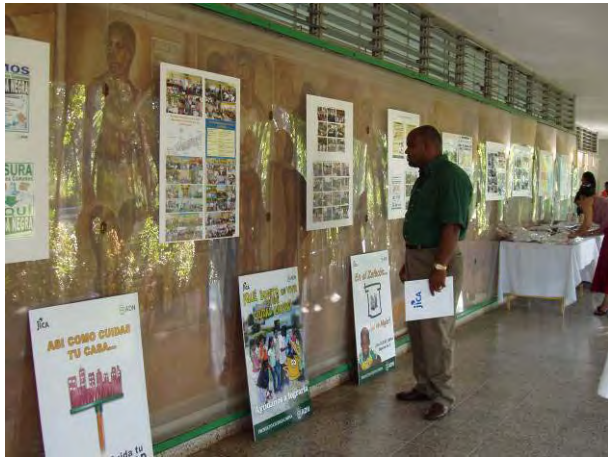
Exhibition of photos and signboards during the press tour