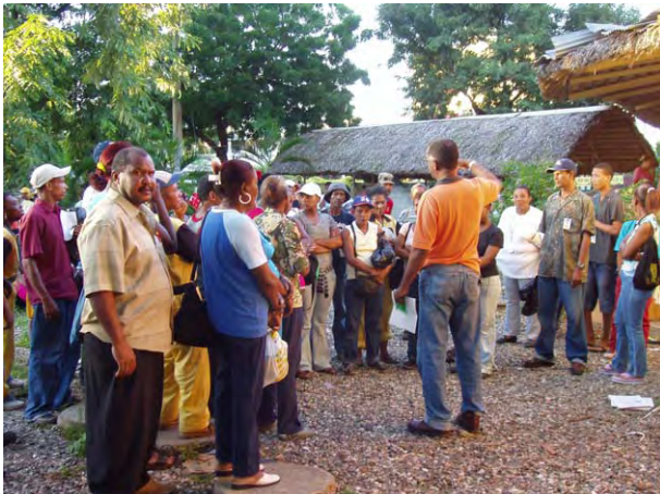
Instructions to ADN workers before commencement of PPP