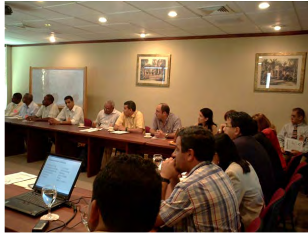
Meeting with Technical Working Group