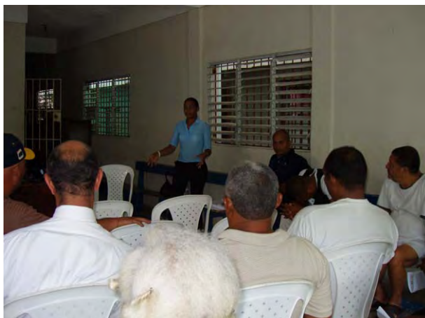
Meeting with residents (El Manguito)