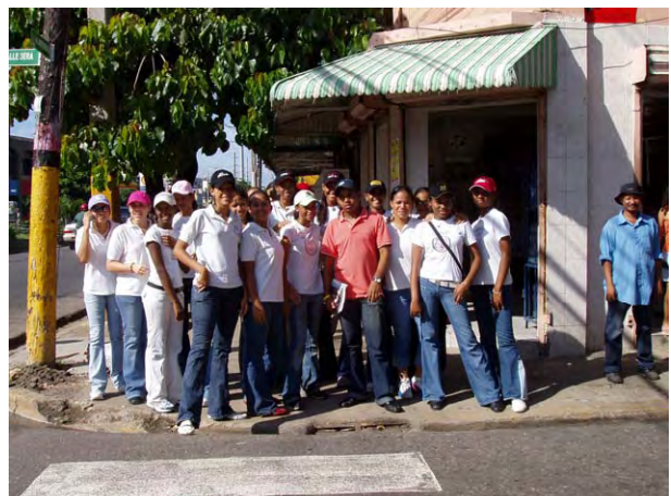
High school students cooperating in the distribution of flyers