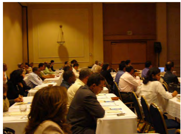
People invited to the Seminar