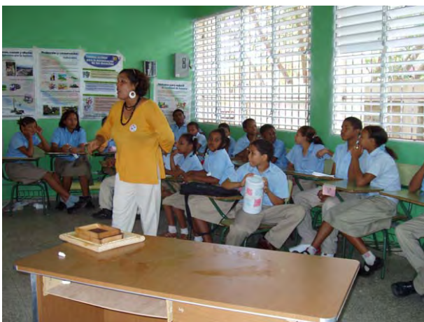
Experimental workshop opening speech by school principal