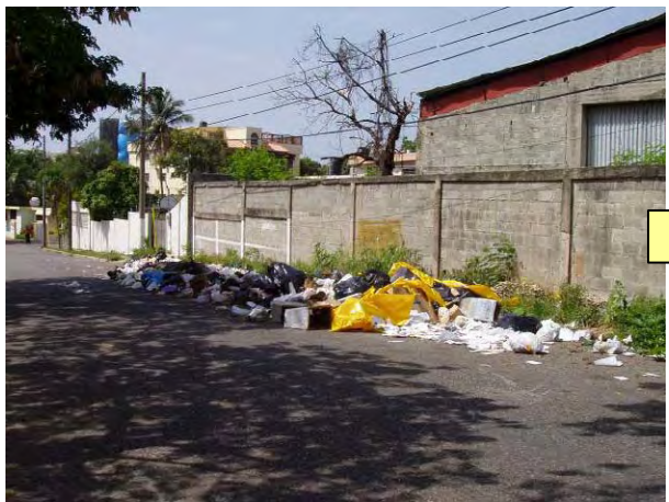
San Juan Bautista de la Salle St. near military zone