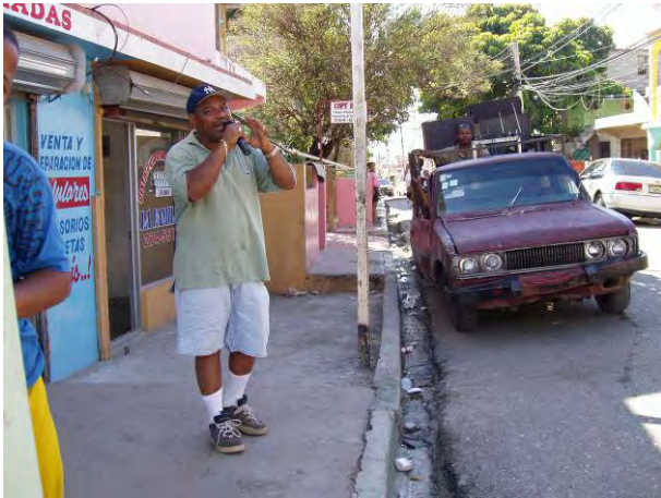
Neighbors' Committee president calling to cooperate in the cleansing operation (San Jose)