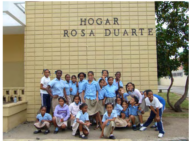
Participating students of experimental workshop Hogar Domingo Savio School