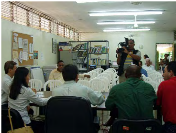
Introduction and explanation to the press