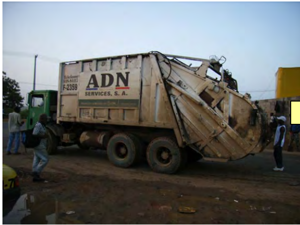
Condition of collection compactor truck