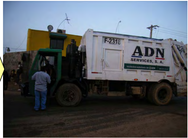
Condition of collection compactor truck