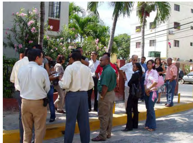
Site visit to PP area (sector of Ave. Defillo and Sagrario Diaz-Bella Vista)