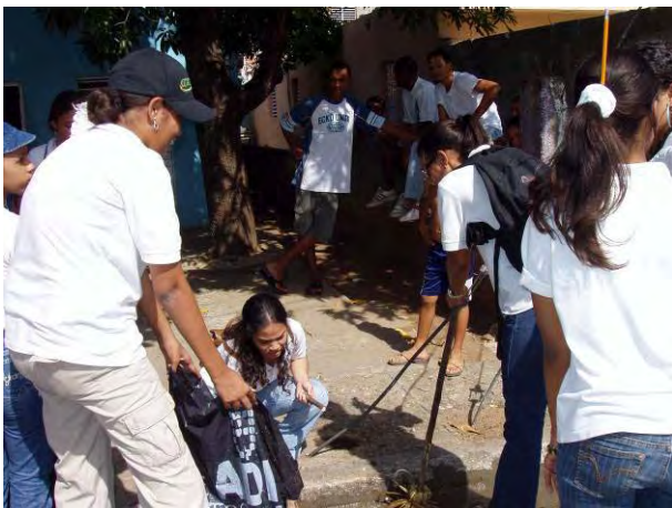
Students cooperating in the cleansing operation