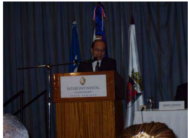
Speech of Director of JICA