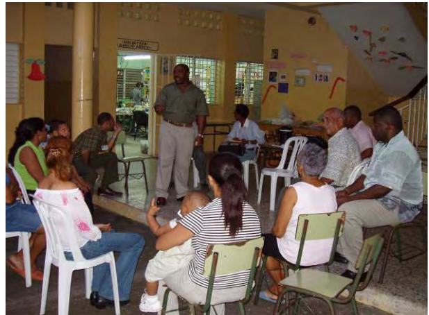
Meeting and explanation of PPP to residents and requesting cooperation for cleansing operation