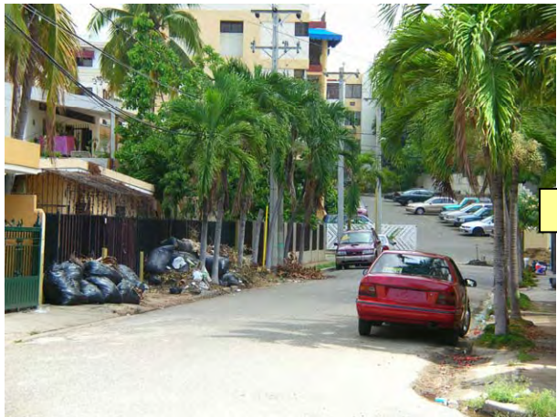
Street in PP Sector