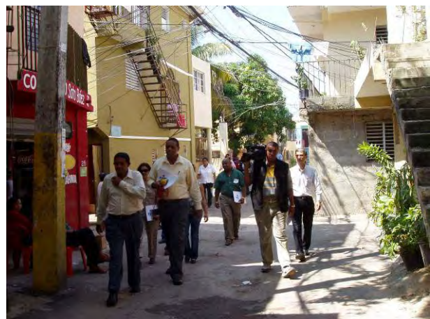
Touring the area (sector of Ave. Defillo y Sagrario Diaz-Bella Vista)