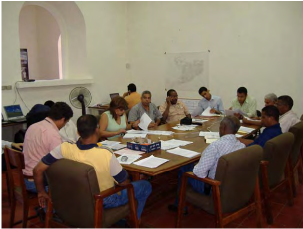
Meeting with collection service contractors and managers