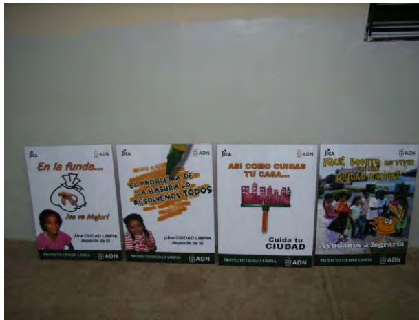
Samples of signboards for advertising