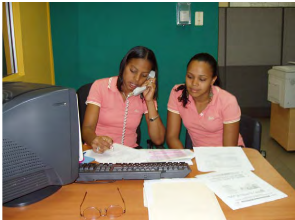
Implementation of resident opinion survey by C/P and volunteer from the Youth Dept.