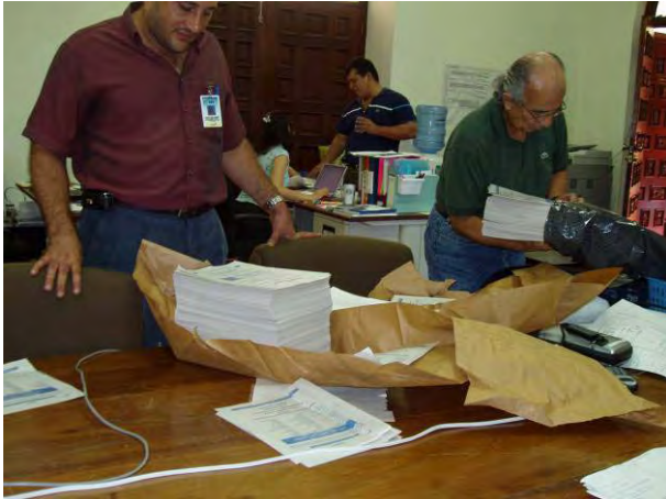
Preparation of flyers