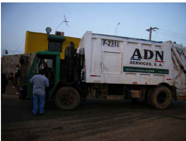
Clean collection compactor truck