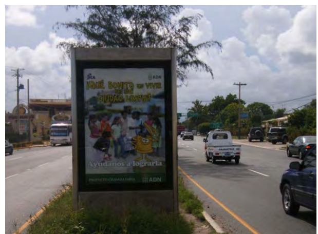
D5: How beautiful is to live in a Clean City!