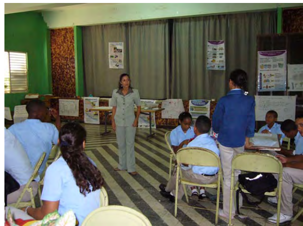
Experimental workshop opening speech by teacher Técnico Movearte School