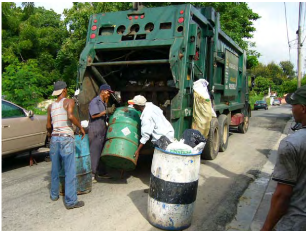
Collection works (before PP, without uniforms)