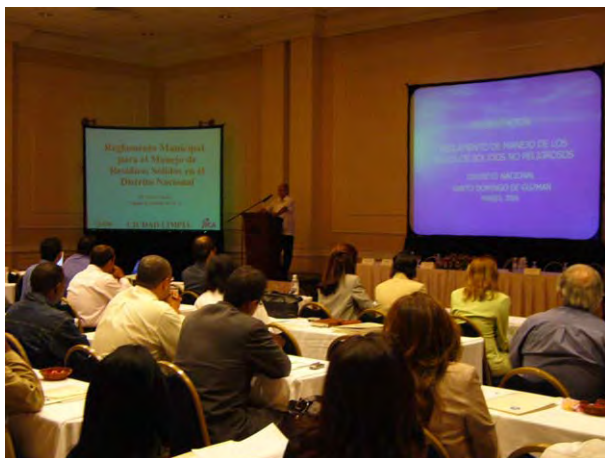
Presentation of the 1 st . Seminar