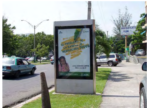
D1: "Waste problem must be solved by all" (installed in Ave, W. Churchill)