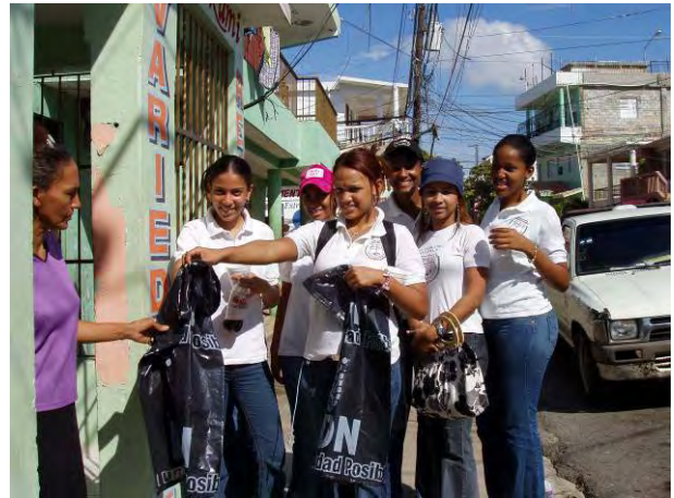
Students distributing waste bags to residents