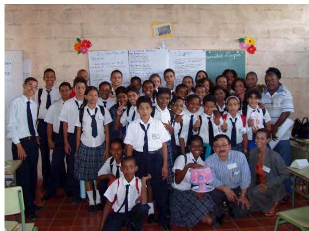
Participating students of experimental workshop