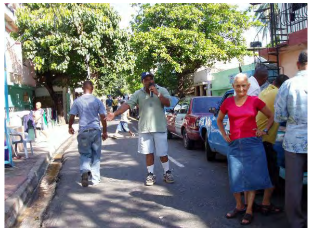
Neighbors' Committee president showing the results of the cleansing operative