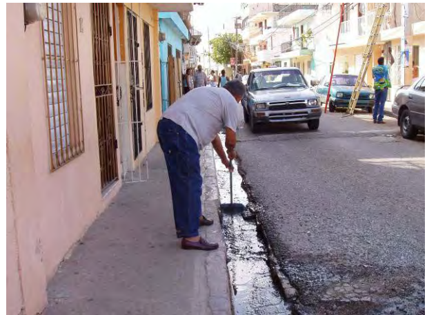
Resident sweeping sidewalks