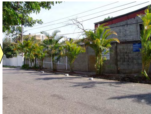
San Juan Bautista de la Salle St. near military zone