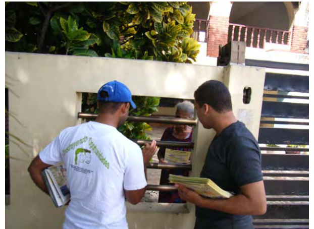
Flyers distribution by volunteers of Youth Dept.