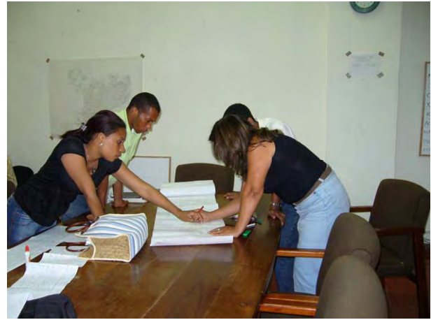
Waste collection route survey