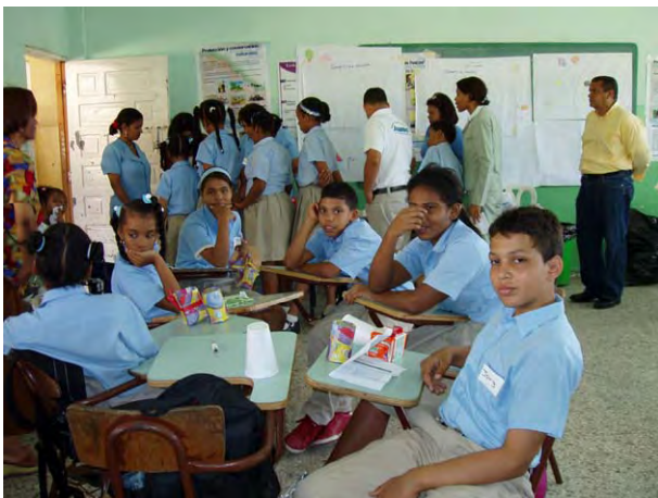
Student group participating in the workshop F.X. Bellini School