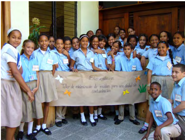
Participating students of experimental workshop San José School