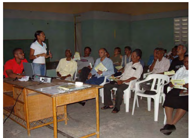
Meeting with residents (Bella Vista)