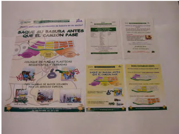
Designed and produced information materials for the pilot projects.