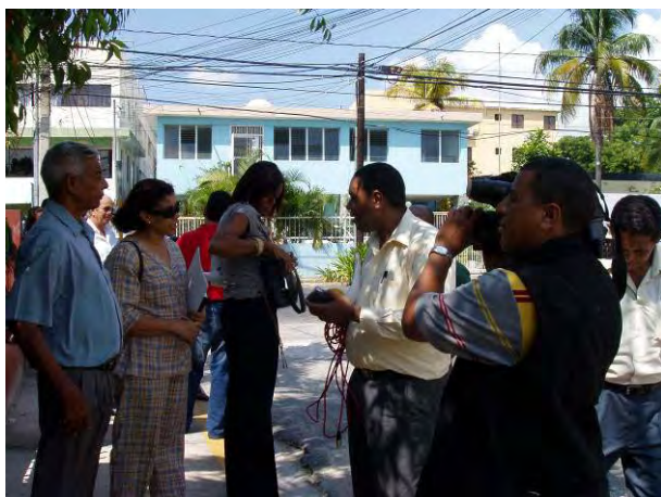
Interview with residents by the press (sector of Ave. Defillo and Sagrario Diaz-Bella Vista)