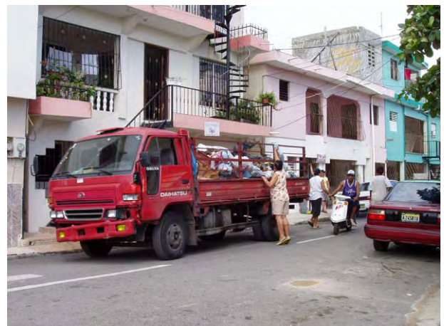
Residents cooperating with collection activities in areas of difficult access for compactor trucks