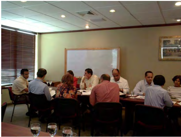
Several meetings were held with the C/P to analyze the progress of the Study.