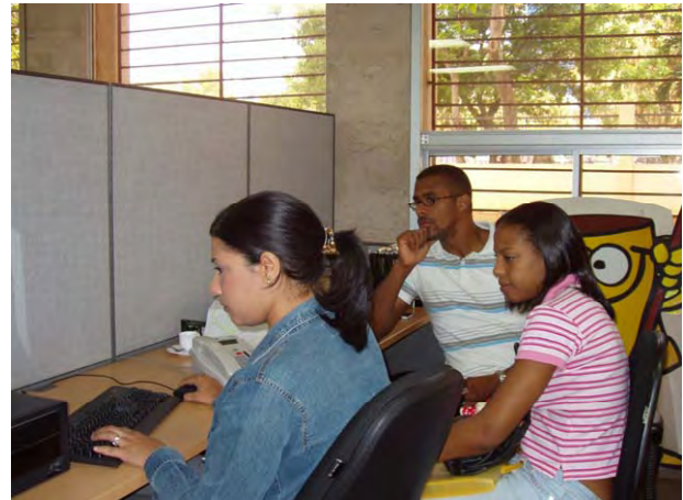
C/P training on resident opinion survey at Triple A