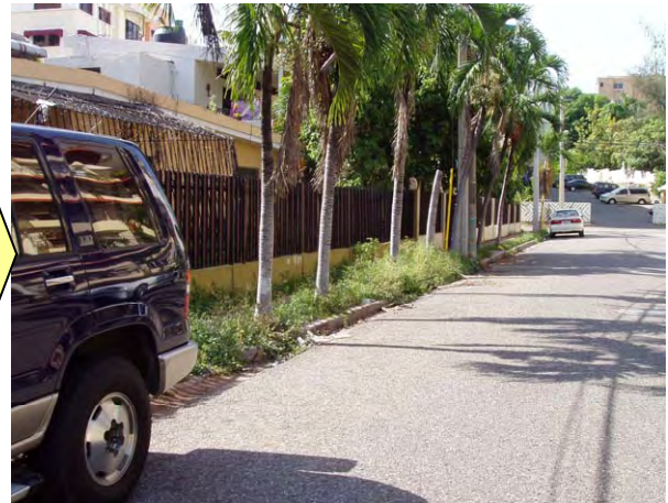
Street in PP Sector