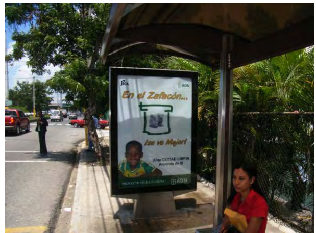
D3: "In the container ...it looks better"