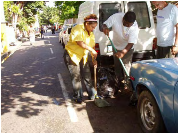
Residents cleaning streets