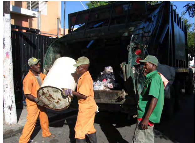
Collection works (after PP, with uniforms)