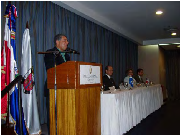
Speech of Mayor of ADN