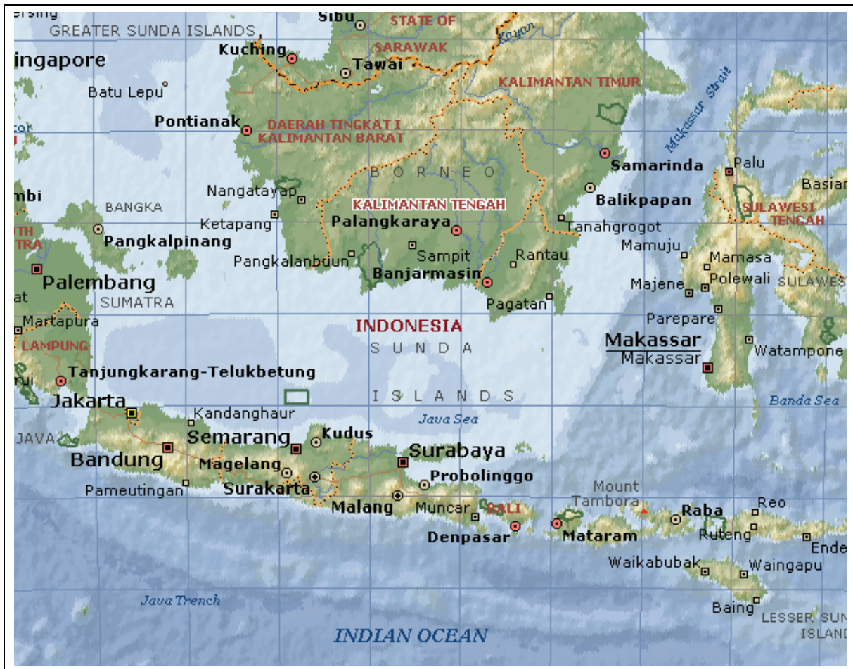
Location Map of Indonesia and Bali Island