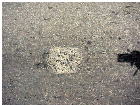
Wheel traction, taken on June 2, 2006