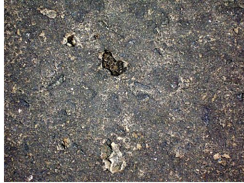
Holes on carriageway, taken on June 2, 2006