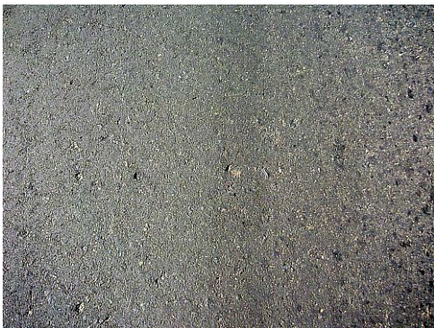
Holes remained, taken on February 13, 2006