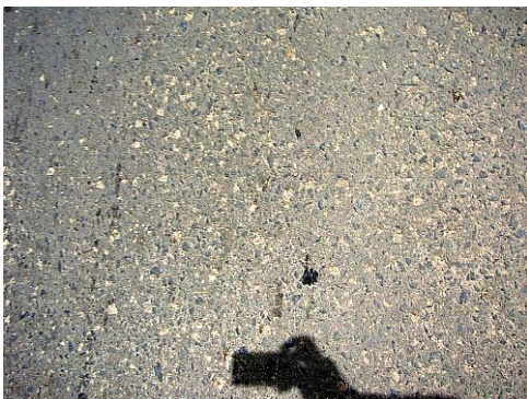
Existence of holes due to loss of coarse aggregate, taken on June 2, 2006