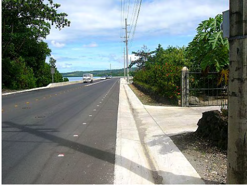
Existence of holes due to loss of coarse aggregate, taken on January 27, 2006