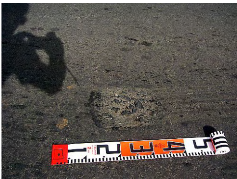
Wheel traction, taken on February 13, 2006