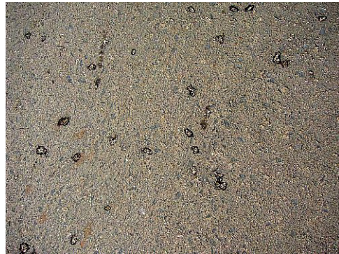
Holes on shoulder, taken on June 2, 2006