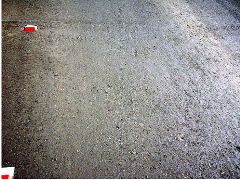
Existence of holes due to loss of coarse aggregate, taken on February 13, 2006