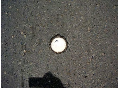
Depressed Stud, taken on June 2, 2006