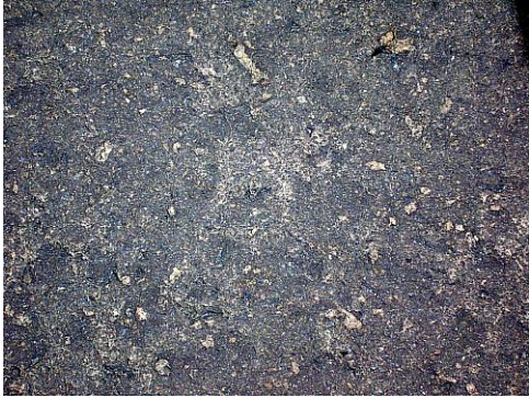
Holes remained, taken on June 2, 2006