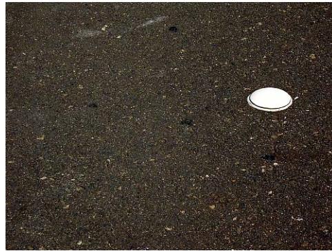
No damage at the area with roof