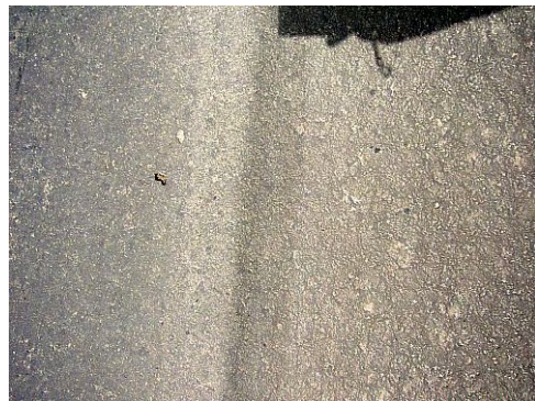
Local rutting and scratching surface by sudden wheel traction, taken on June 2, 2006