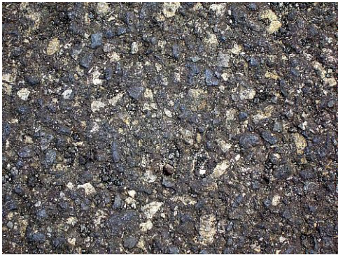
Pavement damage at the area without roof