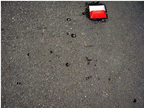
Holes on shoulder, taken on June 2, 2006