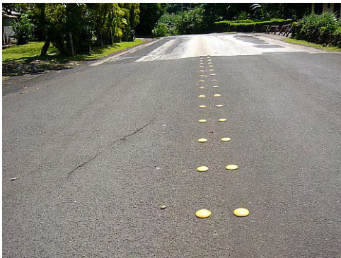
C-section STA6+030 Ravelling in progress