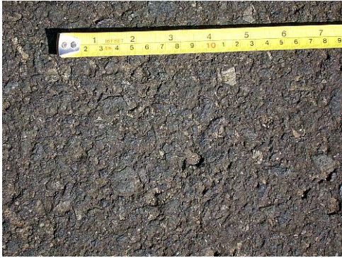
Loss of coarse aggregate and fine aggregate at the area without roof