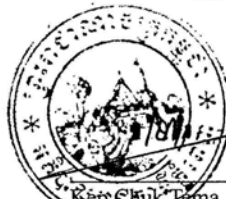
Keat Chhak Tema Governor Municipality of Phnom Penh Kingdom of Cambodia