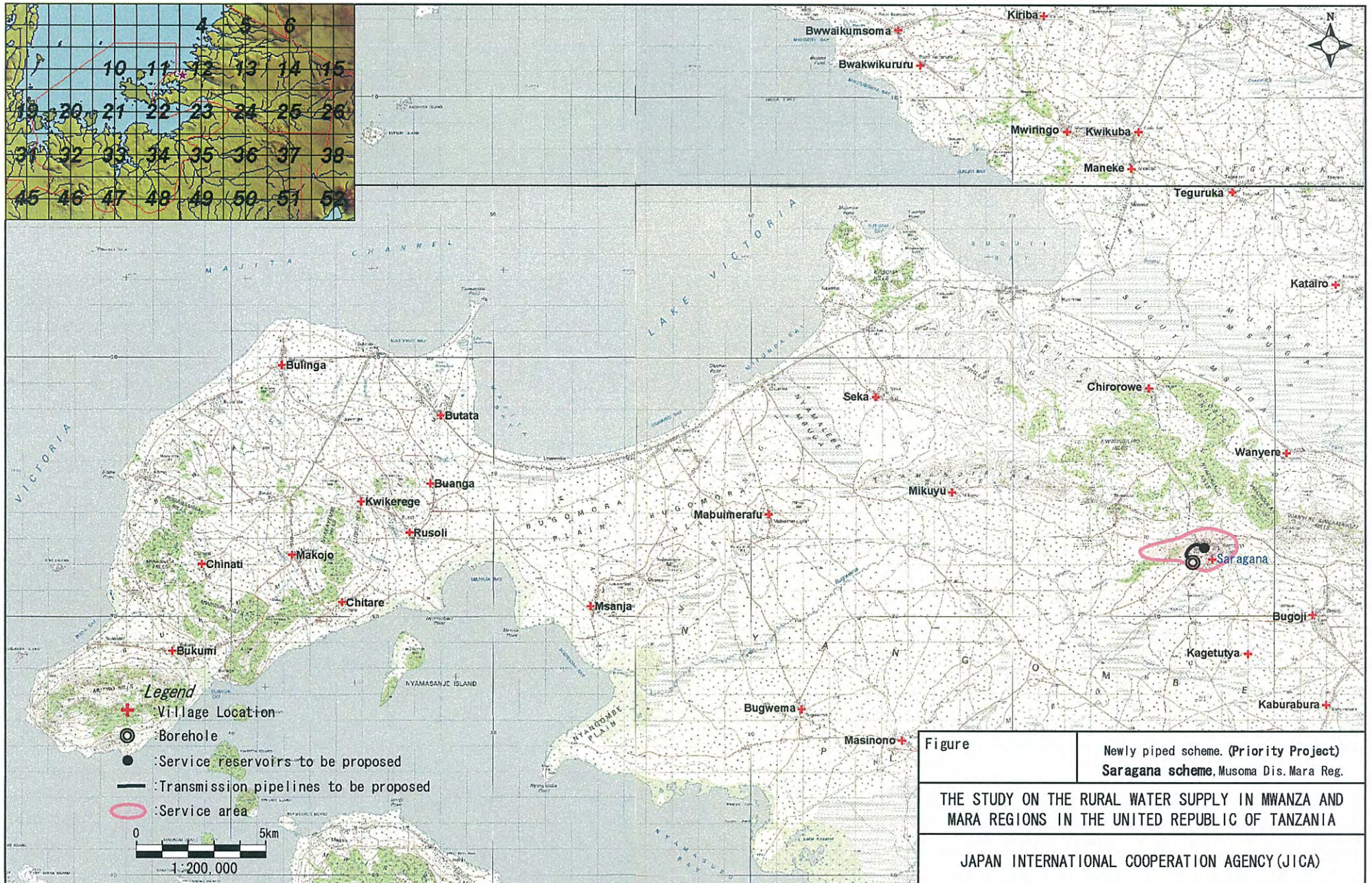
Figure Newly piped scheme. (Priority Project) Saragana scheme. Musoma Dis. Mara Reg. THE STUDY ON THE RURAL WATER SUPPLY IN MWANZA AND MARA REGIONS IN THE UNITED REPUBLIC OF TANZANIA JAPAN INTERNATIONAL COOPERATION AGENCY (JICA)