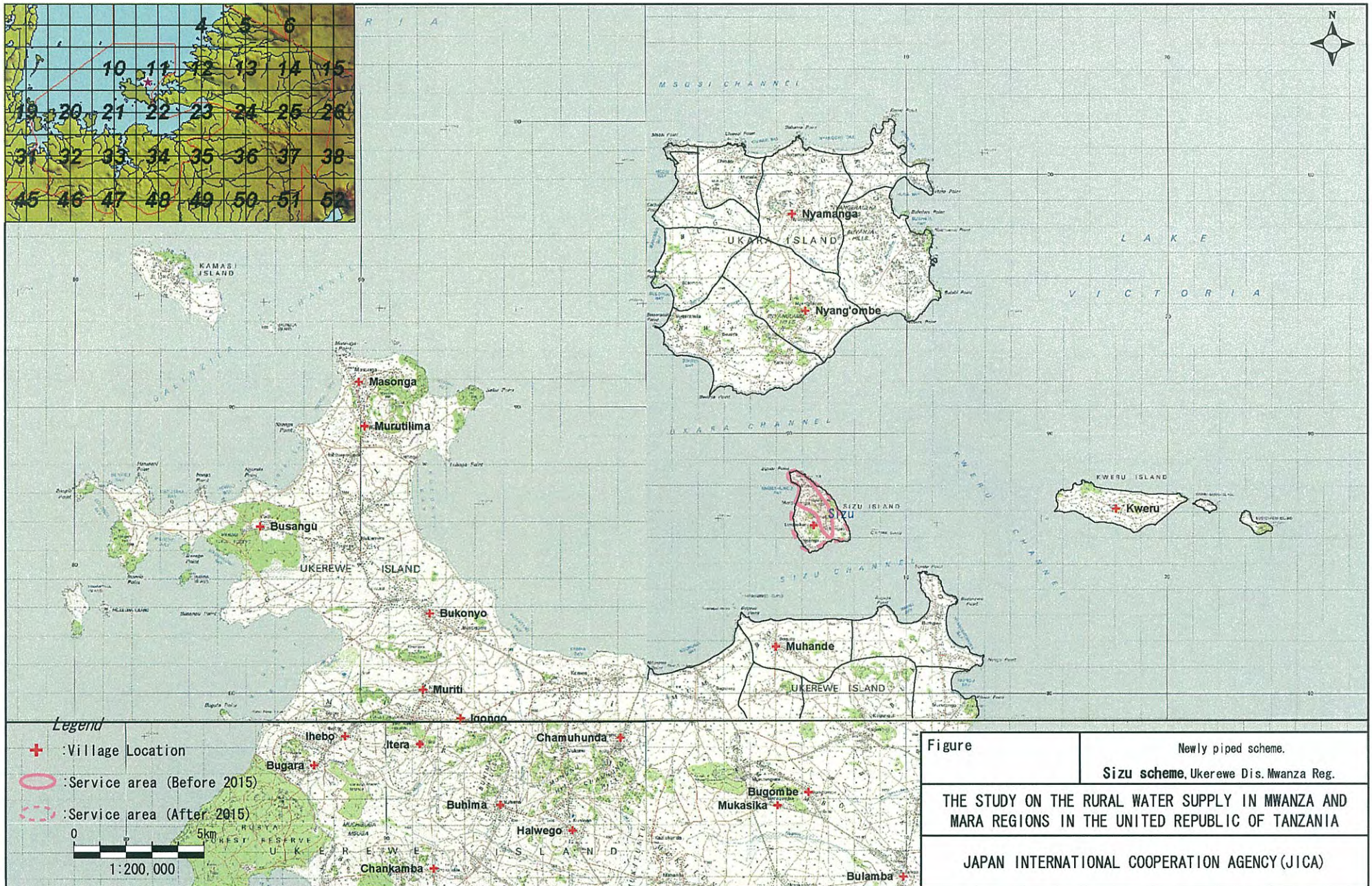
Figure Newly piped scheme. Sizu scheme, Ukerewe Dis. Mwanza Reg. THE STUDY ON THE RURAL WATER SUPPLY IN MWANZA AND MARA REGIONS IN THE UNITED REPUBLIC OF TANZANIA JAPAN INTERNATIONAL COOPERATION AGENCY (JICA)