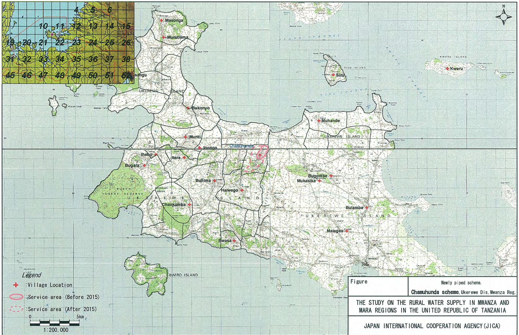
Figure Newly piped scheme. Chamuhunda scheme, Ukerewe Dis. Mwanza Reg. THE STUDY ON THE RURAL WATER SUPPLY IN MWANZA AND MARA REGIONS IN THE UNITED REPUBLIC OF TANZANIA JAPAN INTERNATIONAL COOPERATION AGENCY (JICA)