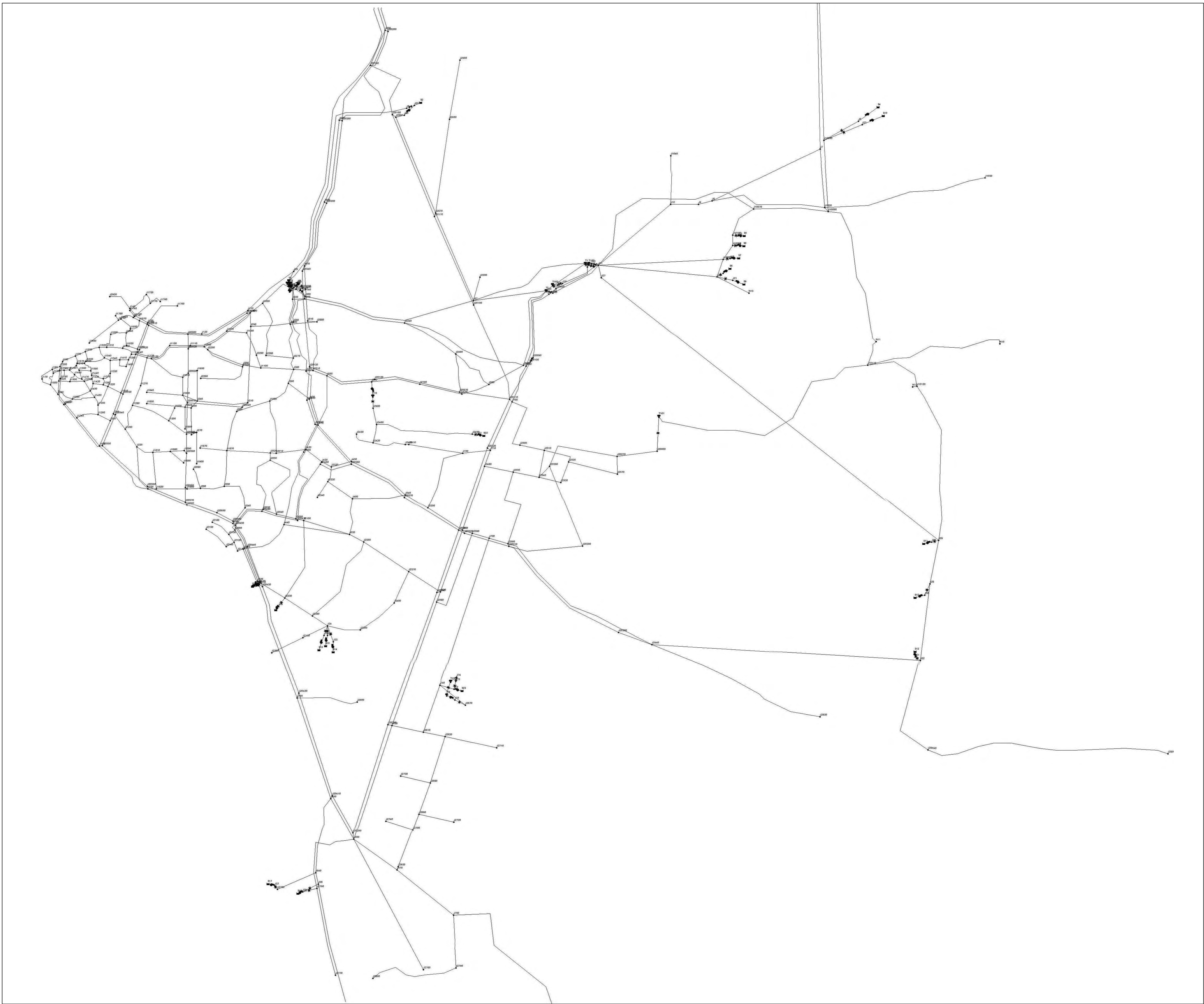
ZANZIBAR WATER SUPPLY PIPE NETWORK - 2/3 (URBAN CENTRE)