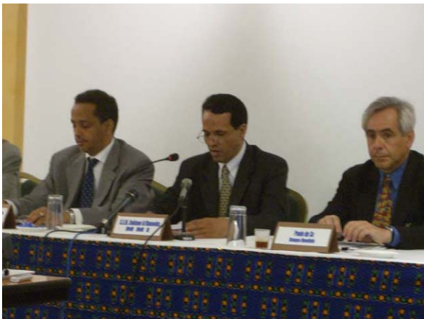
4. Opening address by the minister of MMI. left: the minister of MED right: Task manager of the World Bank