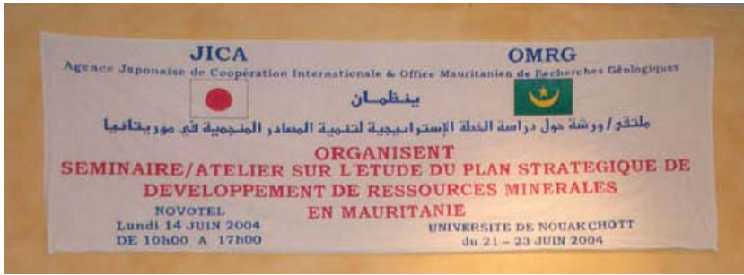
1. A banner for Seminar & Workshop