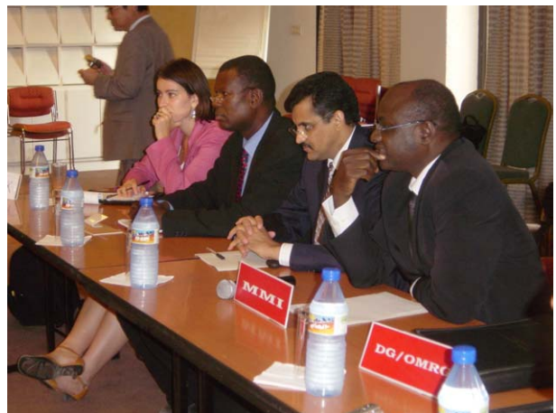
From right: Secretary General of MMI (chairman of the meeting), Mauritanian Ambassador at Japan, minister advisor, officer of the World Bank