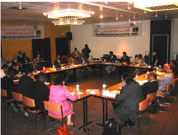
24 people participated in the meeting from the mining agencies, private companies, World Bank, JICA, etc.