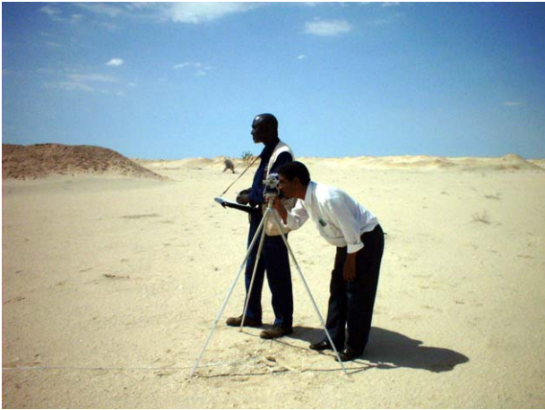
Field training for topography at a gypsum mine