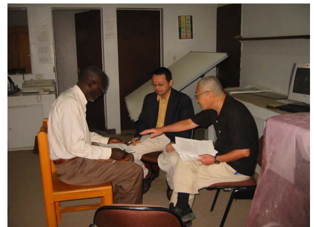
Intensive lecture continues 6days for mine pollution, EIA, etc.