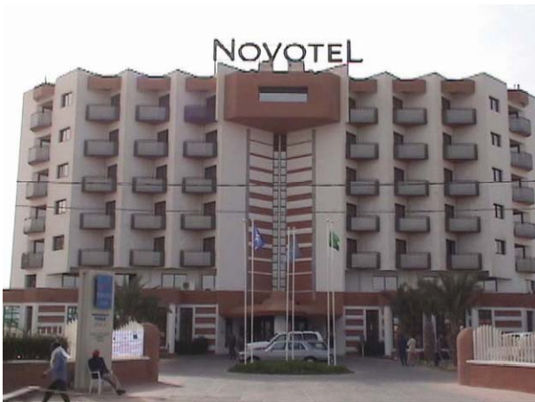
2. Seminar was held in NOVOTEL, Nouakchott.