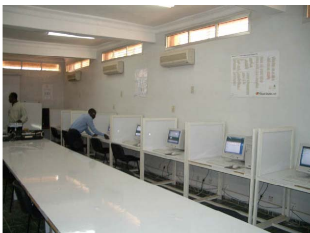
3. Inside of the Workshop Hall