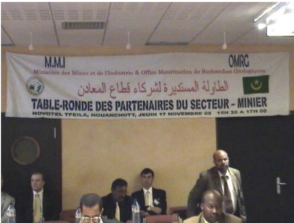
A banner for Roundtable Meeting for Mining Sector