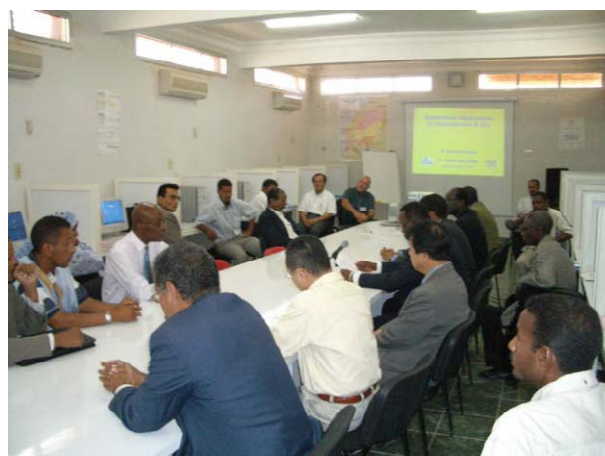
4. the Opening Ceremony with 17 trainees