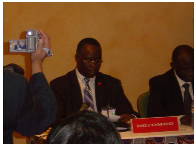
Opening words by the director of OMRG