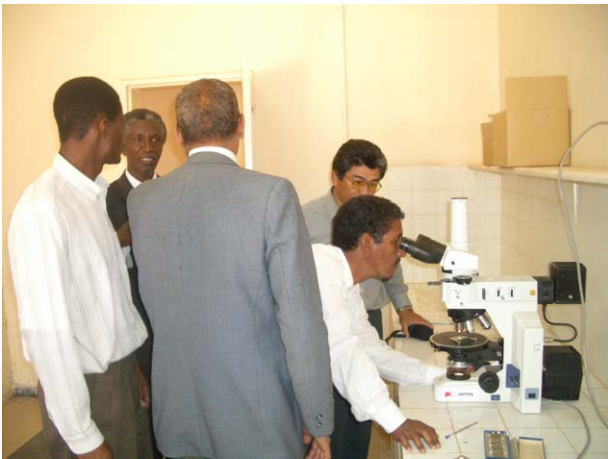
Explaining microscopic technologies