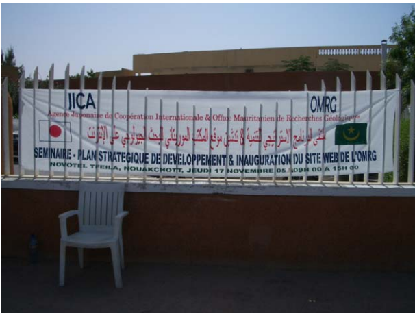
A banner for Draft Final Seminar