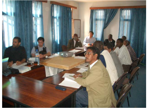
13 participants from OMRG