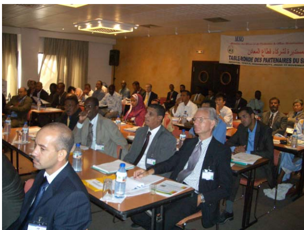
Total participants are 78, from the government, private companies and universities