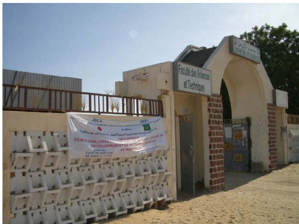
1. A main entrance of the Nouakchott University