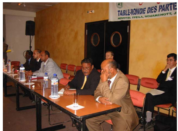
Observers listening to the meeting