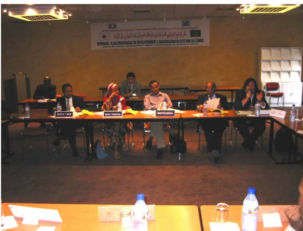
Serious discussion among participants