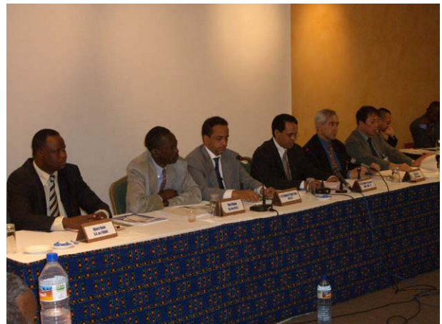
3. Seminar Opening Ceremony