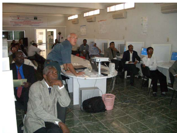
6. Trainees are listening eagerly to the lecture by a JICA expert.