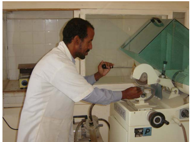
Practical training for sample processing