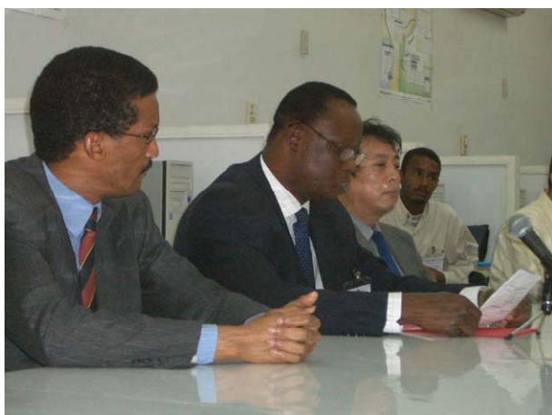
5. Opening words by a director of OMRG