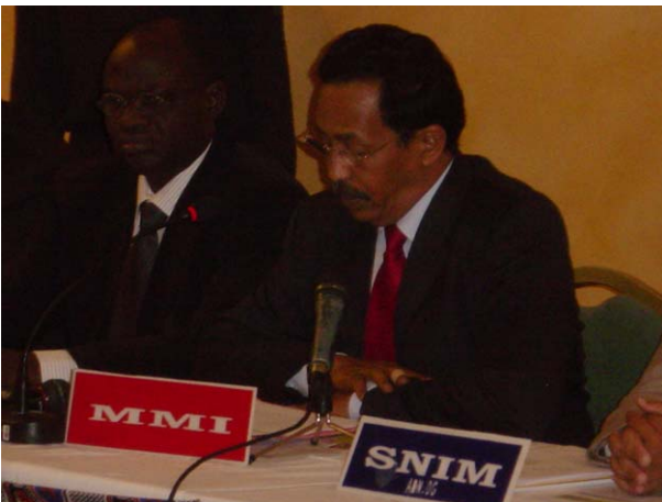
Opening address by the minister of MMI