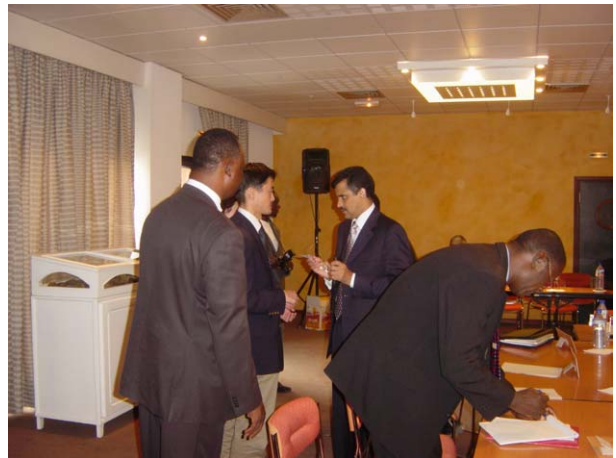
Exchanging name cards of participants