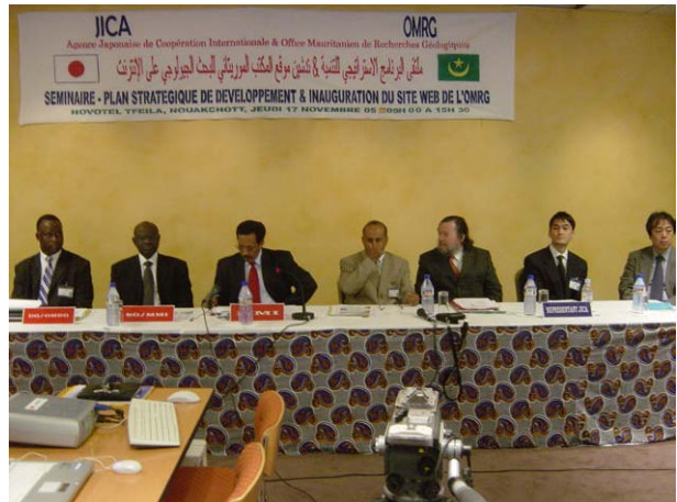
Panelists for the Draft Final Seminar, from left: OMRG, secretary and minister of MMI, SNIM, World Bank, JICA and a team leader