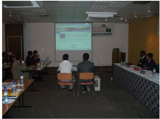
Introduction of the contents to main guests including the ministers of MMI