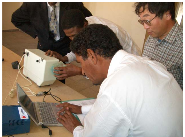
Practical training for POSAM, using mineral samples