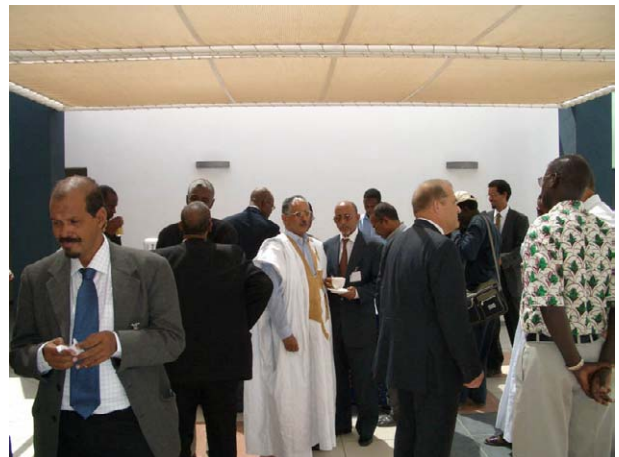
5. a coffee break