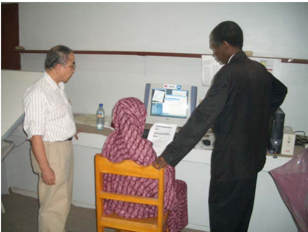
Practical training for ER Mapper