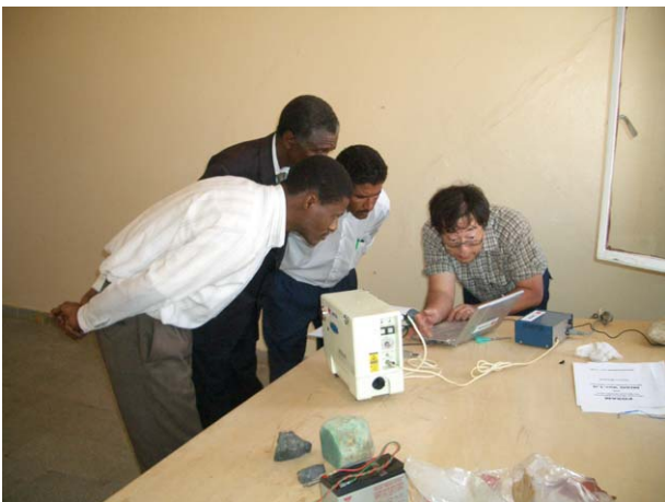
Explaining how to operate POSAM