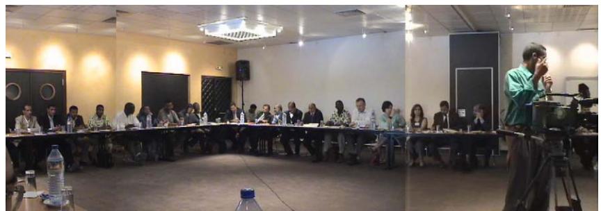
6. Seminar participants were about 70.