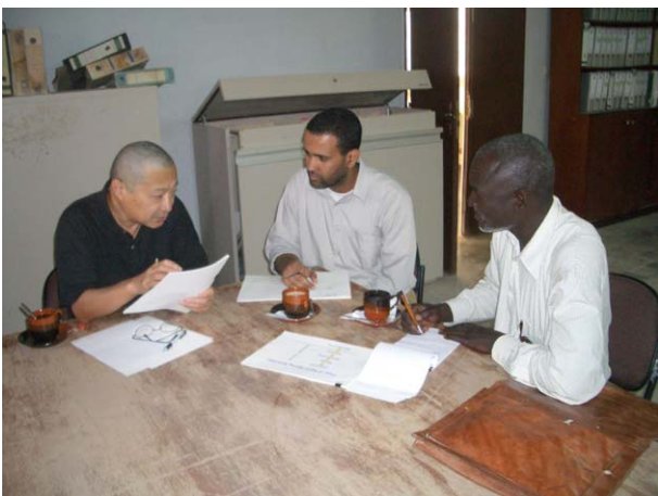
A JICA expert explaining environment to a counterpart.