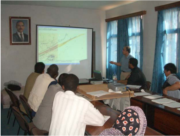
Explaining remote sensing