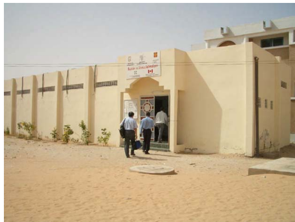
2. The Workshop Hall Information Laboratory of the university