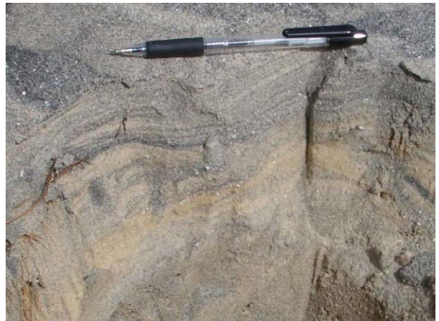
4. Layered heavy mineral sand (black)