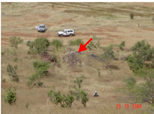
View of a trench from the eastern side of the Guidimaka deposit. The red arrow shows chrome ore.