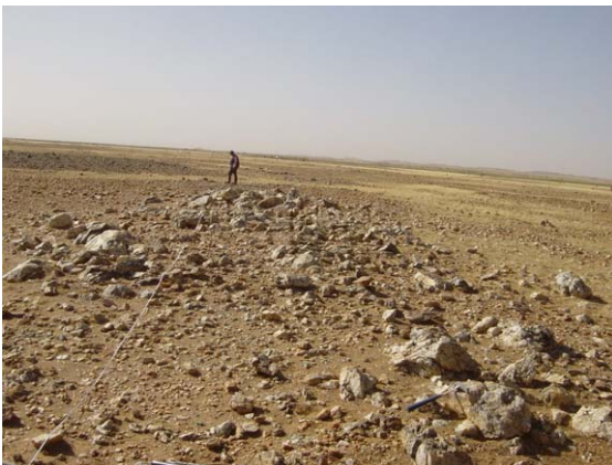
One of the exposed quartz veins. This vein is 10m wide and 60m long, with a N-S strike. Rock outcrops of the Kadiar