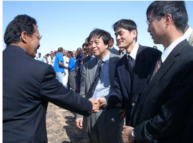
Ceremony participants welcoming the minister of MMI.