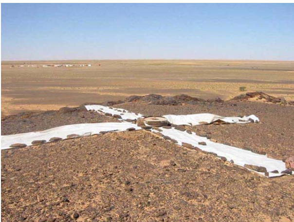
5. A survey benchmark.. This is the base point for trench boring aerial photo surveys, and so on. The surrounding geology is BIF. The camp site can be seen in the distance in the upper left.