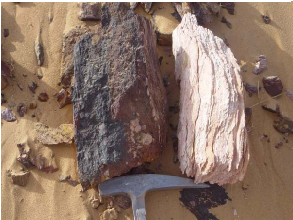
9. BIF (Left) and White Schist (Right) from the trench. BIF includes fine grained limonite and quartz.