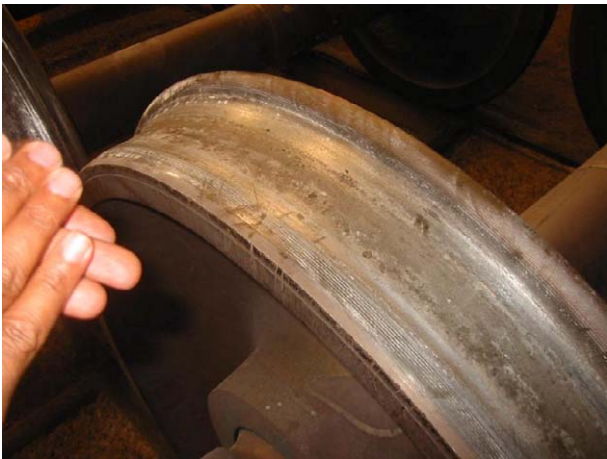
3. Sand of desert affects on various parts of equipment