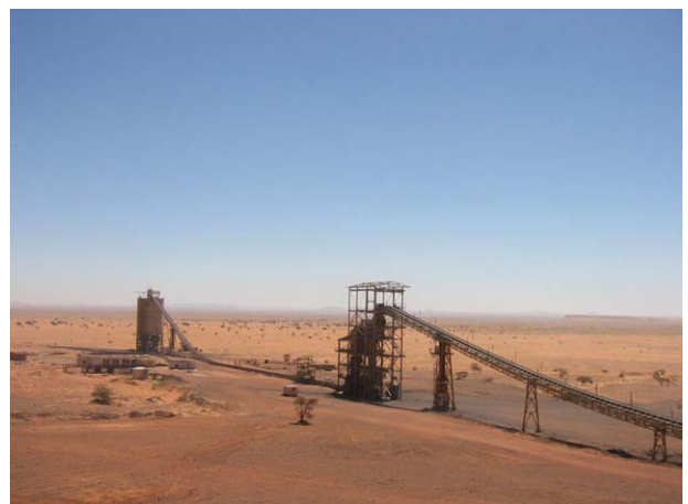
6. Secondary crusher (front) and loading hopper (behind)