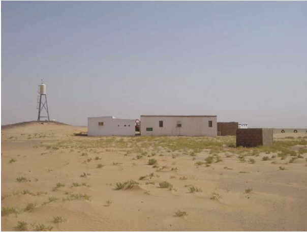
1. Tasiast Mauritania camp built on the western side of the gold deposit (which alternates with BIF). This is a view of the office and water tower.