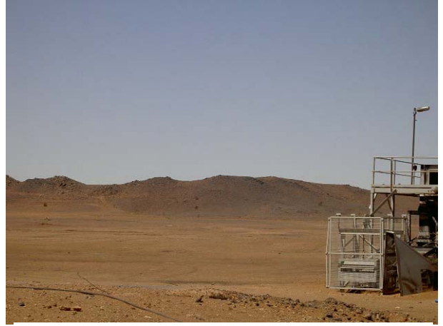
2. Piled tailings of debris