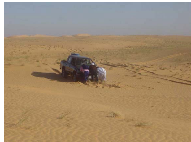
6. The view of dune on the way to the site