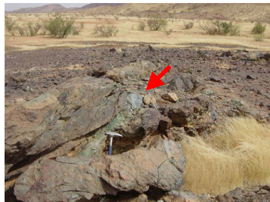
The main malachite vein (arrow) is 20cm wide, with a strike of \text{N}70^\circ\text{E} and a slope of 30^\circ\text{W} .