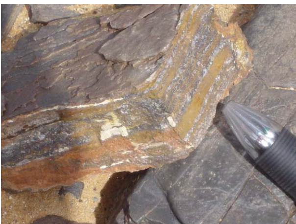
11. Quartz from the trench. The width of silicified zone is 0.3–1cm. Limonite shows brown–yellowish color. This type of ore includes Au with a grade of 0.5–1g/t.