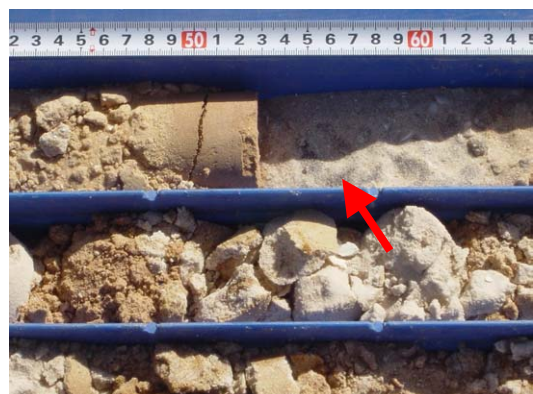
Area of concentrated titanium ore.