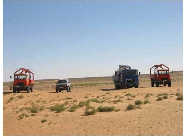
2. Water truck.. Water is brought in from a well 60km away.