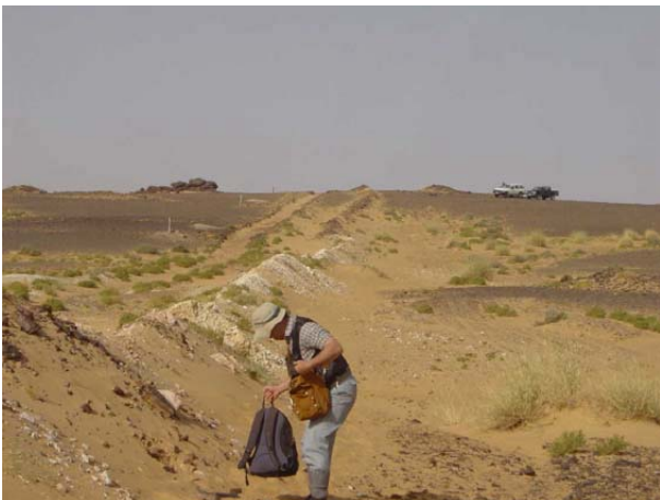
3. Study of the Waste in the trench. The data on waste is important in areas with few outcrops