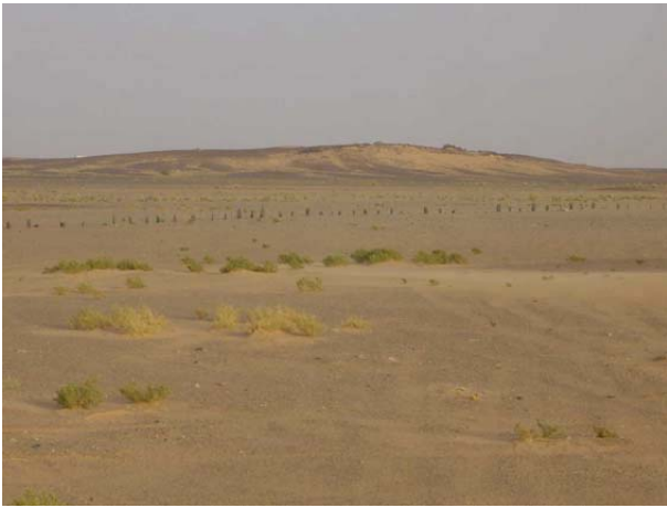
1. View of BIF from the West