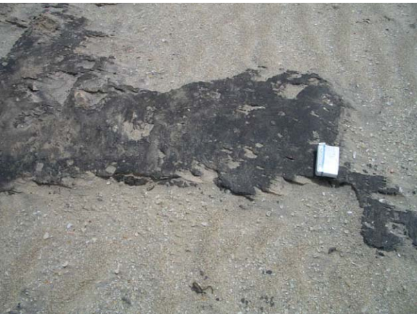
3. Heavy mineral sand (black) on the surface