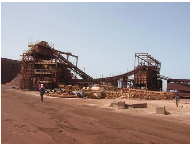
5. Big crushing Plants