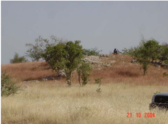
Looking at a quartzite outcrop from the eastern side of the Diaguli prospect N70^{\circ}E and a slope of 30^{\circ}W .