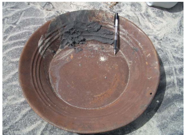
6. Concentrate of heavy mineral sand by panning