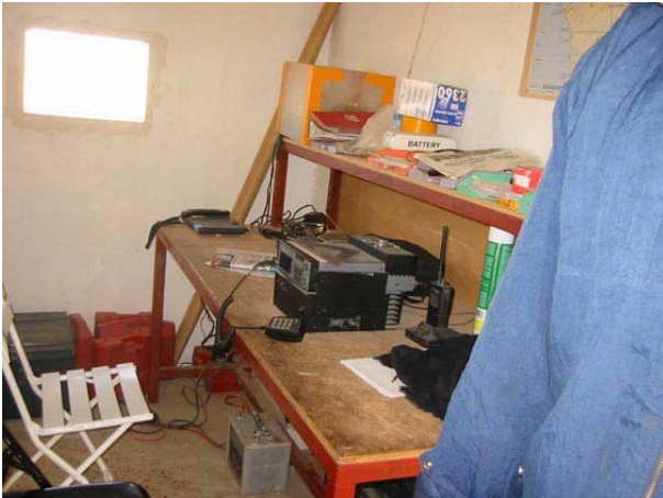
3. Communication with Nouakchott is by wireless radio and INMARSAT.