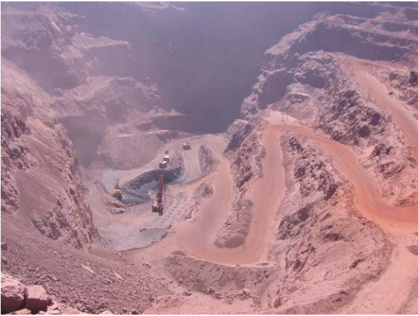
1. Open pit of TO14 mine, blue hematite is visible at the bottom black zone