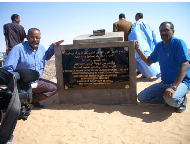
A monument for opening the mine