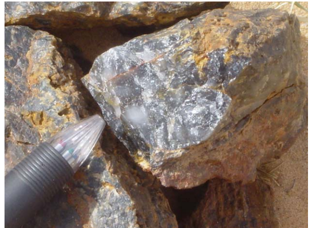
10. Quartz from the trench. BIF looks like quartz vein due to an intense silicification.. Microcrystalline quartz shows milky quartz – black quartz. It sometime includes Au with grade of 1g/t.