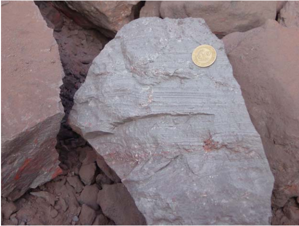
7. TO14 Deposit in Tazazit. The high-grade part called "Blue hematite". Specular ore has the grade of 67 ~ 68% of Fe and clearly shows bandit structure with microcrystalline hematite and quartz.