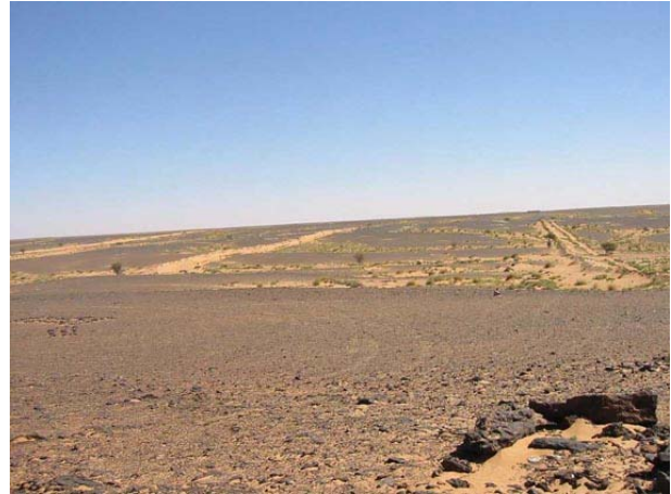
4. View of trenches dug in the deposit zone