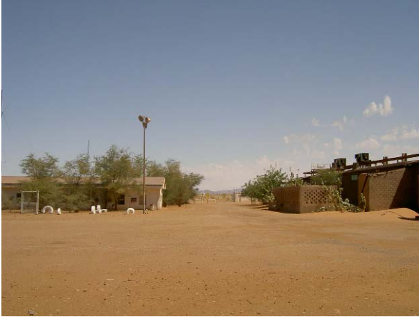
1. On-site mine management office