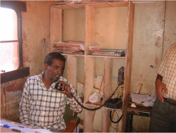
3. Operator in the radio room, indicating to truck driver and power shovel operator