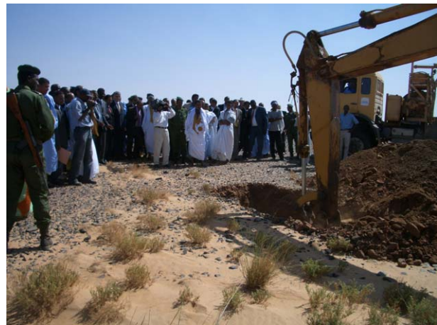
Earth breaking ceremony by a machine