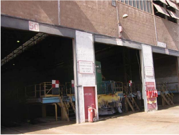
1. Workshop for locomotion