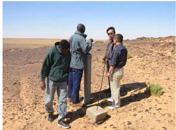
6. Traces of a site where vertical boring was conducted.