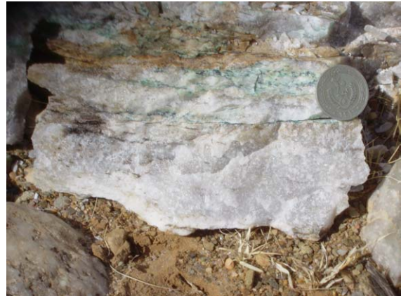
Copper dissemination in a quartz vein