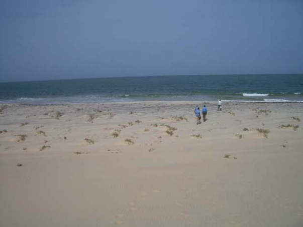
1. TANZIT Area (65 km to NNW of Nouakchott)