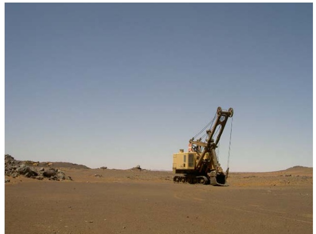
4. Abandoned heavy equipment