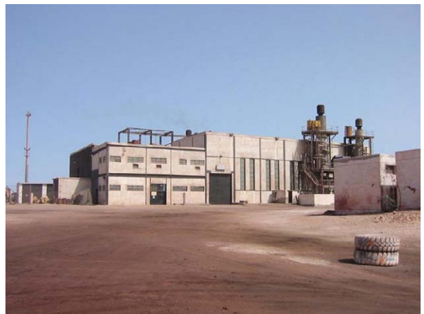
6. Nouadhibou Power Plant