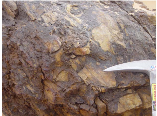
8. Tasiast Piment. BIF shows breccia Structure