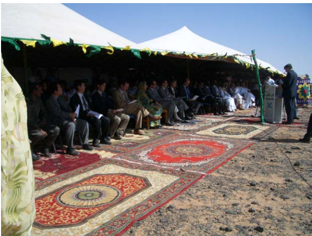
Mine Opening Ceremony.