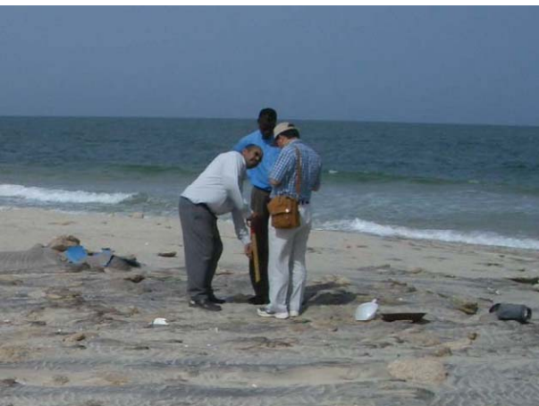
5. Sampling near the surface