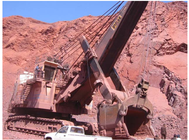
2. TO14's huge 55m 3 capacity power shovel