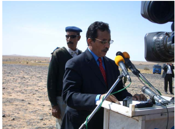
Speech by the minister of MMI