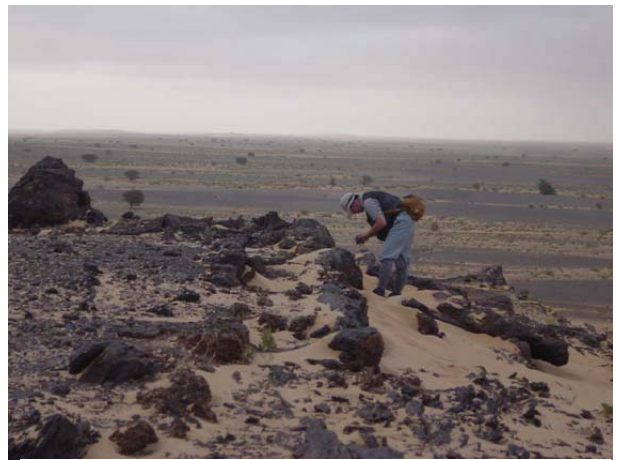
2. Detailed Geological survey on the BIF outcrop.