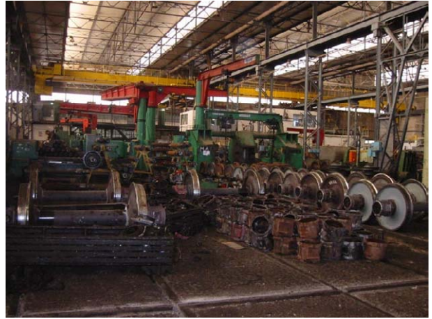
2. Workshop for mine cars