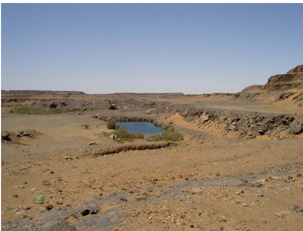
3. Old open pit (the pond is the bottom of the pit.)