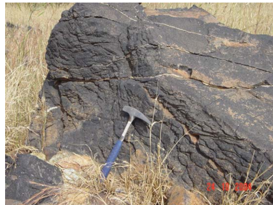
Massive (block?) chrome ore.