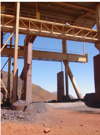
5. Head of coarse ore bin