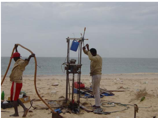
Taking heavy sand samples in the Tanit district.