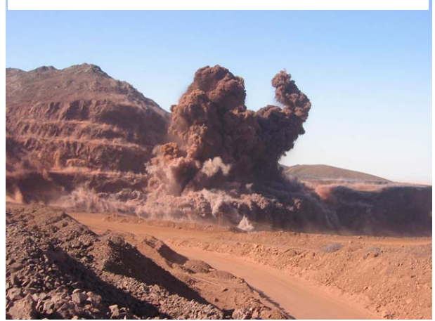
4. The moment of a dynamite blast at TO14. A thunderous noise is accompanied by a tremendous dust cloud.