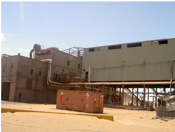
5. Old dressing facility