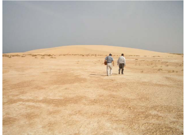
2. Dune near the shore. The dune also includes heavy mineral sand.