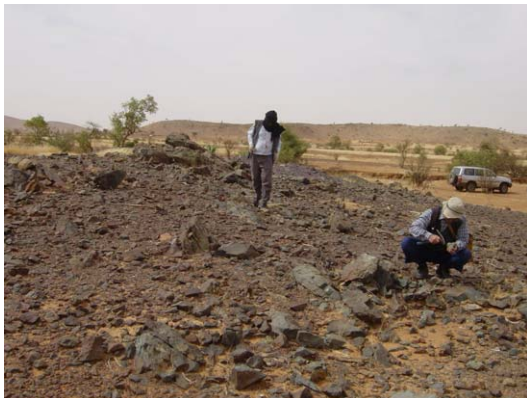
The prospect consists of a malachite vein having limonitized basalt as the parent rock..