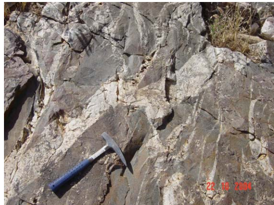
Quartz networks seen in a quartz vein.