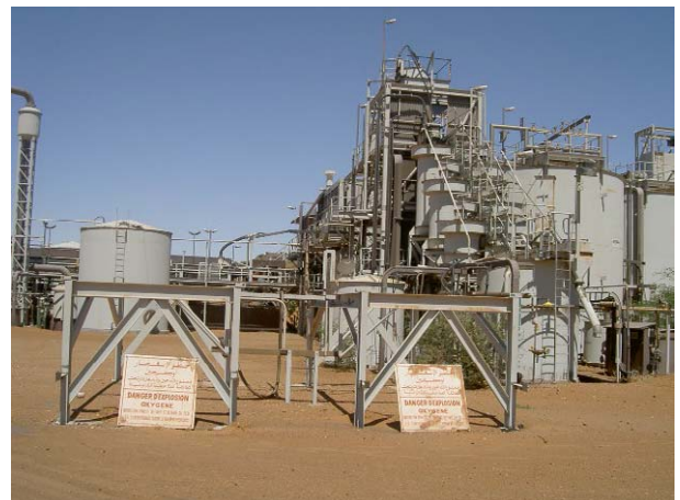
6. Gold extraction facility