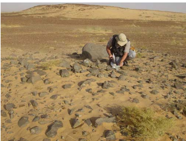
5. Sampling of meta-amphibolite for dating