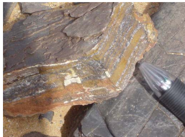
4. Gold Ore. It seems that gold is included in the part of abundant quartz