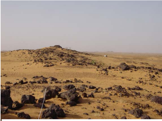
Rock outcrops of the Kadiar deposit. They are composed of silicified \text{FeO}_2 ore bodies