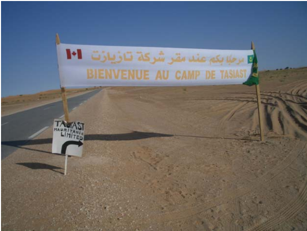
A Guide to the Tasiast Gold Mine, installed at the branch of Route No.1. The Mine is located at about 300km to the north of Nouakchott..