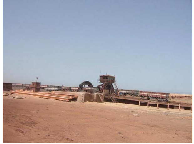
4. Tippler (Unloading equipment)