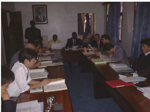
OMRG と JICA の打合せ(2003.11.18)