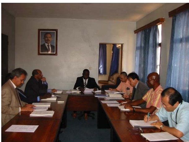
開会の挨拶をする OMRG のジメーラ所長。