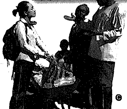
A: Water and Sanitation Program in Zambia B: Project for Participatory Village Development in Isolated Areas C: Sefula Rural Development Programme