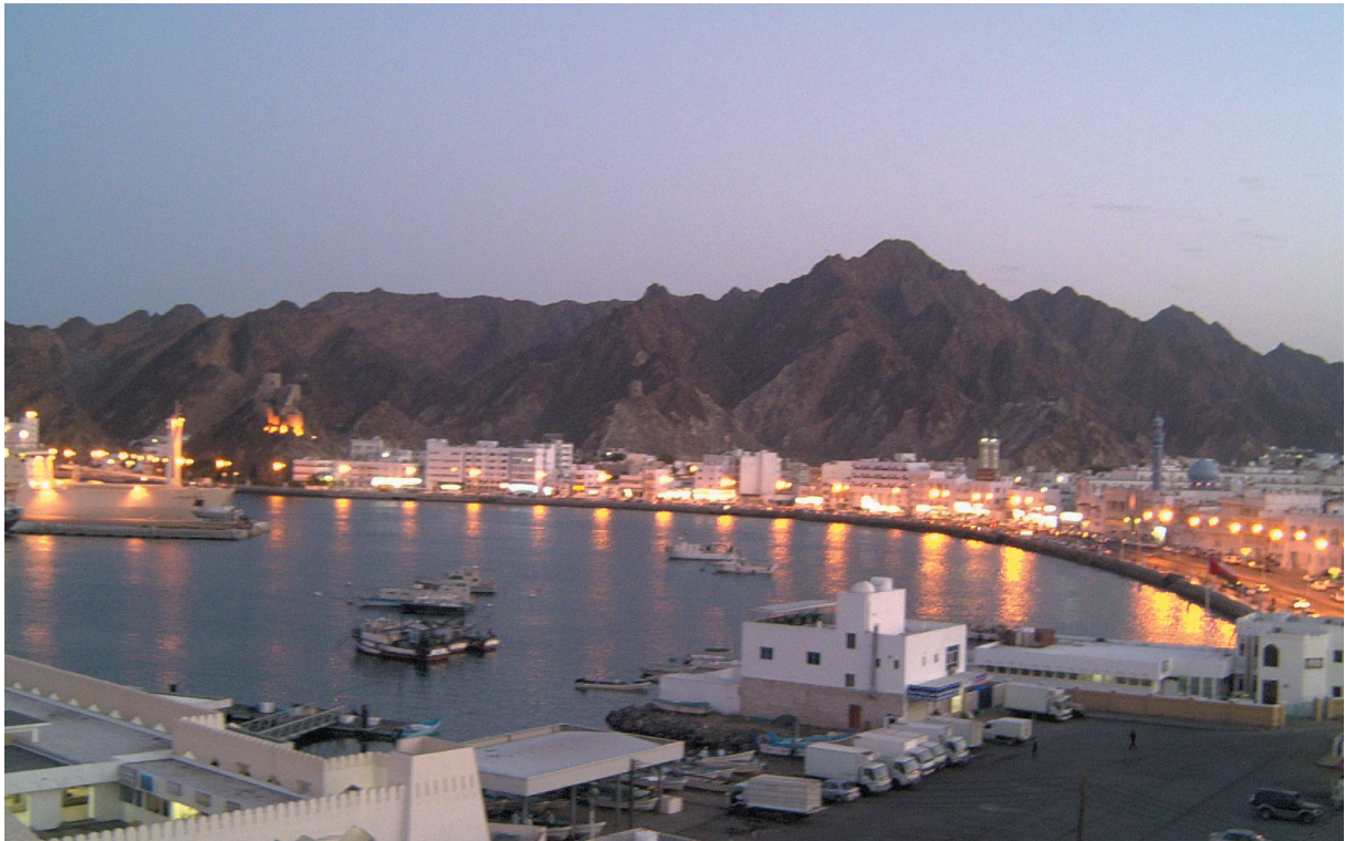
Sultan Qaboos Port and Waterfront