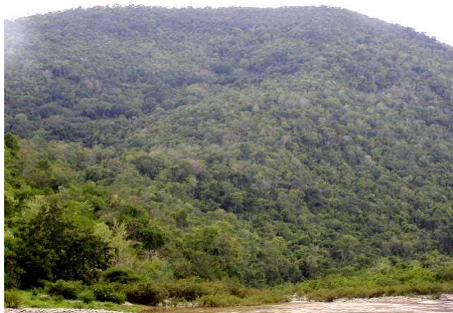
JS6 – Lower Reservoir

The ridge of the left bank of the planned dam site is quite thin.