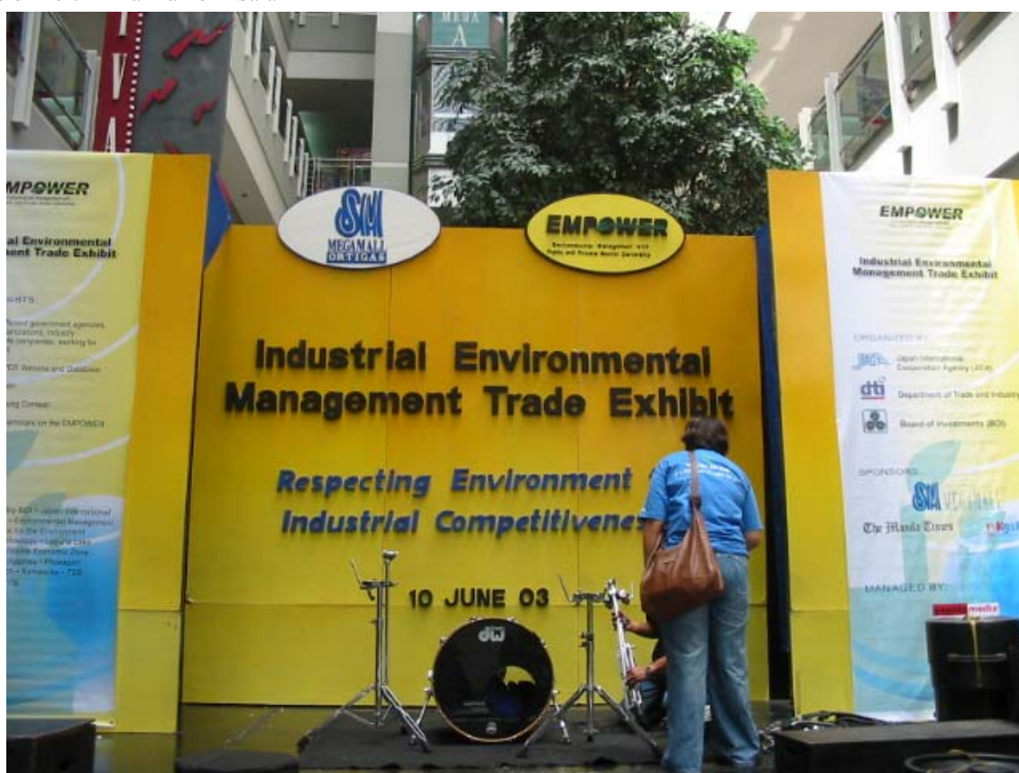
The Exhibit in SM Megamall on June 10.