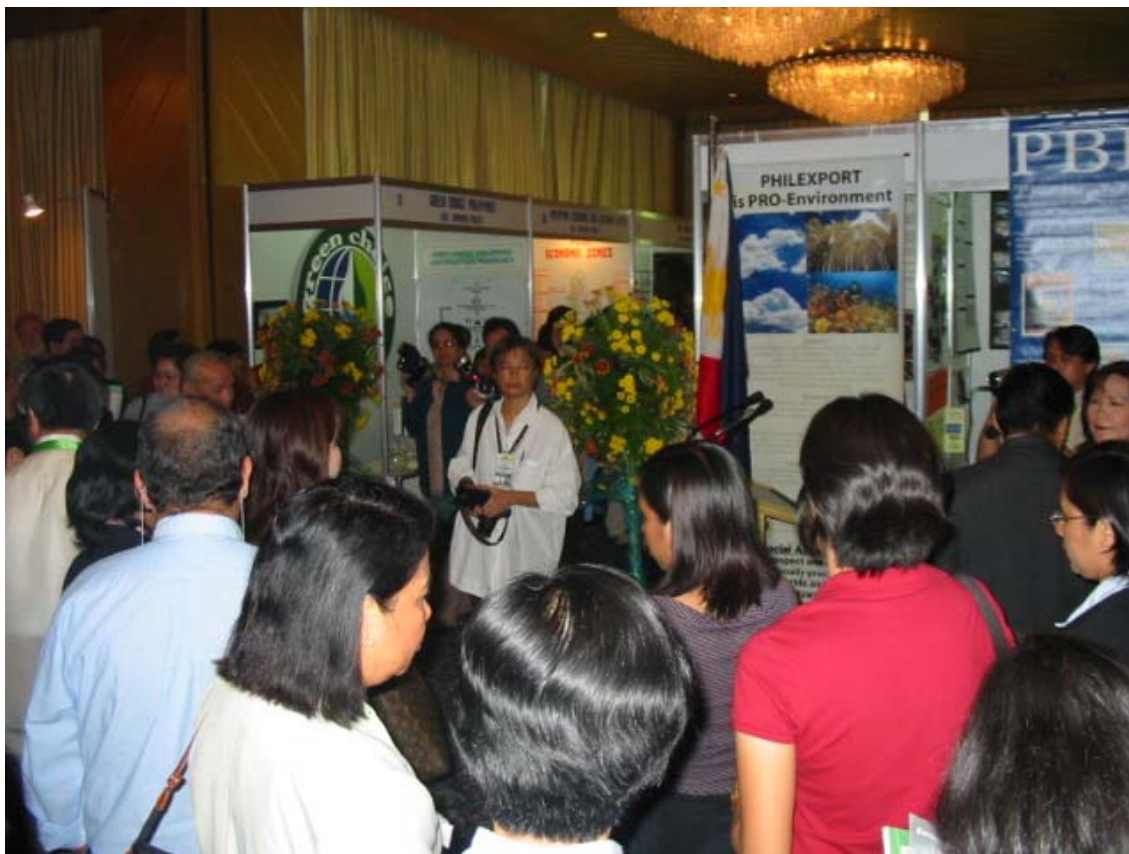
The exhibit in Manila Peninsula