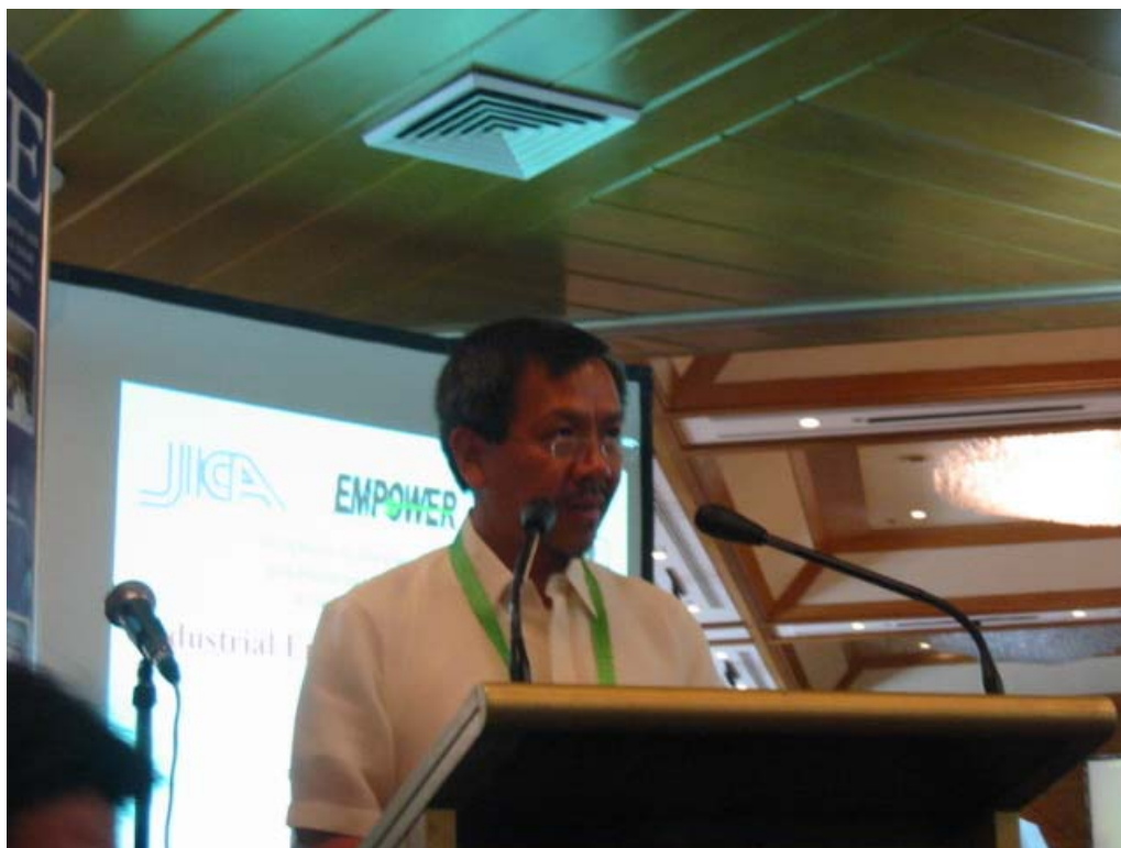
Welcome adress by Unsec.Domingo of DTI