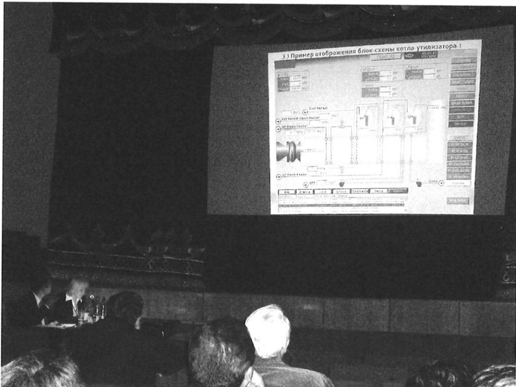
Technical Transfer Seminar