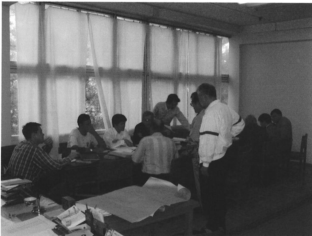
Discussion between Counterpart (DC "TASHTPP) and JICA Study Team