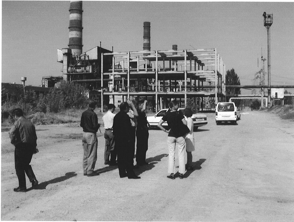
Candidate Site of New Combined Cycle Power Plant