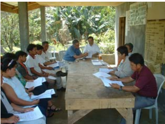
Confirmation of Components of Pilot Project between PO and JICA Study Team (February,2003: Balligui, Quirino Province)