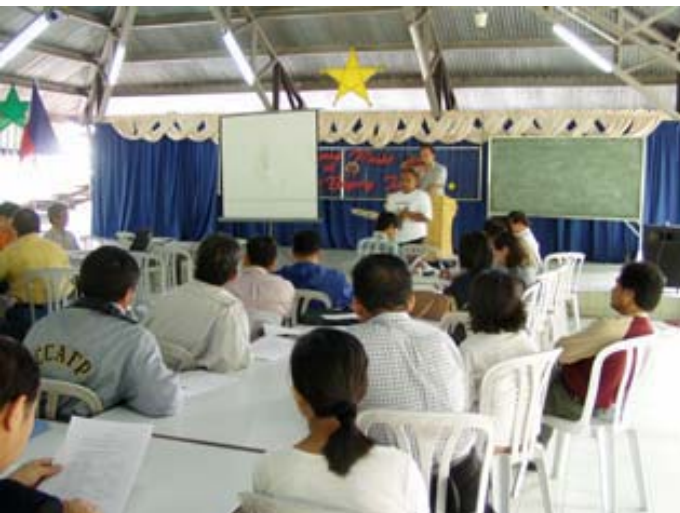
Bayombong, Nueva Vizcaya Province