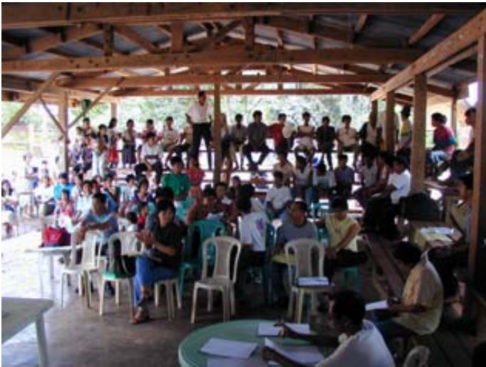
PO General Assembly Meeting (August, 2002: Macate, Quirino Province)