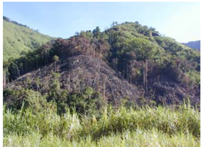
Swidden land on steep slope (April, 2001: Casecnan Nueva Vizcaya Province)