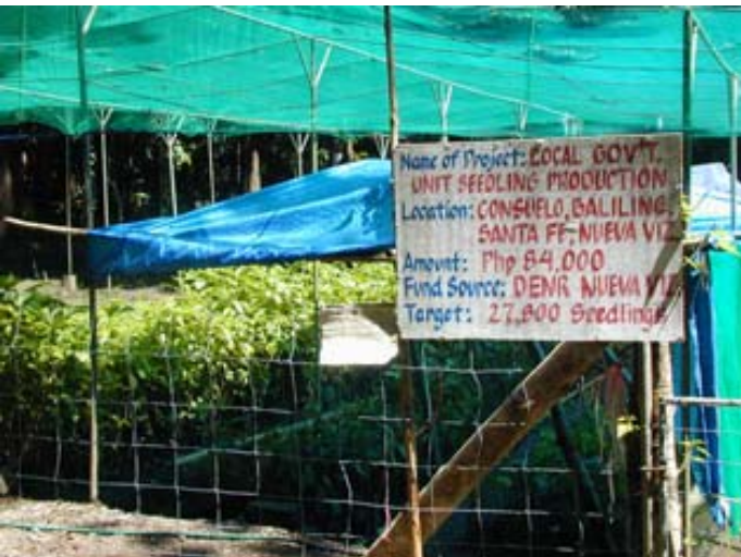
Nursery funded by Department of Natural Resources (DENR) (2001: Santa Fe, Nueva Vizcaya)