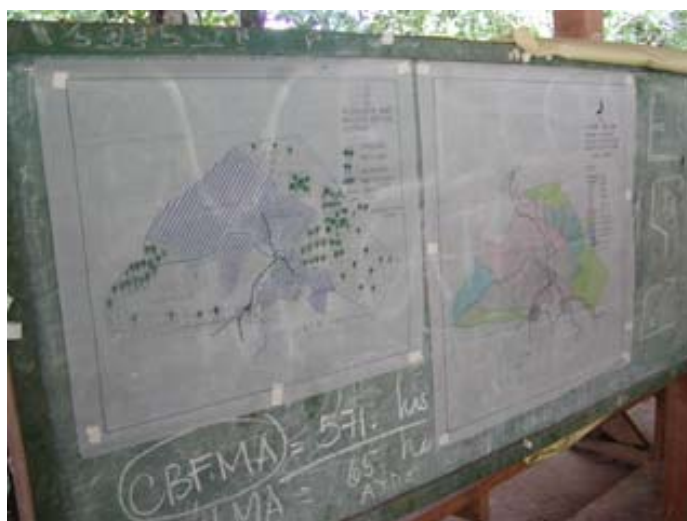
Community Resource Map through Participatory Approach (July, 2003: Macate, Quirino Province)