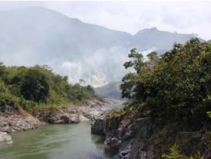
Forest Fire Occurrence in the Study Area May, 2001: Casecnan, Nueva Vizcaya Province)