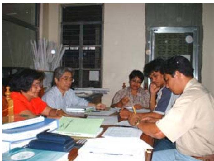
Weekly Meeting of JICA Study Team with Counterpart personnel (March,2002: Bayombong, Nueva Vizcaya Province)