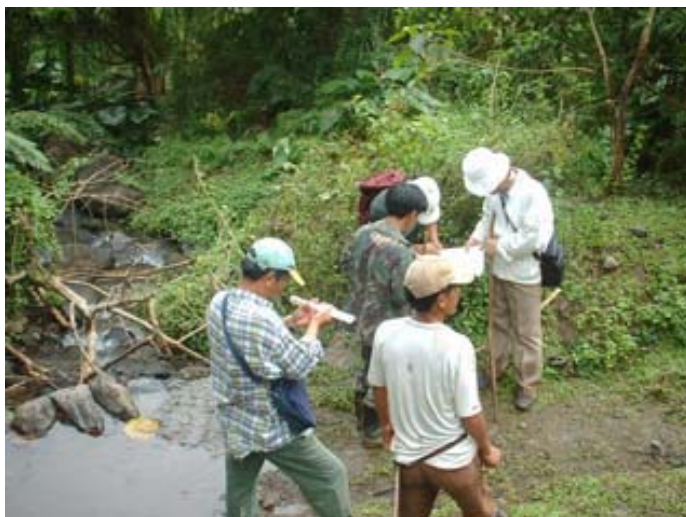
Field Survey for selection of Pilot Project Site (February, 2002: Balligui, Quirino Province)