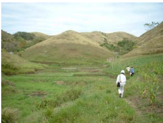
Field Survey for selection of Pilot Project Site (February, 2002: Nunhabatan, Ifugao Province)