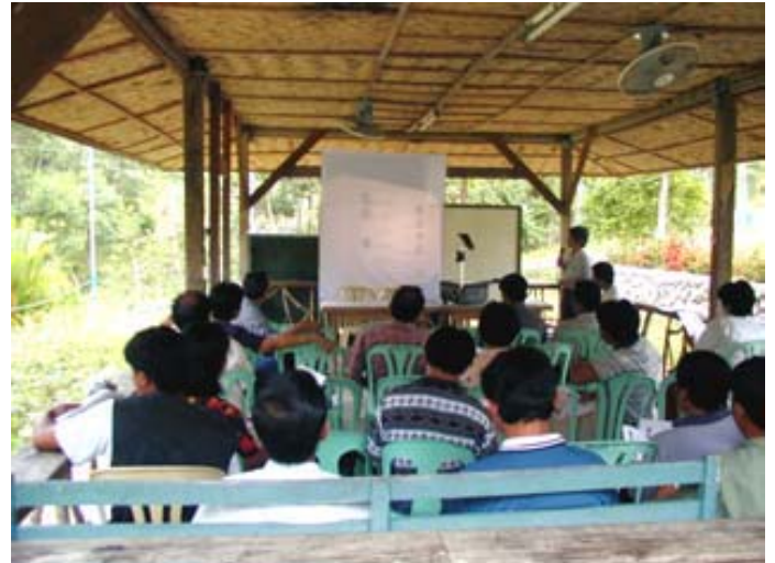
Orientation Meeting for Local Counterparts presented by JICA Study Team (April, 2001: Lamut, Ifugao Province)