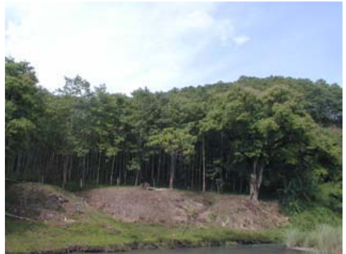
Socialized Industrial Forest Management Agreement (SIFMA) Area (May,2001: Diffun, Quirino Province)