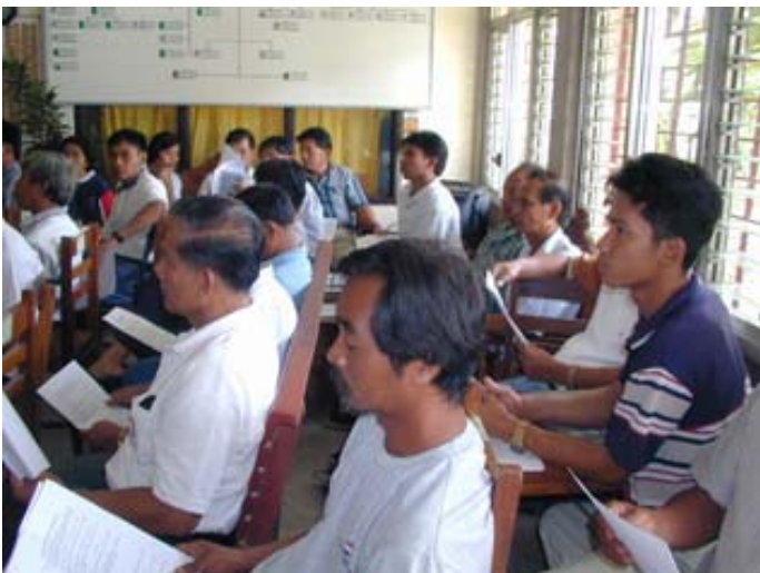
Presentation of Draft Master Plan for Stakeholders (October, 2001: Bayombong, Nueva Vizcaya Province)