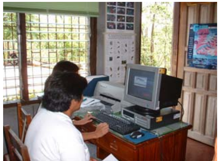
Computer training for DENR staff as a part of Institutional Strengthening by JICA Study Team (June,2002: Lamut, Ifugao Province)