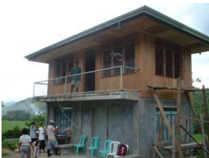
Multi-purpose Building constructed by PO (August, 2003: Banila, Nueva Vizcaya Province)