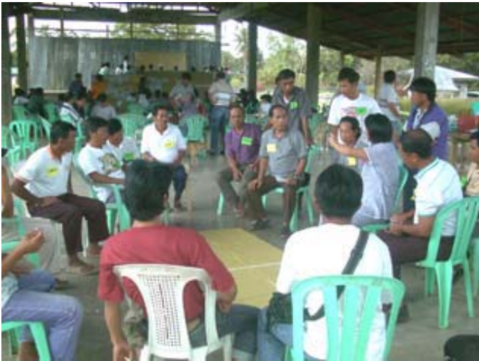
Workshop for Community Action Planning conducted by People's Organization (PO) (January, 2002: Ayangan Dapiz, Isabela Province)