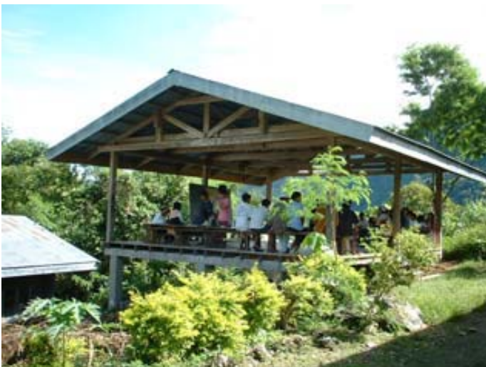
Capacity Building for PO on the Pilot Project (July,2002: Haliap, Quirino Province)