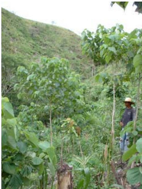
Gmelina tree planted during Pilot Project (August, 2003: Nunhabatan, Ifugao Province)