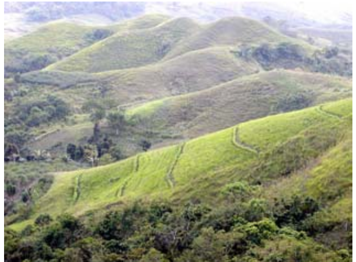
Establishment of demonstration farm (January,2003: Nunhabatan, Ifugao Province)