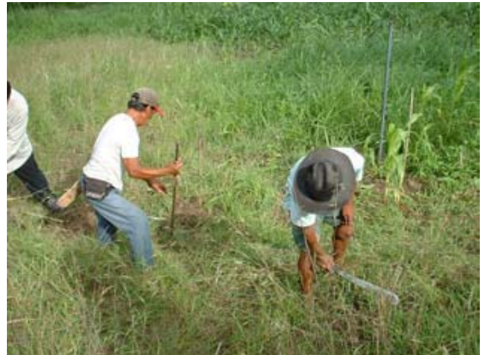
Land Preparation for plantation conducted by PO (August,2002: Nunhabatan, Ifugao Province)