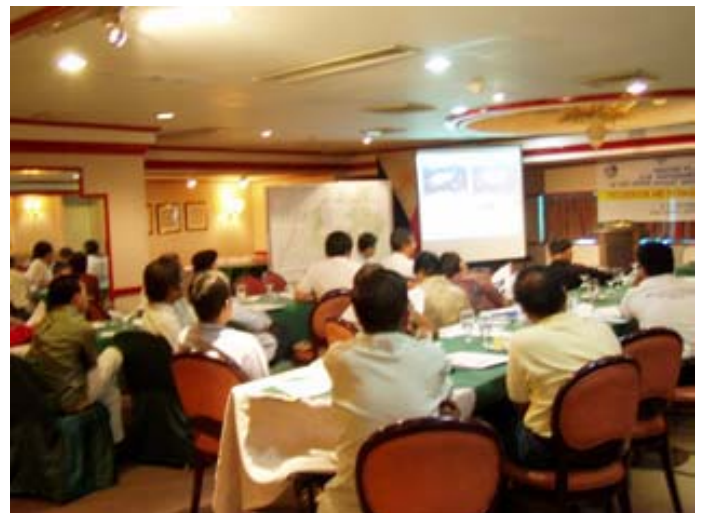
Quezon City, Metro Manila