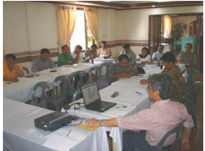
Consultation Meeting fro establishment of Watershed Management Council (May, 2003: Cabarroguis, Quirino Province)