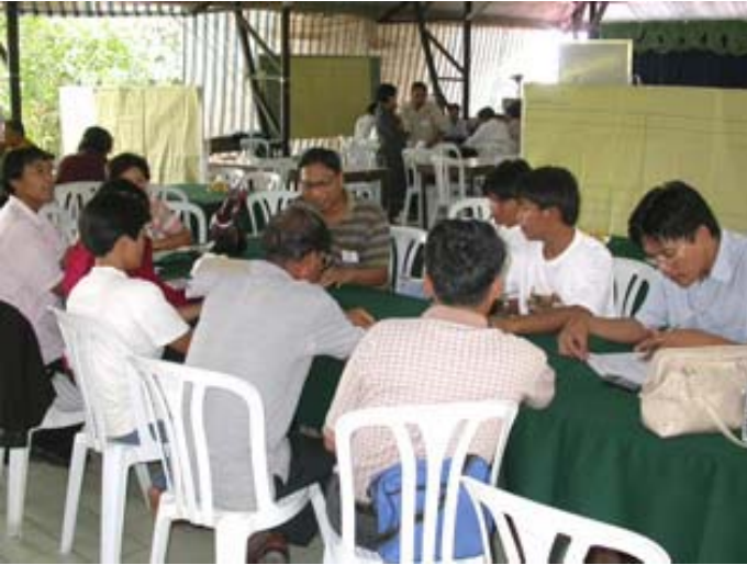
Workshop for Final Evaluation of Pilot Study Conducted by Stakeholders (August,2003:Bayombong, Nueva Vizcaya Province)