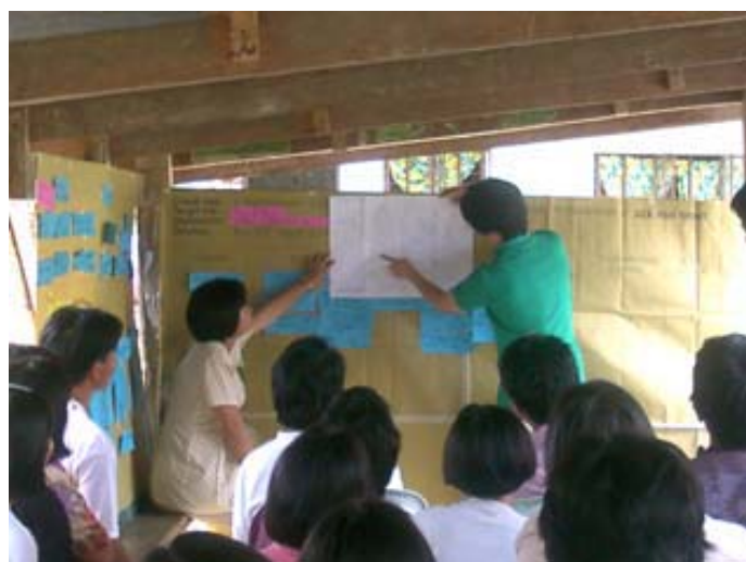
Technical advice from an expert of JICA Study Team on Community Action Planning (January, 2002: Banila, Nueva Vizcaya Province)