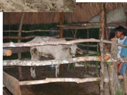
Direct sowing of pasture & procurement of cattle for breeding and fattening (June, 2003: Nunhabatan, Ifugao Province)