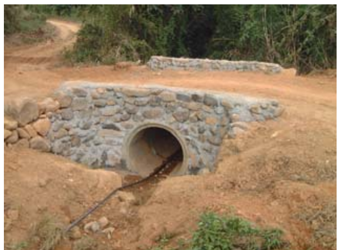
Road Rehabilitation assisted by JICA Study Team and Local Governmental Unit (LGU) (February,2003: Banila, Nueva Vizcaya Province)