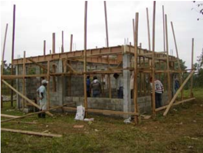
Under construction of Multi-purpose Building (January,2003: Ayangan-Dapiz, Isabela Province)