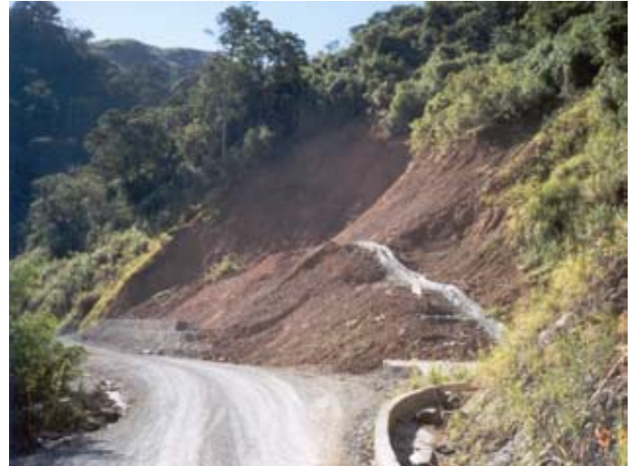
Landslip along the main road (April, 2001: Nueva Ecija Province, nearby Study Area)