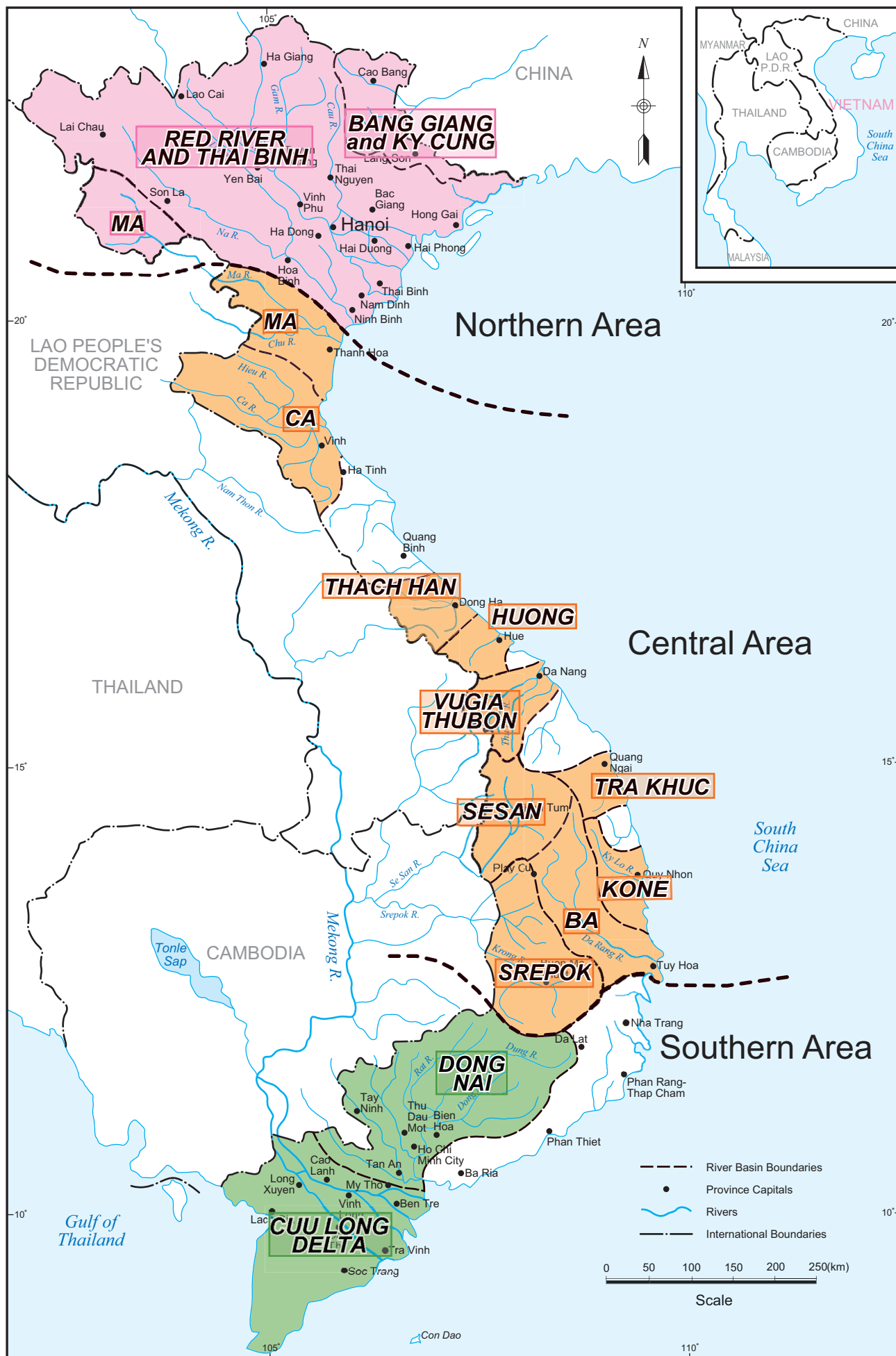
Location Map of Study Area