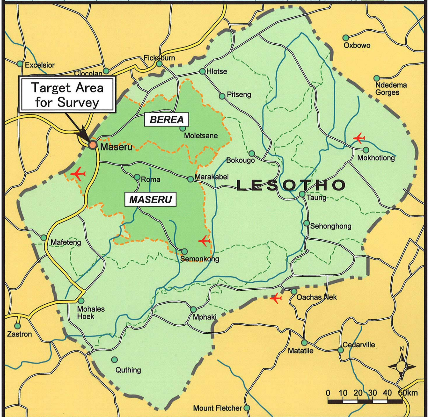
Location Map of the Target Area for Survey