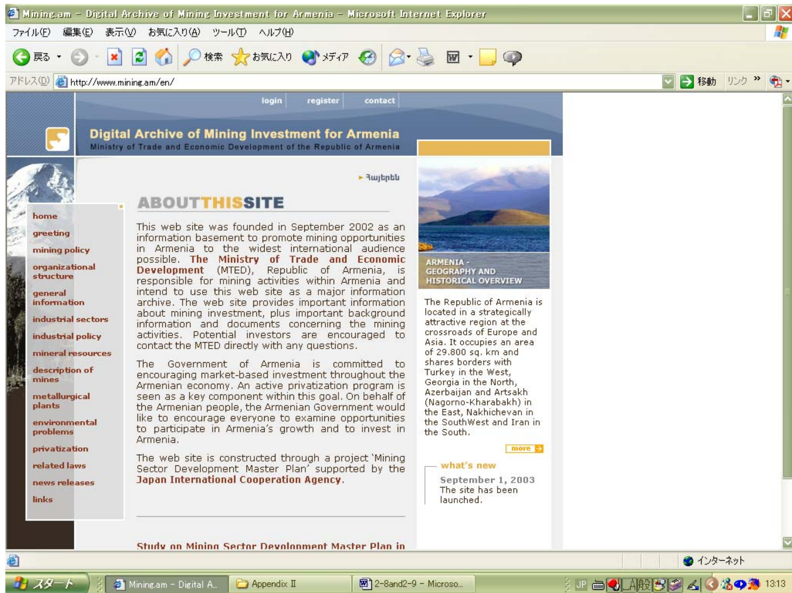
Opening Page of the Website