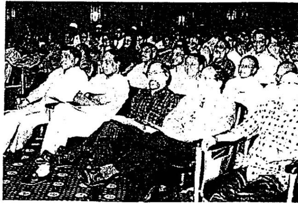
Fig. 10: A view of National Seminar held on 3-4 June 2002 at LGED Conference Room, LGED Bhovan, Dhaka

Apart from this around 300 top and mid-level executives from different GOs and NGOs, development partner organizations, donor agencies, Universities, academics and research organization academy participated in the inaugural session of the second seminar on 3-4 the June 2002 of them 200 participated in the working sessions.