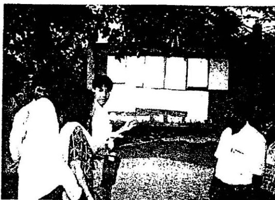
Fig. 6: A view of the Notice Board at Shahadebpur Union

For information dissemination 70 notice boards had already been provided in the project unions from the project which were installed at the strategic corners of the villages. All important messages related to rural development which are discussed and recorded at the UCCM are summarized in the form of bulletin and disseminated among the people in the rural area through these notice boards by the PRDP field staff.