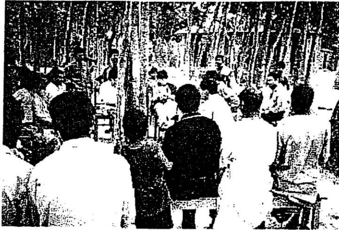
Fig. 3: Village committee meeting