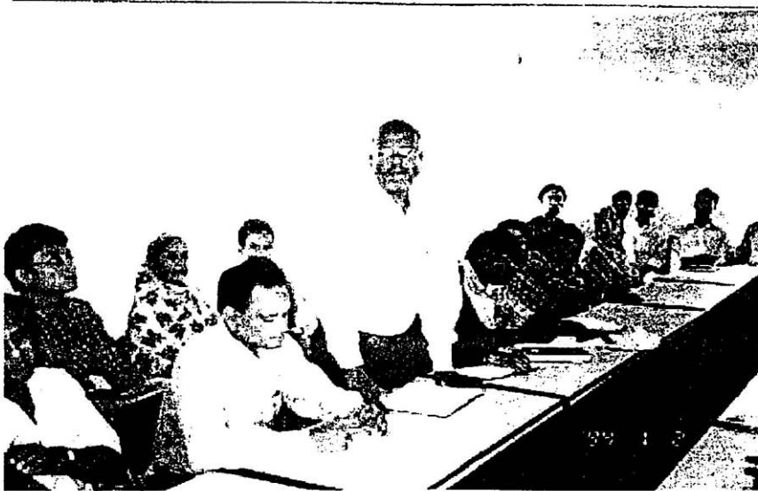
Fig. 2: A view of the Participants in the Union Co-ordination Committee (UCC) of Nerandia UCCM.

6.06 Union Coordination Committee: UCC is a forum of the representatives from National Building Departments (NBD), all UP members and VC representatives. The committee at present comprises above 50 members, which are likely to be increased to around 70 in future. It is like the general assembly of the union. UP chairman is the chairperson of the committee and UDO who is posted from the project acts as the member secretary.