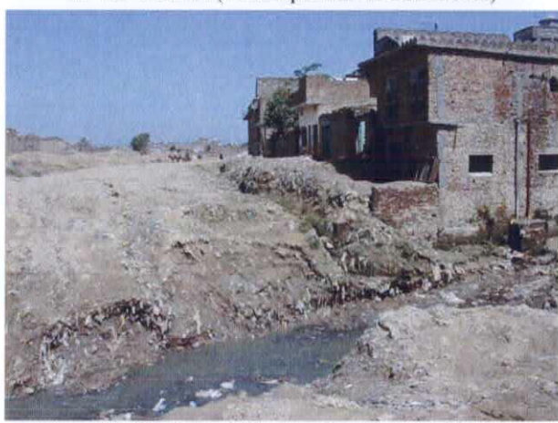
12 Workshop Tributary (Confluence) (2)