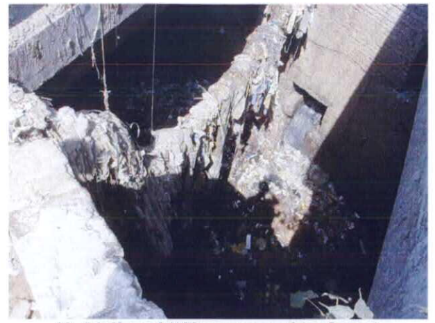
09 L3 Channel (100m upstream of Confluence)