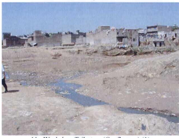
11 Workshop Tributary (Confluence) (1)