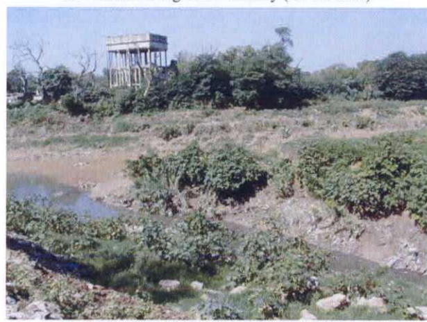
04 Arya Nullah (Confluence) (1)