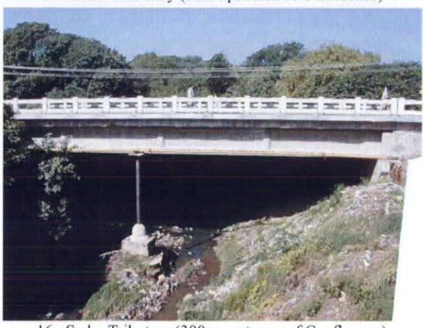
16 Sadar Tributary (300m upstream of Confluence)