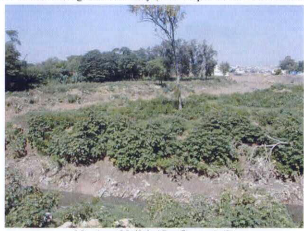
05 Arya Nullah (Confluence) (2)