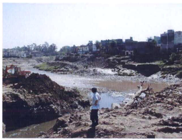
02 Dohk Chiraghdin Tributary (Confluence)