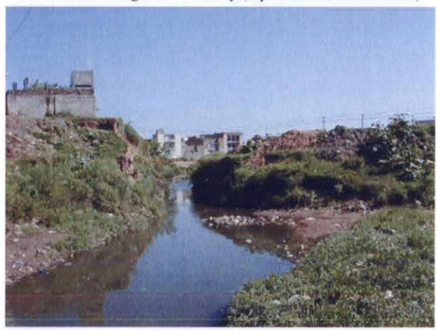
03 Dohk Chiraghdin Tributary (150m Upstream of Confluence)