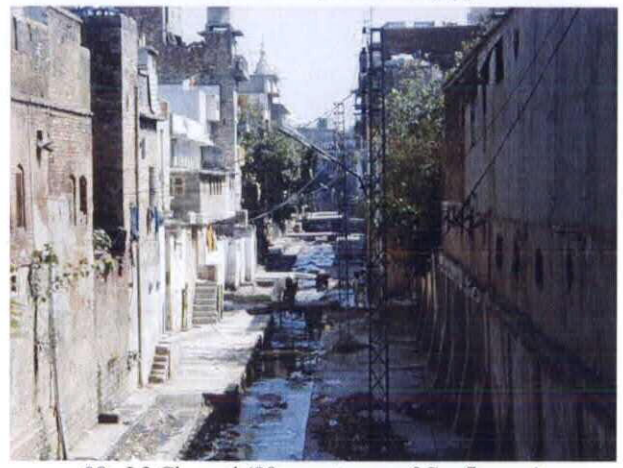
08 L3 Channel (80m upstream of Confluence)