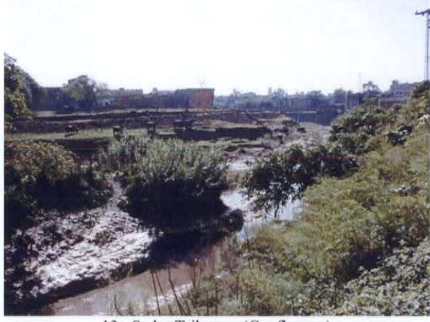
13 Sadar Tributary (Confluence)