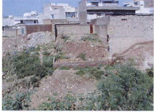
06 L3 Channel (Confluence) (1)