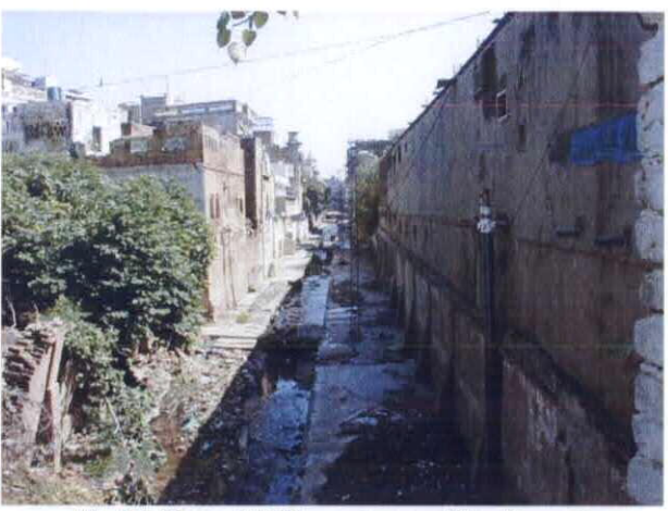
10 L3 Channel (120m upstream of Confluence)