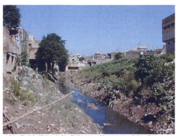
01 Dohk Chiraghdin Tributary (Upstream of Confluence)