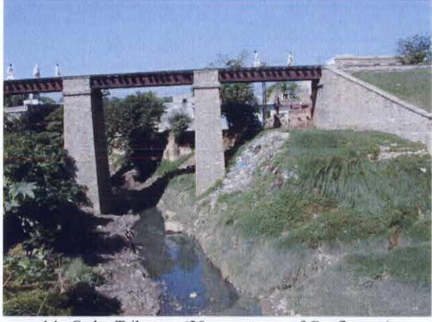
14 Sadar Tributary (20m upstream of Confluence)