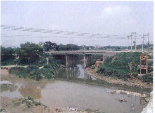
38 Upstream of Kattarian Bridge (2)