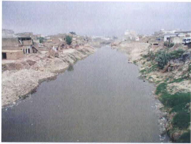
26 Upstream of Ratta Amral Bridge