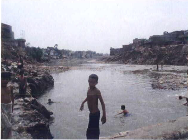
34 Downstream of Pir Wadhai Bridge