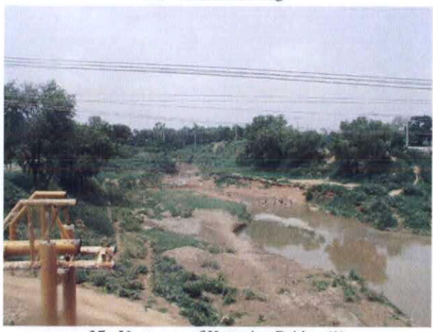
37 Upstream of Kattarian Bridge (1)