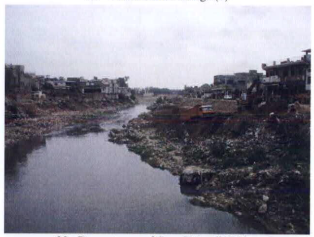
29 Downstream of Gawal Mandi Bridge