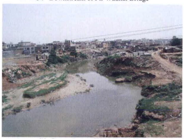
36 Downstream of Kattarian Bridge