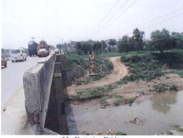
35 Kattarian Bridge