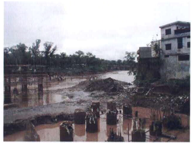
33 Flood Mark near Pir Wadhai Bridge (2)