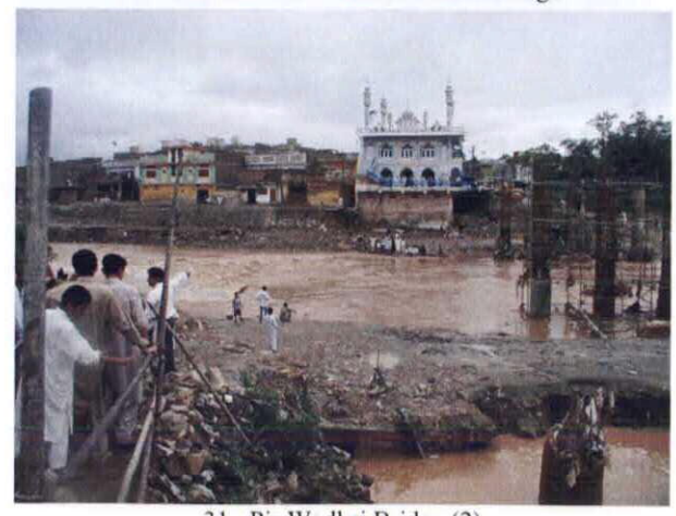
31 Pir Wadhai Bridge (2)