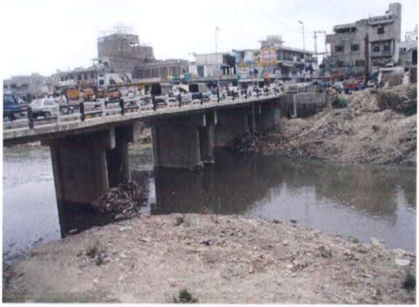
27 Gawal Mandi Bridge (1)