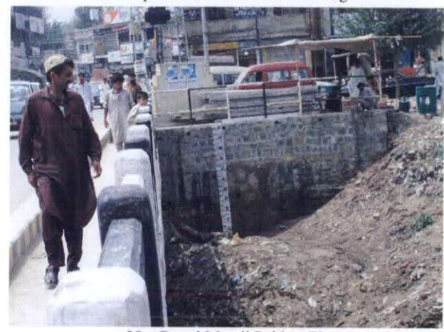
28 Gawal Mandi Bridge (2)