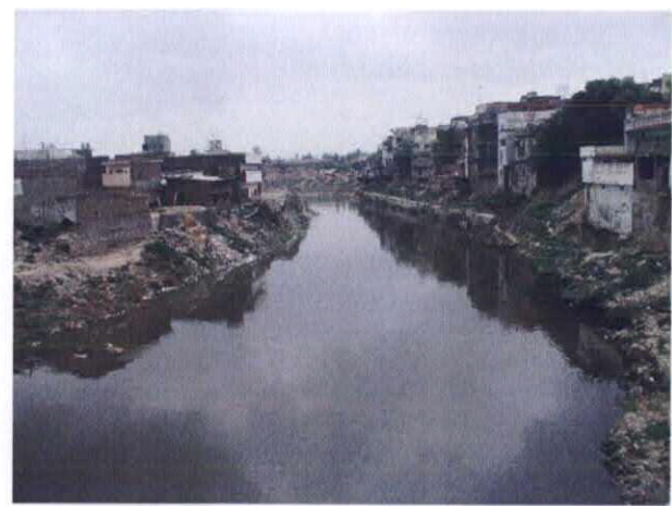
25 Downstream of Ratta Amral Bridge