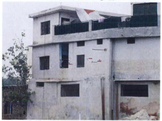
32 Flood Mark near Pir Wadhai Bridge (1)