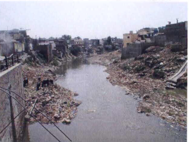
15 Downstream of Dohk Chiragh Din Bridge