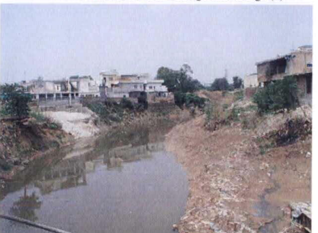
16 Upstream of Dohk Chiragh Din Bridge