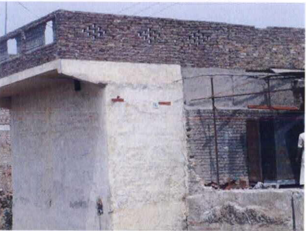
13 Flood Mark near Dohk Chiragh Din Bridge (1)