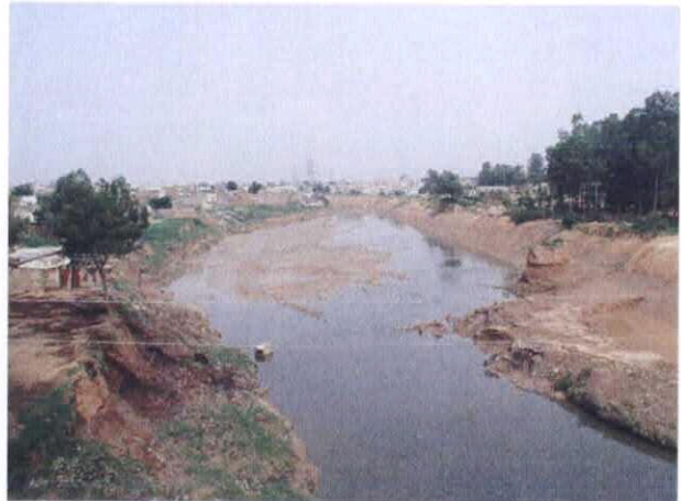
10 Upstream of Chaklala Bridge