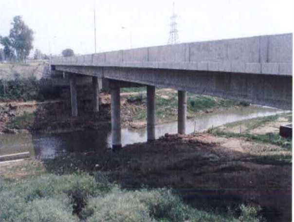
07 Chaklala Bridge (1)