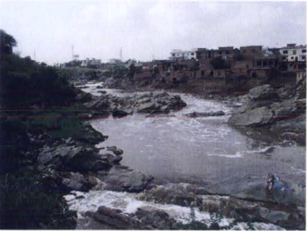
05 2km downstream of Chaklala Bridge (2)