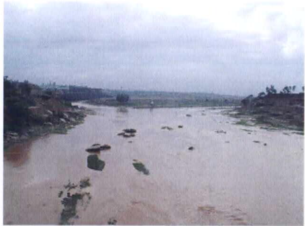
02 Confluence with Soan River (2)