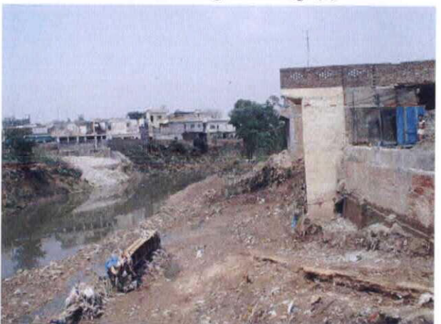
14 Flood Mark near Dohk Chiragh Din Bridge (2)