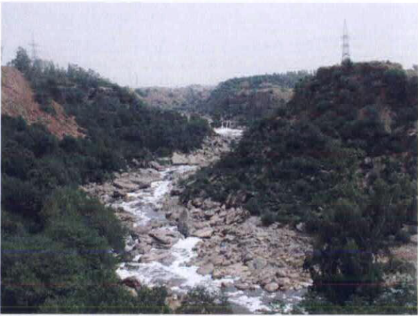
03 Cascade (Upstream of GT Bridge)