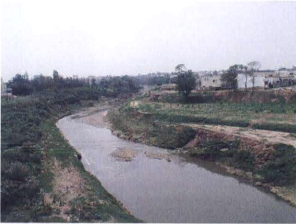
09 Downstream of Chaklala Bridge