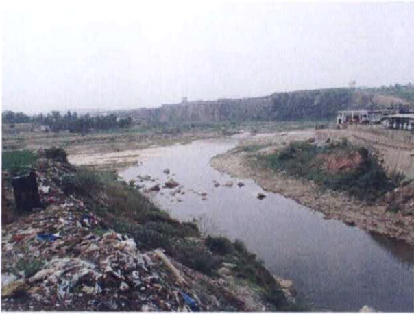
01 Confluence with Soan River (1)