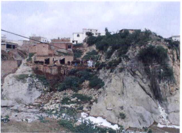
06 2km downstream of Chaklala Bridge (3)