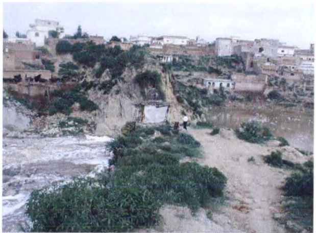
04 2km downstream of Chaklala Bridge (1)