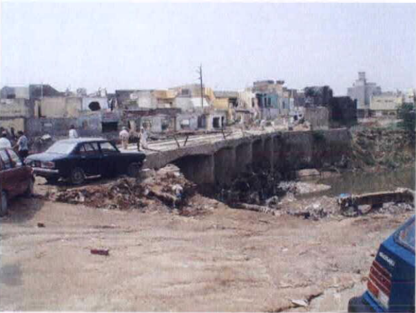
11 Dohk Chiragh Din Bridge (1)