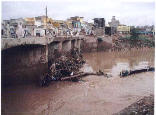
12 Dohk Chiragh Din Bridge (2)