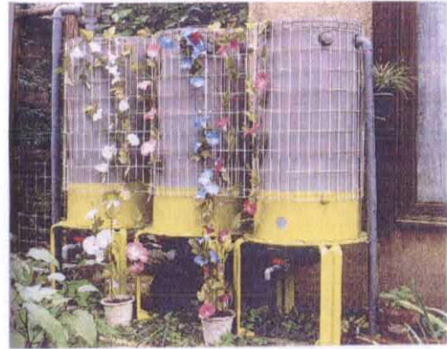
Storage Tank in House Lot