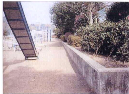
Flood Detention Wall at Public Open Space