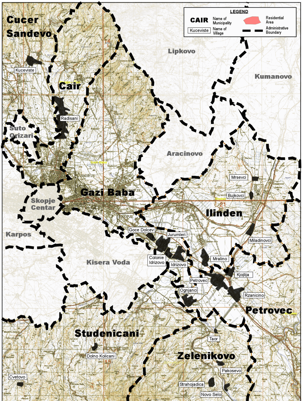
Location Map of the Project Site