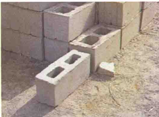
2種類のブロック (450x225x225, 450x225x150)