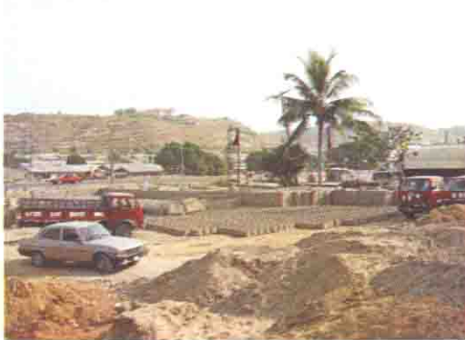
製作所の全景 (生産能力: 600~700個/日)