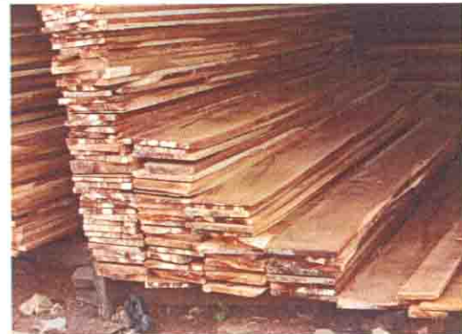
木材 1'x12' ハードウッド (材種: Achwale)