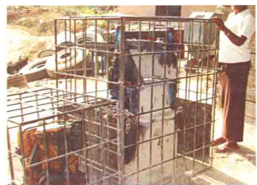
ブロック成型機 (動力: ディーゼルエンジン)