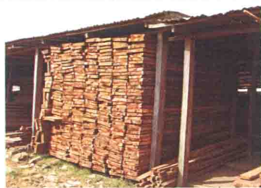
木材 2'x12' ハードウッド (材種: Obiba)