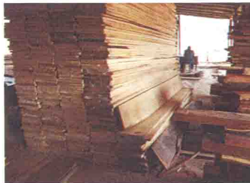
木材 1'x12' ソフトウッド (材種: Hard White)