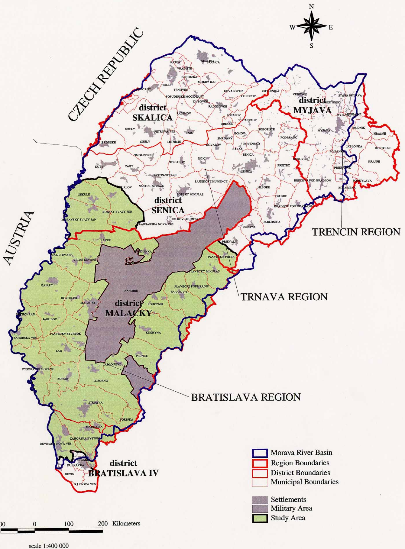
Figure C.9.1 Administrative Boundaries in the Morava River Basin